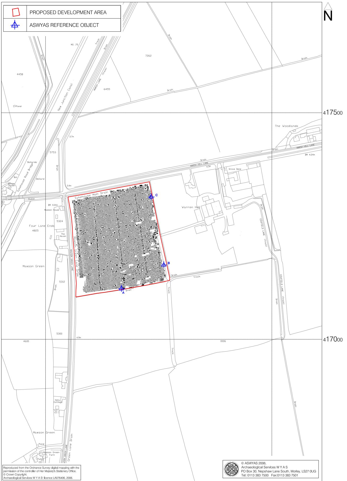
Fig. 2. Site location showing greyscale magnetometer data (1:4000 @ A4)