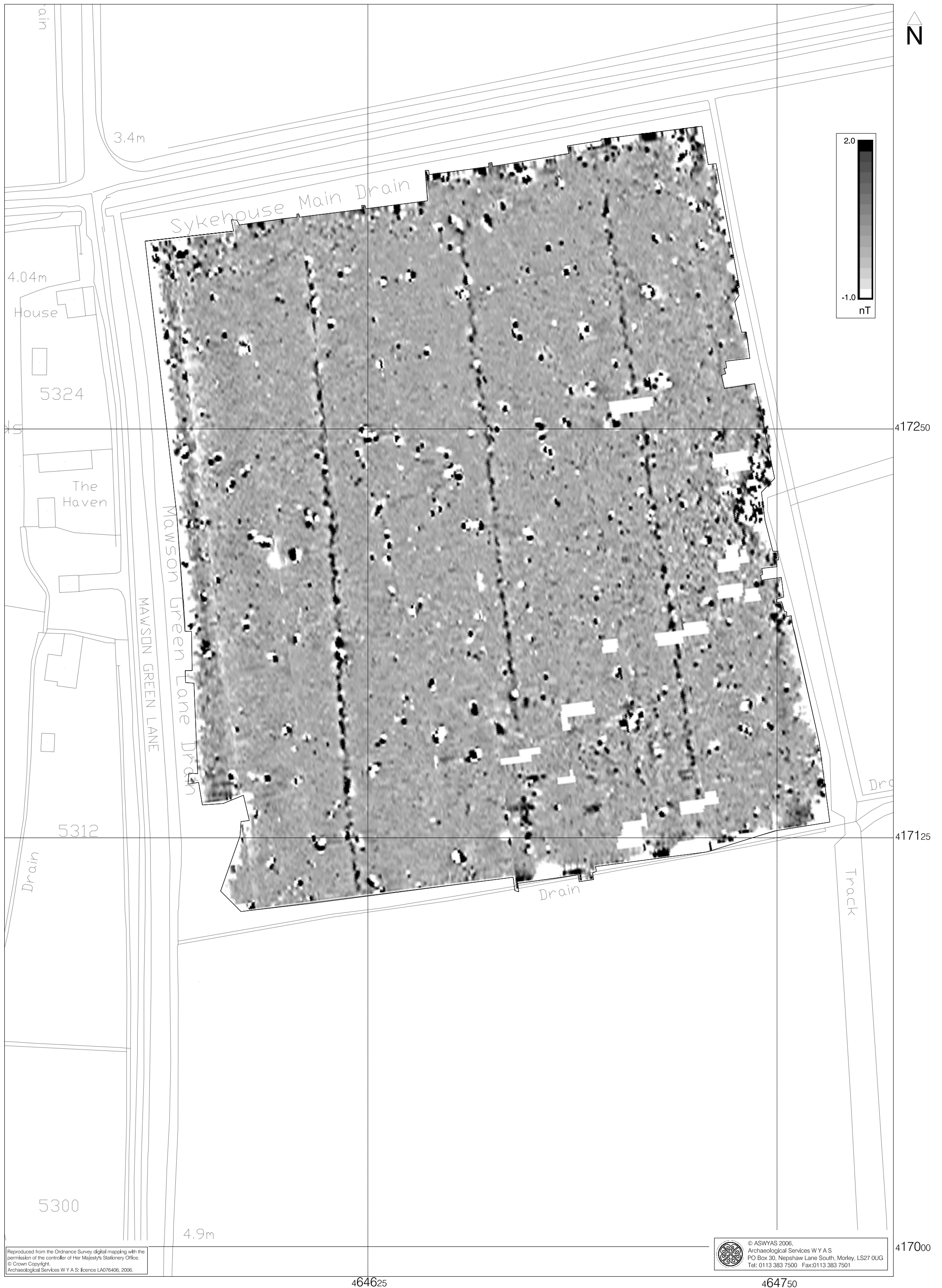
Fig. 3. Processed magnetometer data (1:1000 @ A3)