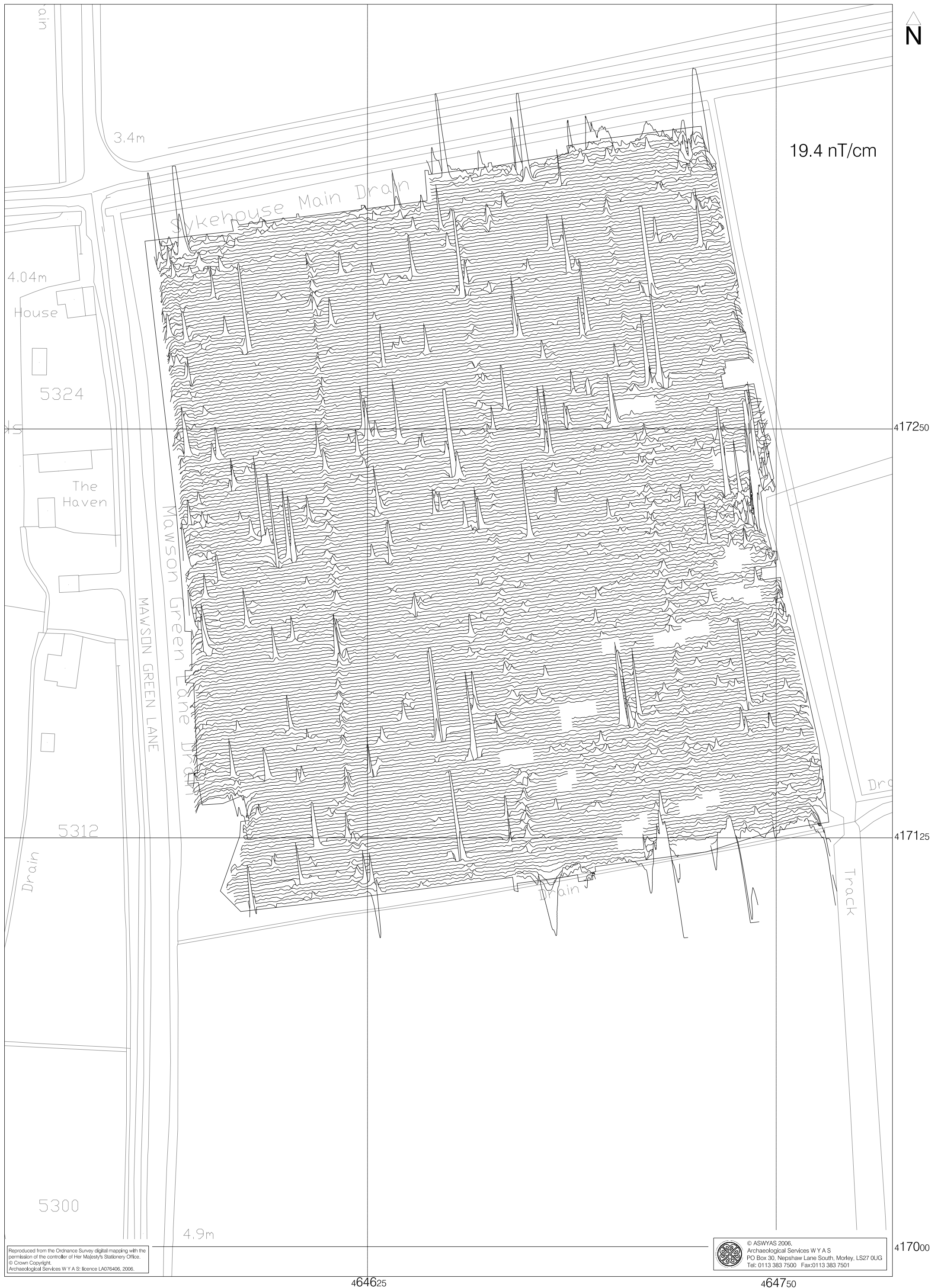
Fig. 4. XY trace plot of unprocessed magnetometer data (1:1000 @ A3)