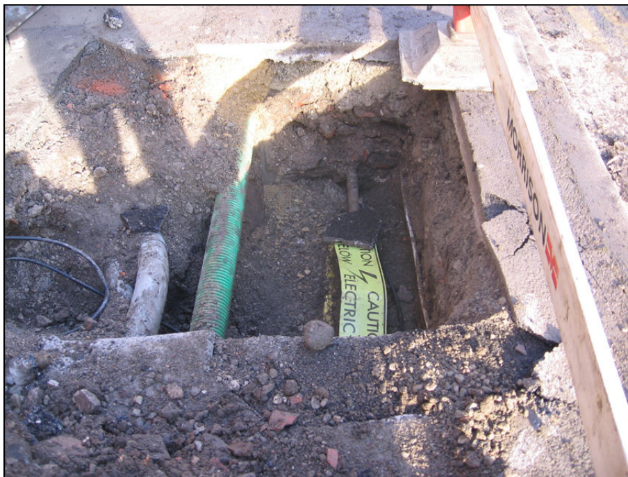
Plate 1 North-east end of trench, looking north-east