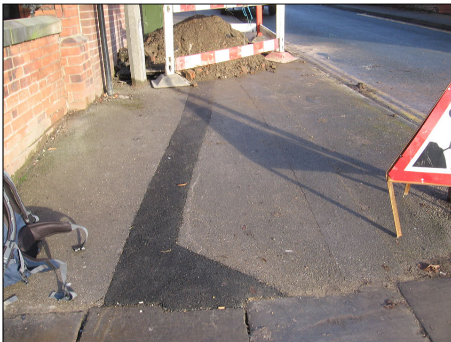
Plate 2 General view of works, looking north-east