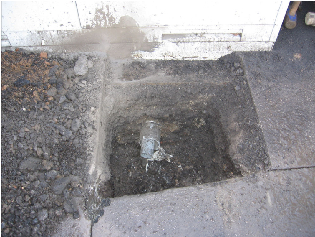
Plate 1 Eastern end of trench, looking south