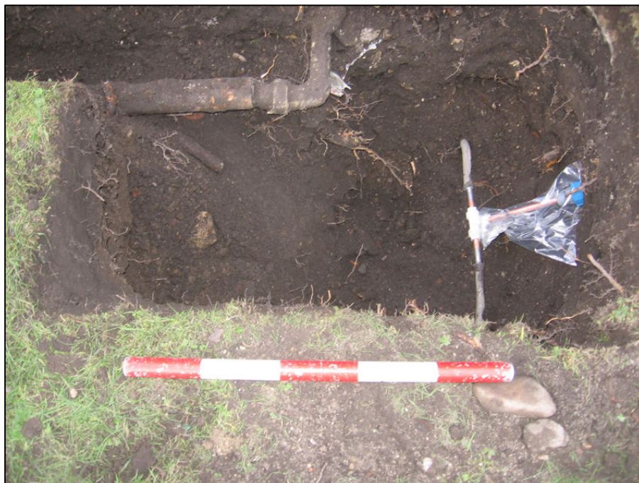
Plate 5 View of fresh water connection hole, looking north-west