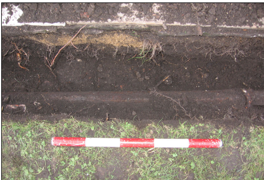
Plate 6 Detail of fresh water trench close to connection hole, looking north-west