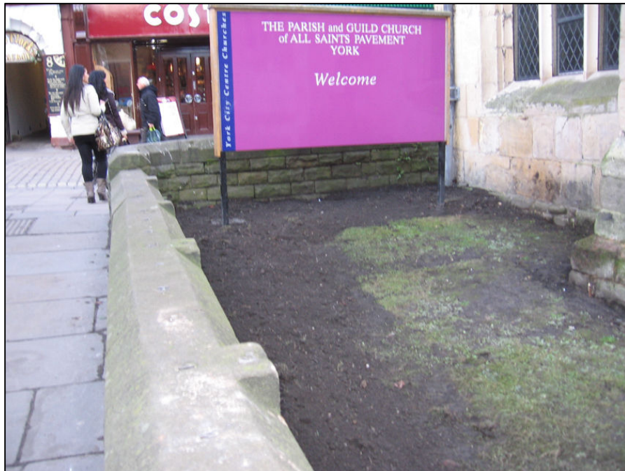
Plate 3 Part of backfilled foul water trench, looking north