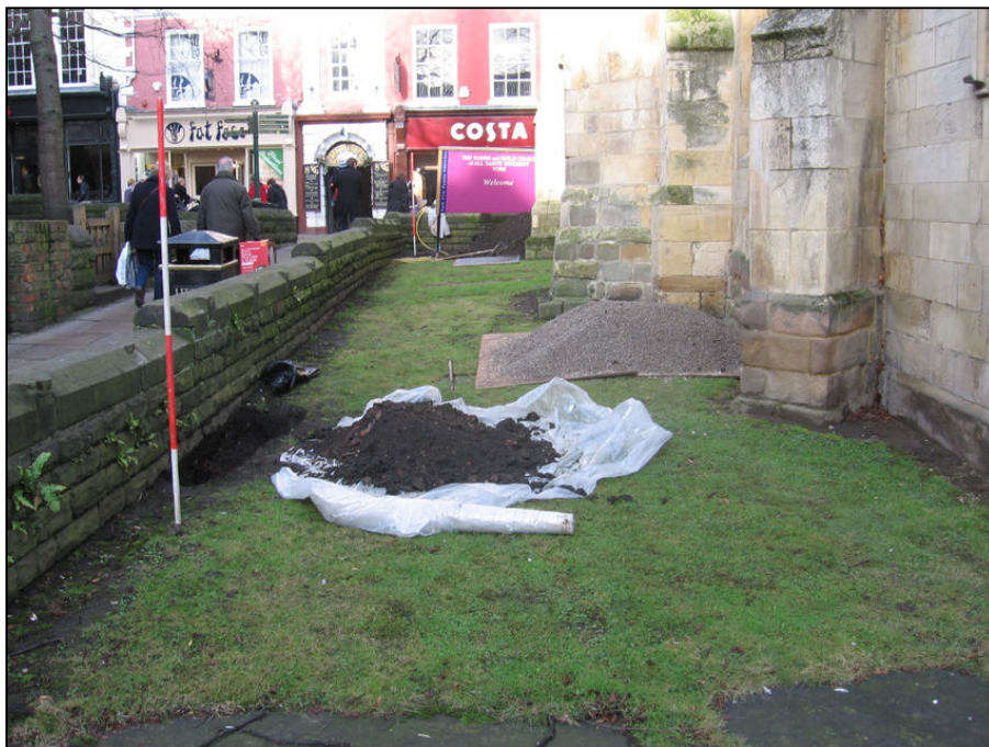
Plate 4 View of churchyard before digging of trenches, looking north-west