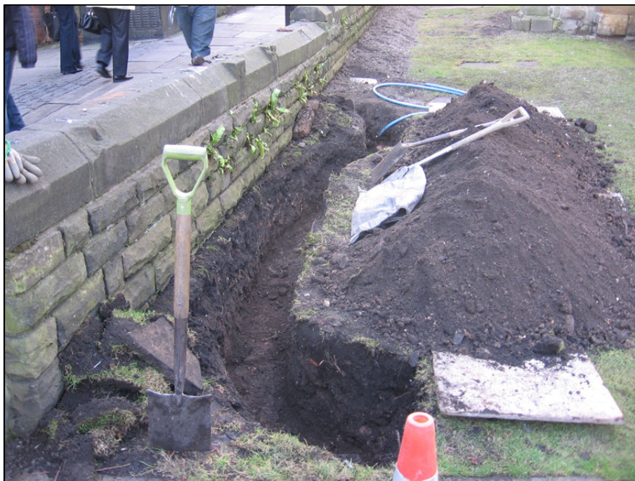
Plate 7 First part of fresh water trench with backfilled foul water trench in background Looking north-west