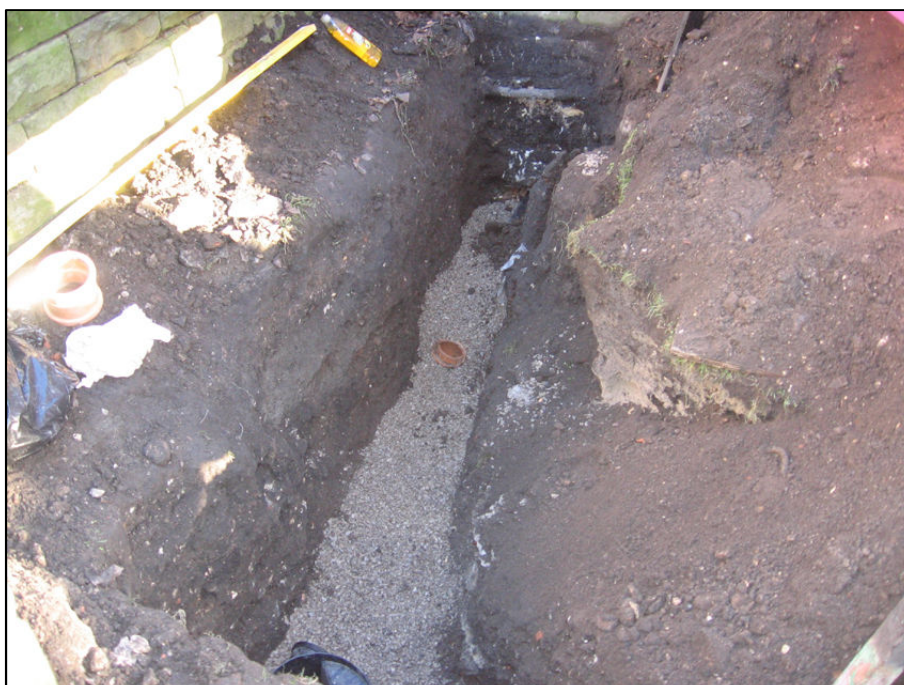
Plate 2 South-west – north-east part of foul water trench, looking north-east