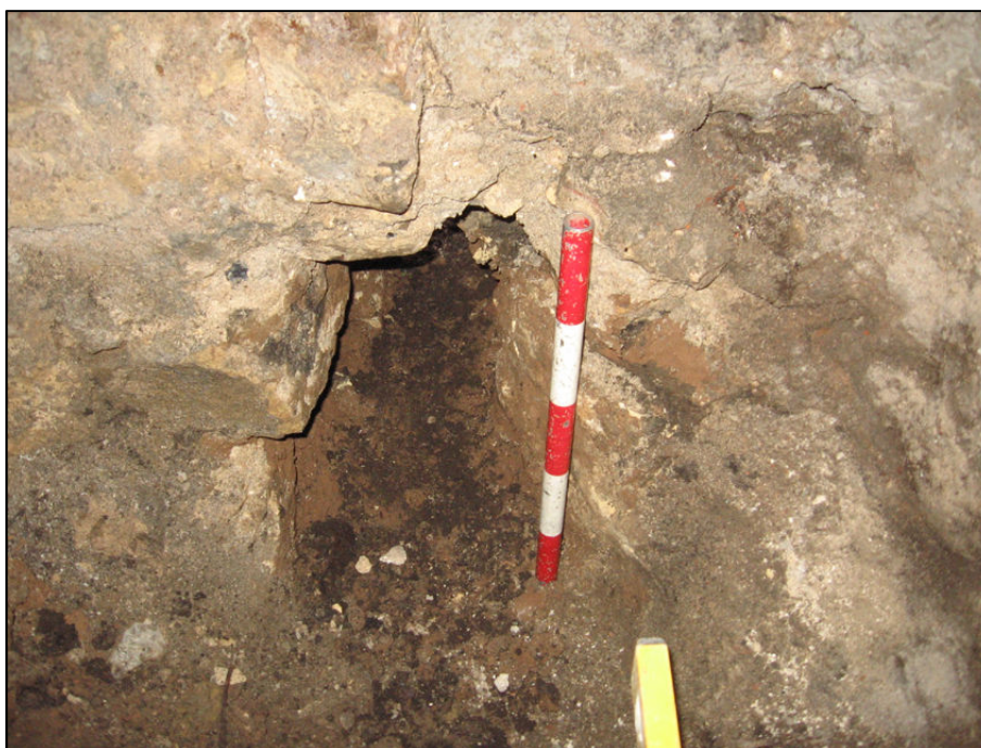
Plate 1 Detail of interior drain hole, note clay bonding, looking west