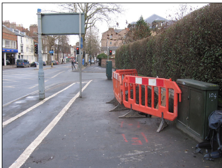
Plate 2 General view of works in progress, looking north-east