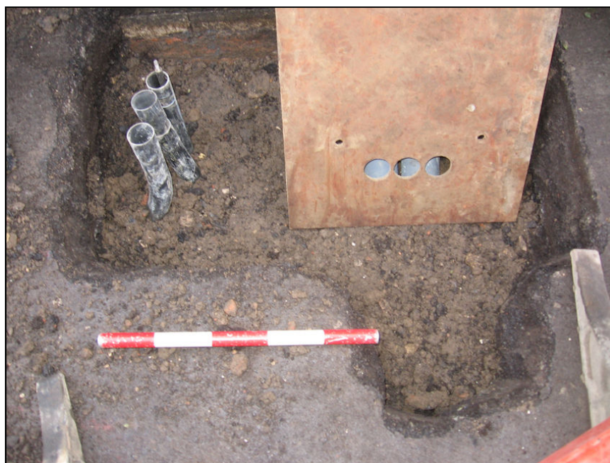
Plate 1 The new cabinet trench, looking south-east