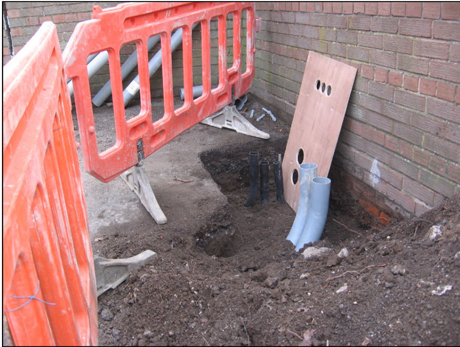
Plate 1 Trench for new cabinet, looking south-east