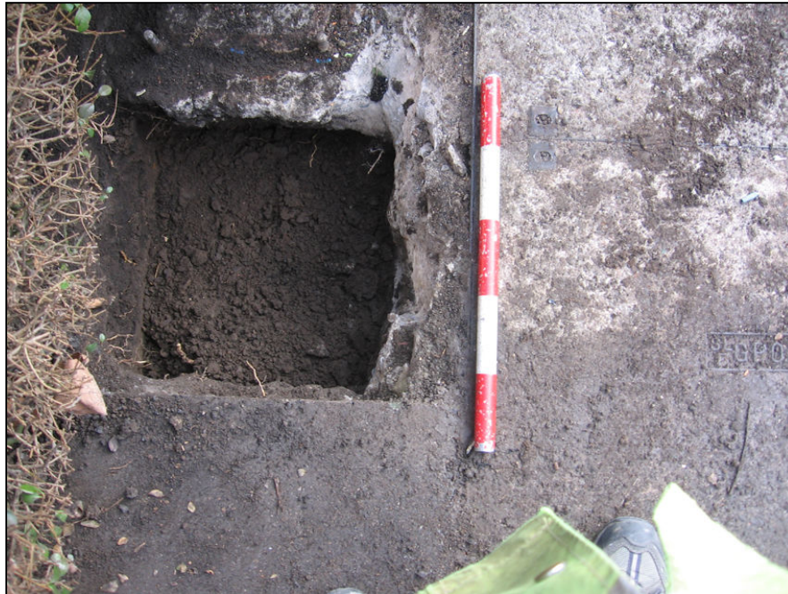
Plate 1 Part of excavation for removal of old cabinet