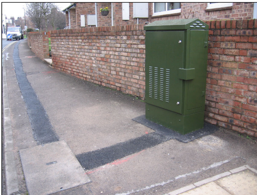
Plate 2 General view of new cabinet and connecting trenches, looking west-north-west