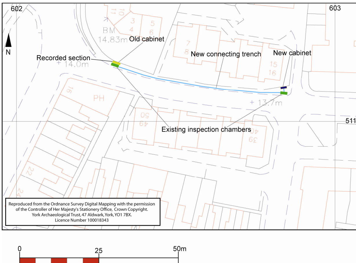
Figure 2 Location of works and recorded section

In the recorded section the earliest context noted, between 0.1 and at least 0.4m below modern ground level, was a dark brown silt with occasional flecks of pale brown mortar (1000). This was directly overlain by the modern pavement surface of tarmac (1001). There was no significant variation on this sequence at any point along the works.