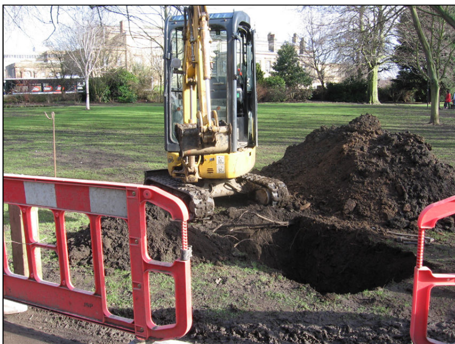
Plate 2 General view of trench, looking east-south-east