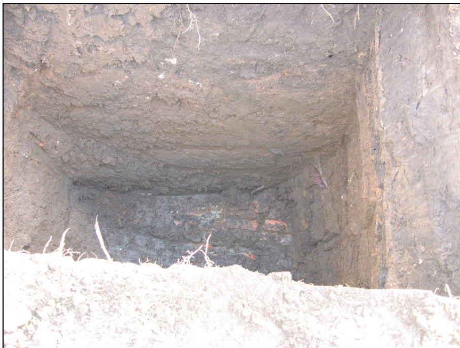
Plate 1 Interior of trench with sewer visible in base, looking south-east