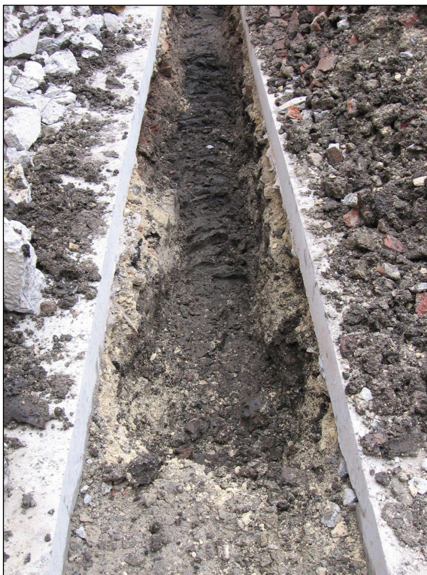
Plate 1 General view of electric trench, looking north-east

The earliest deposit noted in this section, between 0.5m BGL and at least 0.7m BGL, was a very dark greyish-brown clayey silt with occasional charcoal (10004) and above it was a 0.2m deep layer of dark brown slightly clayey silt with moderate patches of mid brown clay and occasional charcoal (10005). Overlying this was a 0.15m deep deposit of pale yellow crushed limestone with moderate brick rubble (10006) which formed the make-up for the modern ground surface of concrete (10007).