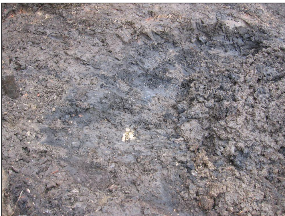
Plate 3 Detail of overall strip for extension, looking south-east

In this section the lowest deposit noted, between 1.1m BGL and at least 1.3m BGL, was a clean very dark brown / very dark grey slightly organic clayey silt (10017). Overlying this was a 0.85m deep mixture of dark greyish-brown slightly clayey silt and brick rubble with occasional pale yellow crushed limestone (10018). Sealing this was a 0.1m deep layer of very pale brown crushed limestone (10019) forming the make-up for a modern concrete floor (10020).