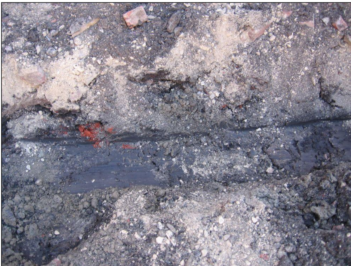
Plate 2 Detail of central part of water trench, looking south-east

The earliest deposit recorded in this section, between 0.45m BGL and at least 0.5m BGL, was a very dark brown clayey silt (10013). Above this was an horizontal brick surface (10014), 0.05m thick. Overlying this was a 0.2m deep layer of dark greyish-brown clayey silt (10015). Above this was the uppermost deposit, pale yellow crushed limestone / brick rubble (10016).