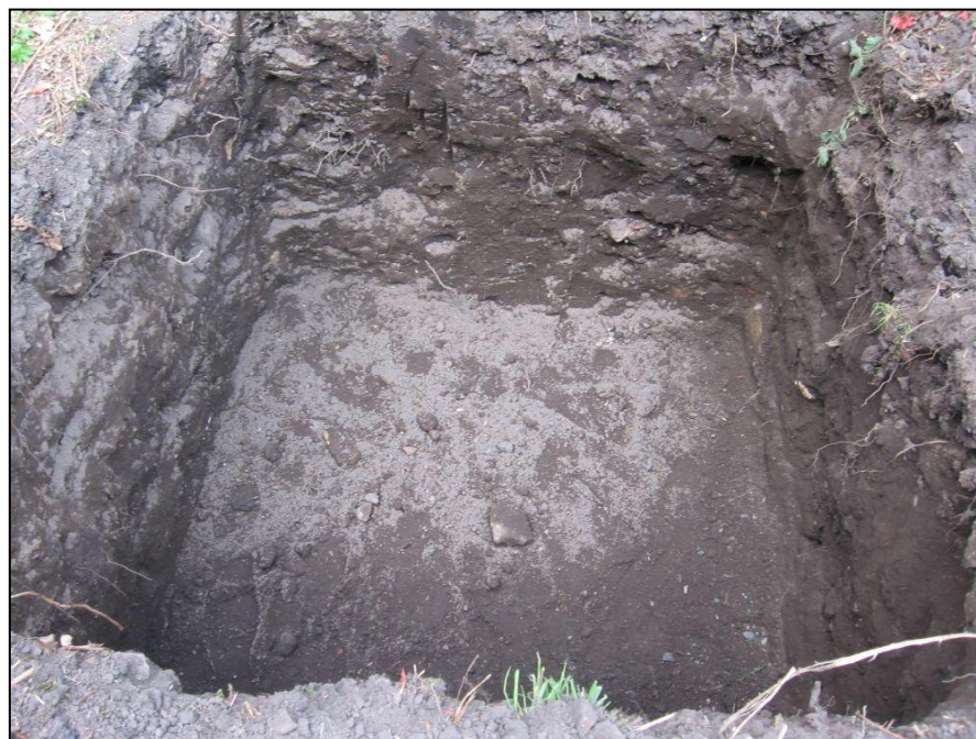
Plate 2 View of the recorded section, looking north-east