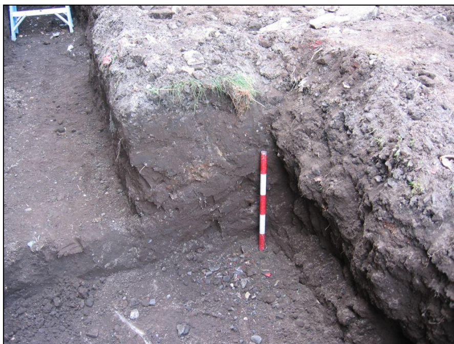
Plate 1 View of south-west trench, looking north-west