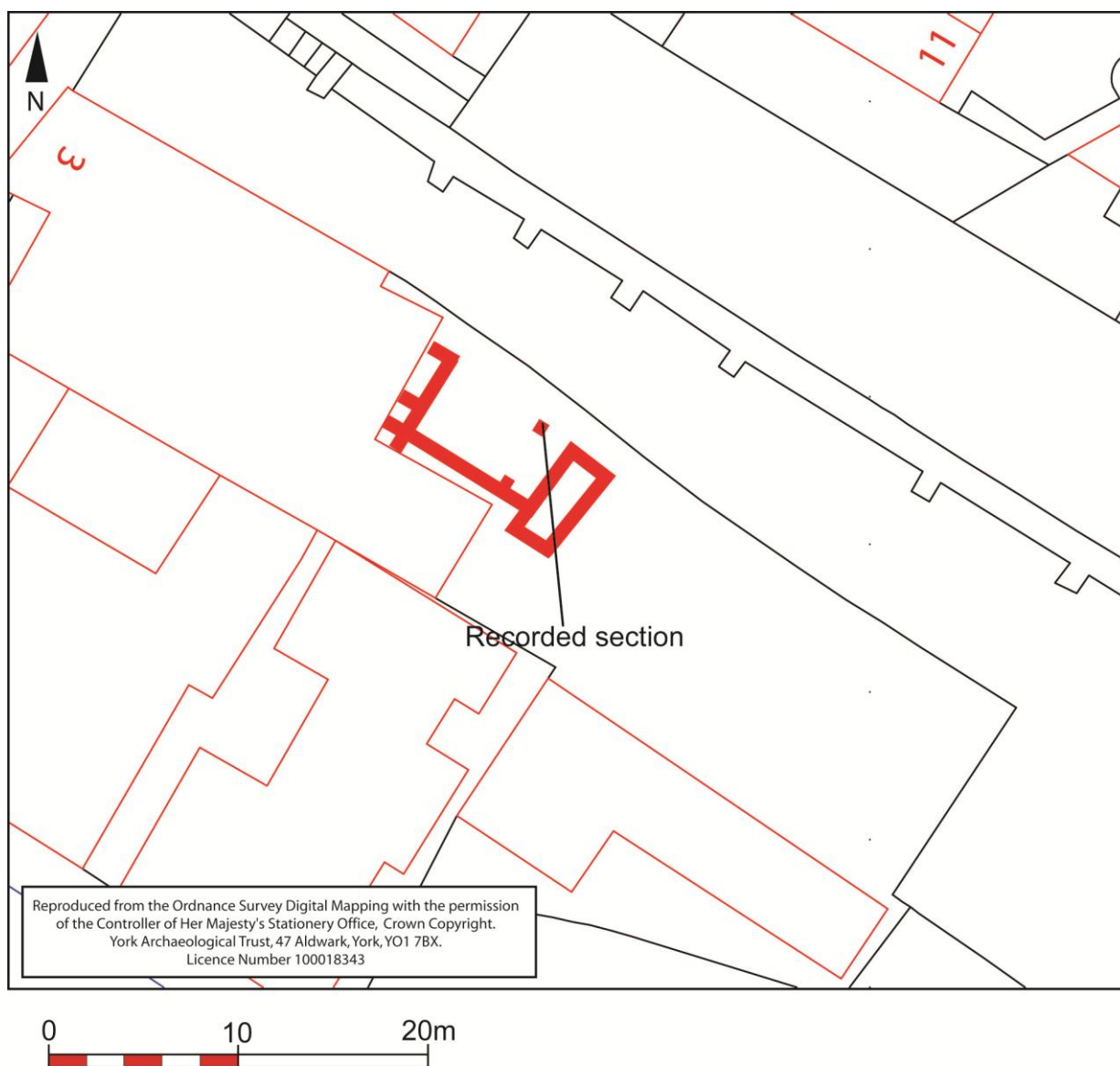
Figure 2 Location of observed trenches and recorded section

In the only recorded section, the earliest deposit noted, at between 0.7m and 1.0m below the modern ground surface, was a dark brown silt with occasional brick / tile (1000). Above this was a 0.5m deep layer of clean dark brown silt (1001). The uppermost deposit was a dark brown silt capped by roots and weeds (1002). No significant variation on this sequence was noted across the site.