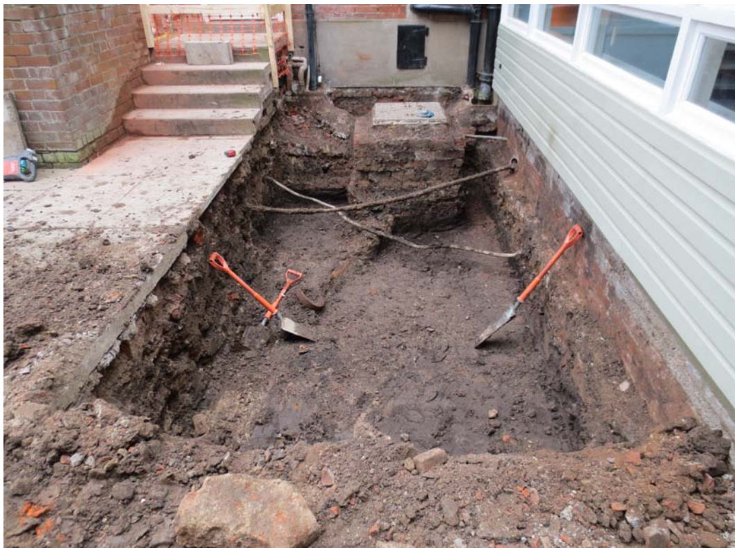
Plate 3. Services at SW end of Area 1. Looking SW.