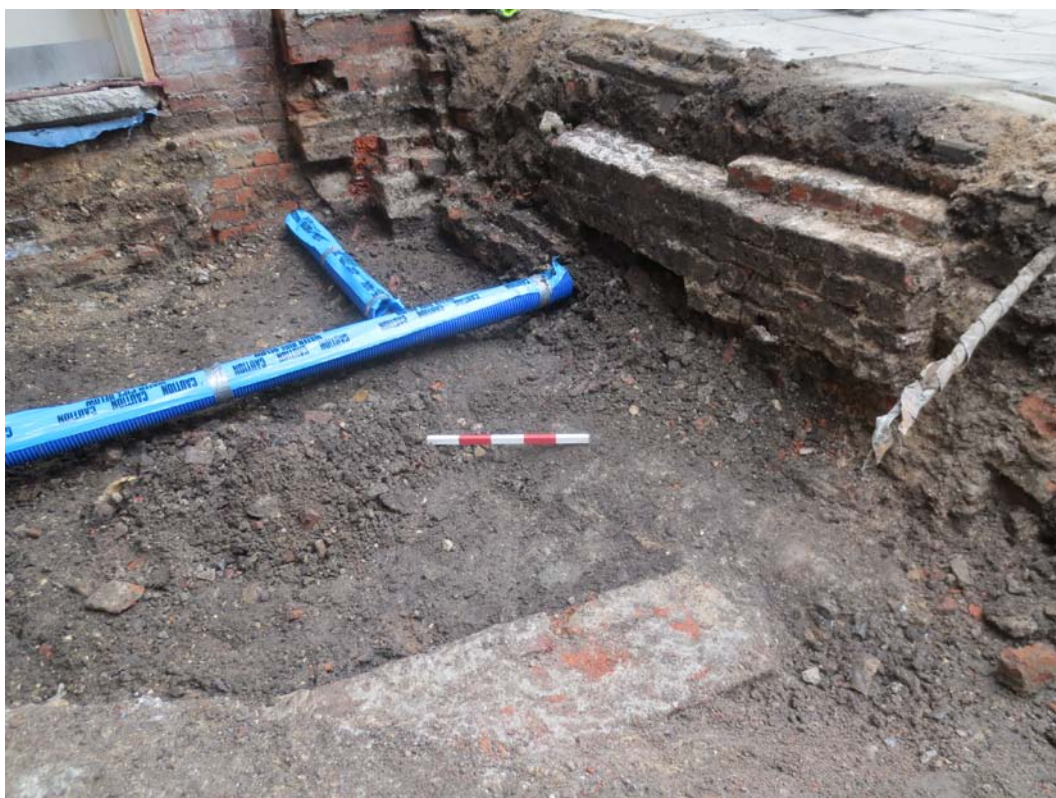
Plate 2. . Brick structure, context 115, at NE end of Area 1. Looking East, 0.10m scale divisions.

the wall was exposed. It was seen to be 0.35m wide with the bricks laid in a stretcher bond three courses in width and bonded with a hard grey mortar. It was truncated by a concrete encased drain at a distance of 0.50m from its SE end and again at 1.75m. This disturbance had dragged the wall out of alignment pulling it further to the north.