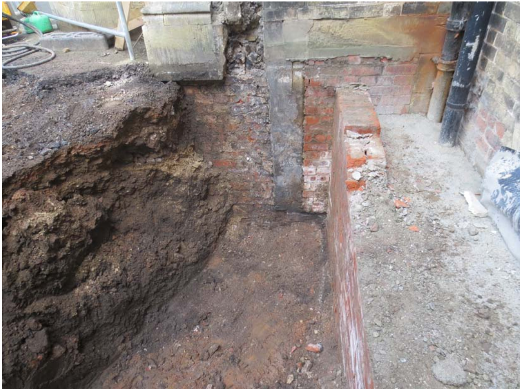
Plate 4. The NE end of the excavated trench after the NE basement wall had been removed. Note the bricked up basement door and on the right of frame and a later wall inserted to create a light well.

Throughout the latter part of the ground works the conditions were not safe to carry out detailed investigation and recording of archaeological deposits. The depth of excavation and instability of the trench edges were determining factors in this.