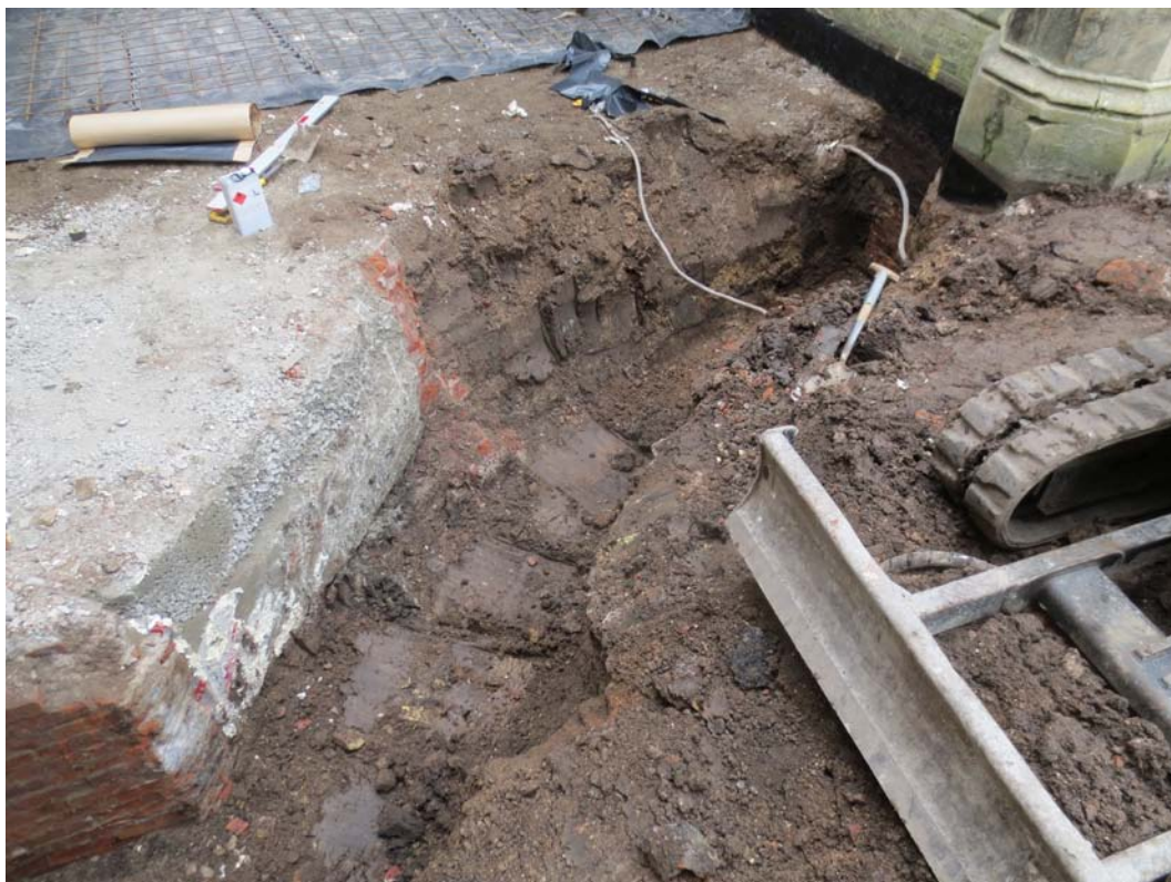
Figure 5. The NW end of the excavated trench after the NE basement wall had been removed; part of the concrete infilling of the basement can be seen on the left. Looking SW.

The earliest deposits were encountered in the trench excavated for the removal of the NE basement wall. A mottled mid brown and light brown orange silty sand was observed from 1.65m to 1.45m BGL. This material was overlaid by a deposit of dense dark brown silt, approximately 0.40m thick this material extended to a depth of 1.00m BGL (Plate 6).