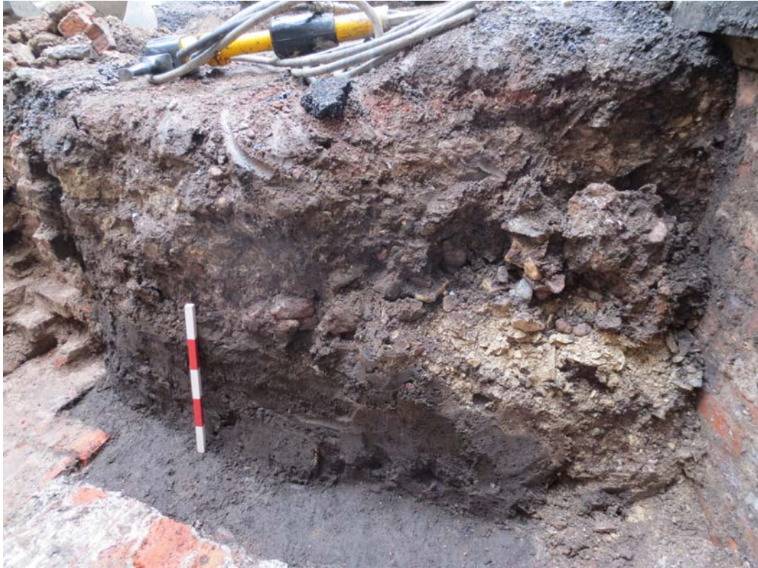
Plate 6. Loose rubble made ground overlying a dark brown silty plough soil. The construction cut and light coloured stony infill of the SE wing of the School building is visible on the right. Looking North, 0.10m scale divisions.

Located in the entrance alcove and running adjacent to the SE wing of the school, the basement structure had a sub rectangular shape in plan and was orientated on a NE to SW axis. It measured 10.50m long and between 1.40m and 3.00m wide with the floor at c1.10m BGL, the excavated NE wall footings however were found to extend to a depth of c1.65m BGL. The NE end of the curving NE wall butted up against the standing SE wing of the school building from a point directly below a buttress (removed as part of the extension works), and adjacent to the NW side of the doorway used to access the basement (Plate 4). The SW end of the NW basement wall butted up against part of the school that post dates the SE wing (Plate 7).