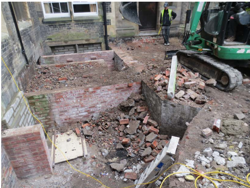
Plate 7. Basement in Area 2. The curving NE wall can be seen in the foreground and the NW wall in the centre of the frame. The later walls run from left to right. Looking South.

Beyond the NW wall of the basement rubble identical to that seen at the north end of the excavation area was encountered, this extended to the formation depth.