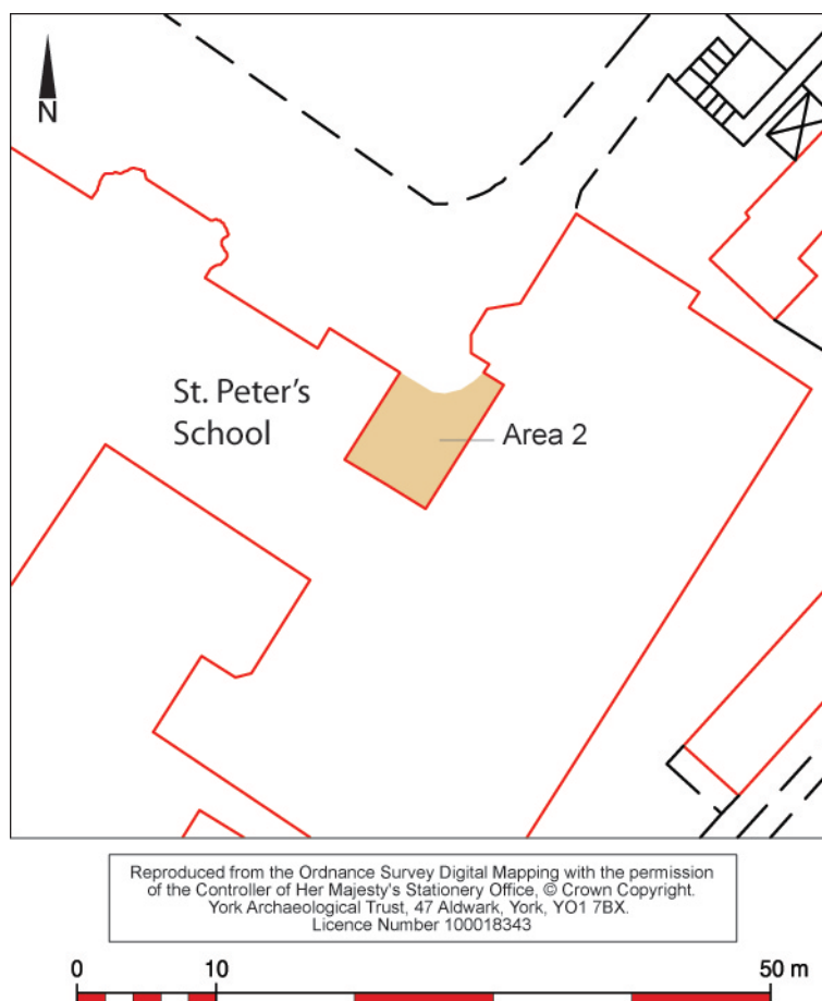
Figure 4. Area 2.