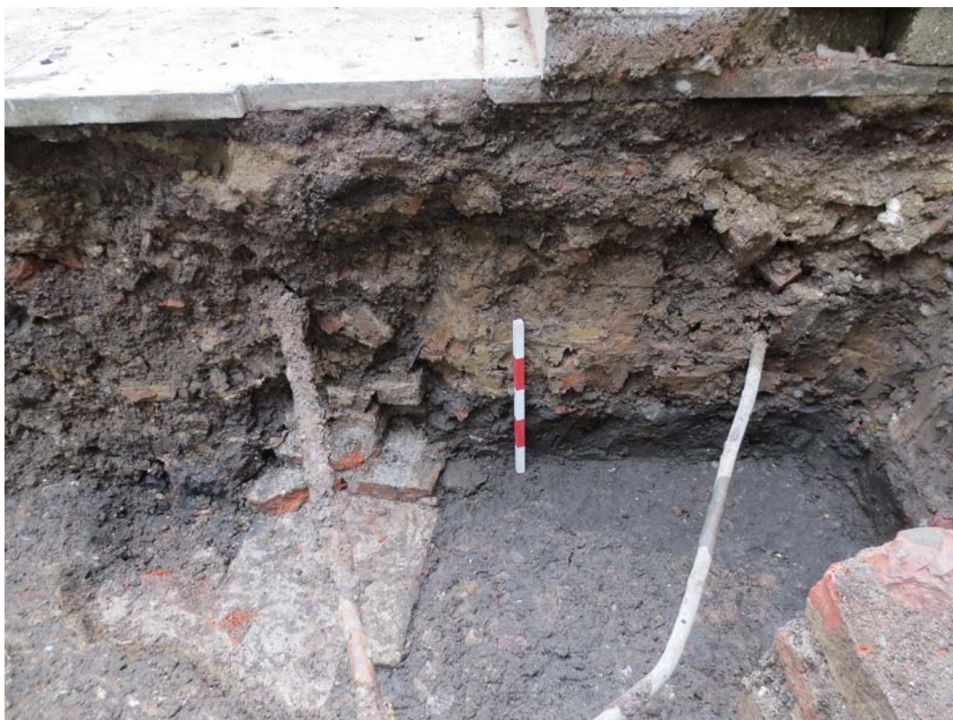
Plate 1. This Plate shows the area of Section 1 and includes Wall 109. Looking SE, 0.10m scale divisions.

Two brick structures extended into Area 1. From the SE side of the trench, approximately 2.30m from the SW end, a brick wall, context 109, extended into the trench on a SSE – NNW alignment (Plate 1). Although disturbed by a later concrete encased drain a small fragment of the wall could be seen returning on a NNE alignment. The wall was three courses wide with the bricks laid in a stretcher bond and bonded with a hard light gray mortar. In section this structure was observed to survive to a height of five courses, extending up to 0.75m BGL. Despite the top of this structure being disturbed the original construction cut, context 110, was seen to survive to 0.40m BGL in section. Here the SW side of 110 was observed to cut clay deposit 112 (Figure 3). Above the intact remains of wall 109, context 107 consisting of loose rubble, filled in the upper extent of cut 110.