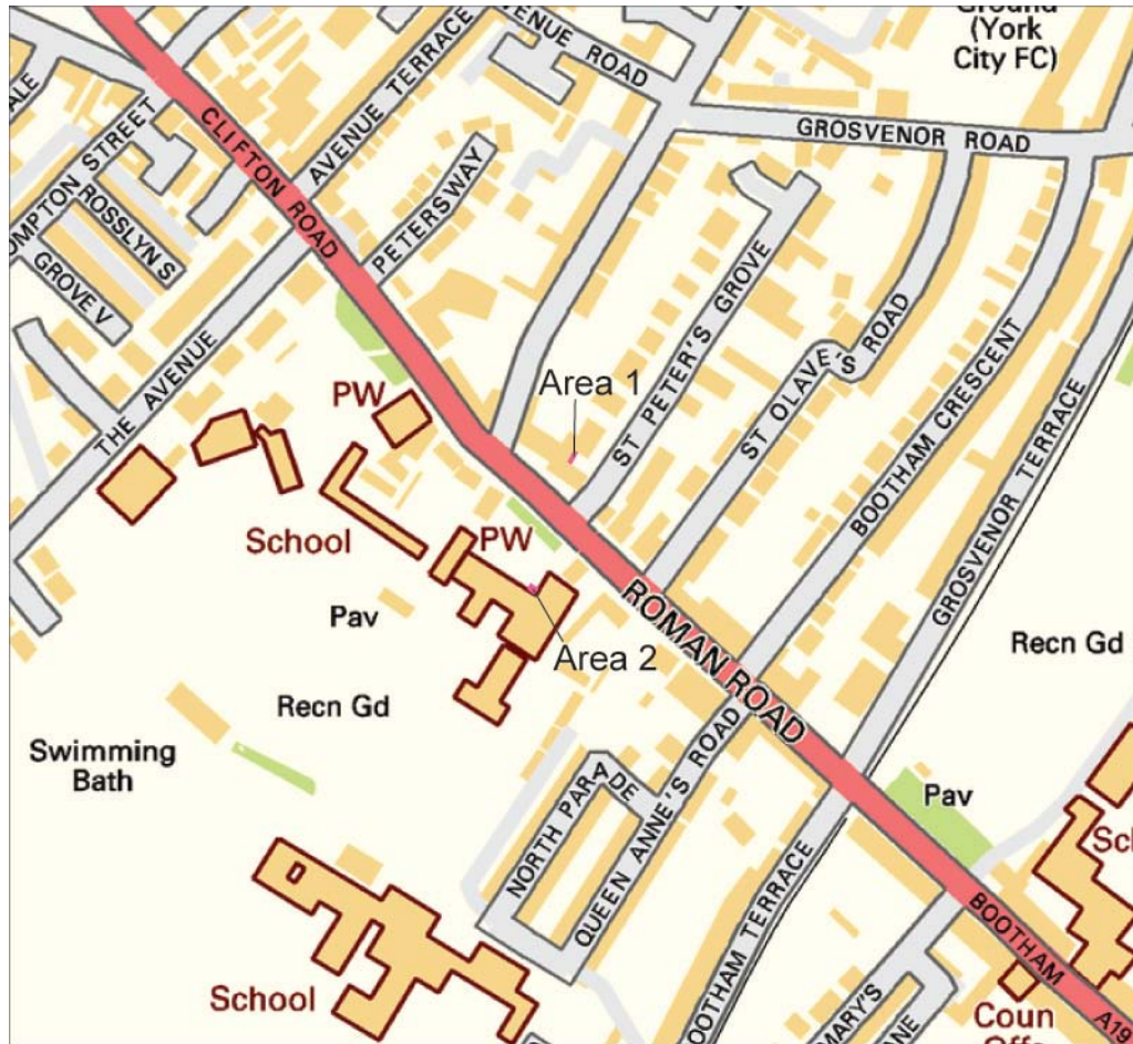
Figure 1. Site Location.

Between the 1 st and 9 th of April 2014 York Archaeological Trust undertook an archaeological Watching Brief at St. Peter's School, York (Figure 1). Sited in a small court yard on the southeast side of Manor Boarding House, Area 1 was the site of foundation excavation for an extension. Located in an entrance alcove space on the north side of St. Peter's School House, Area 2 was the site of excavations for a new main entrance.