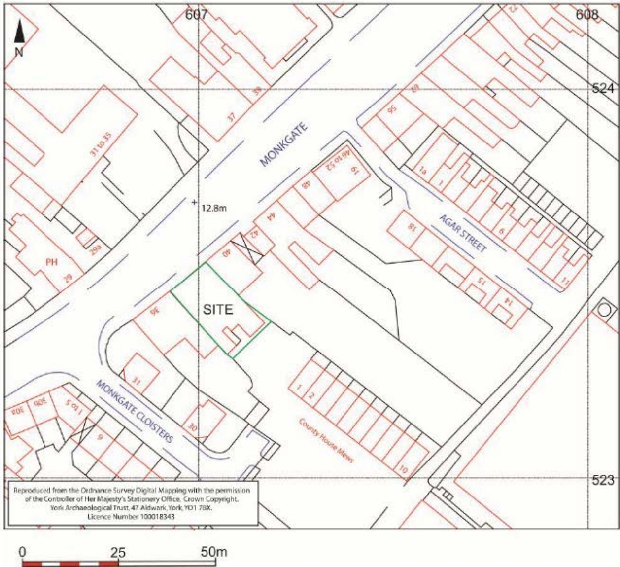
Figure 2 Location of 38 Monkgate, outlined in green