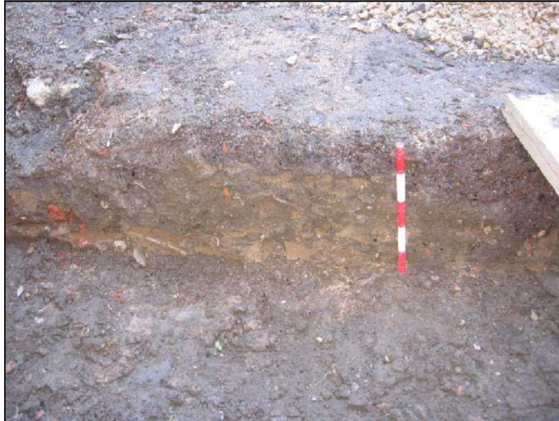
Plate 3 Detail of Section 5, looking south-east