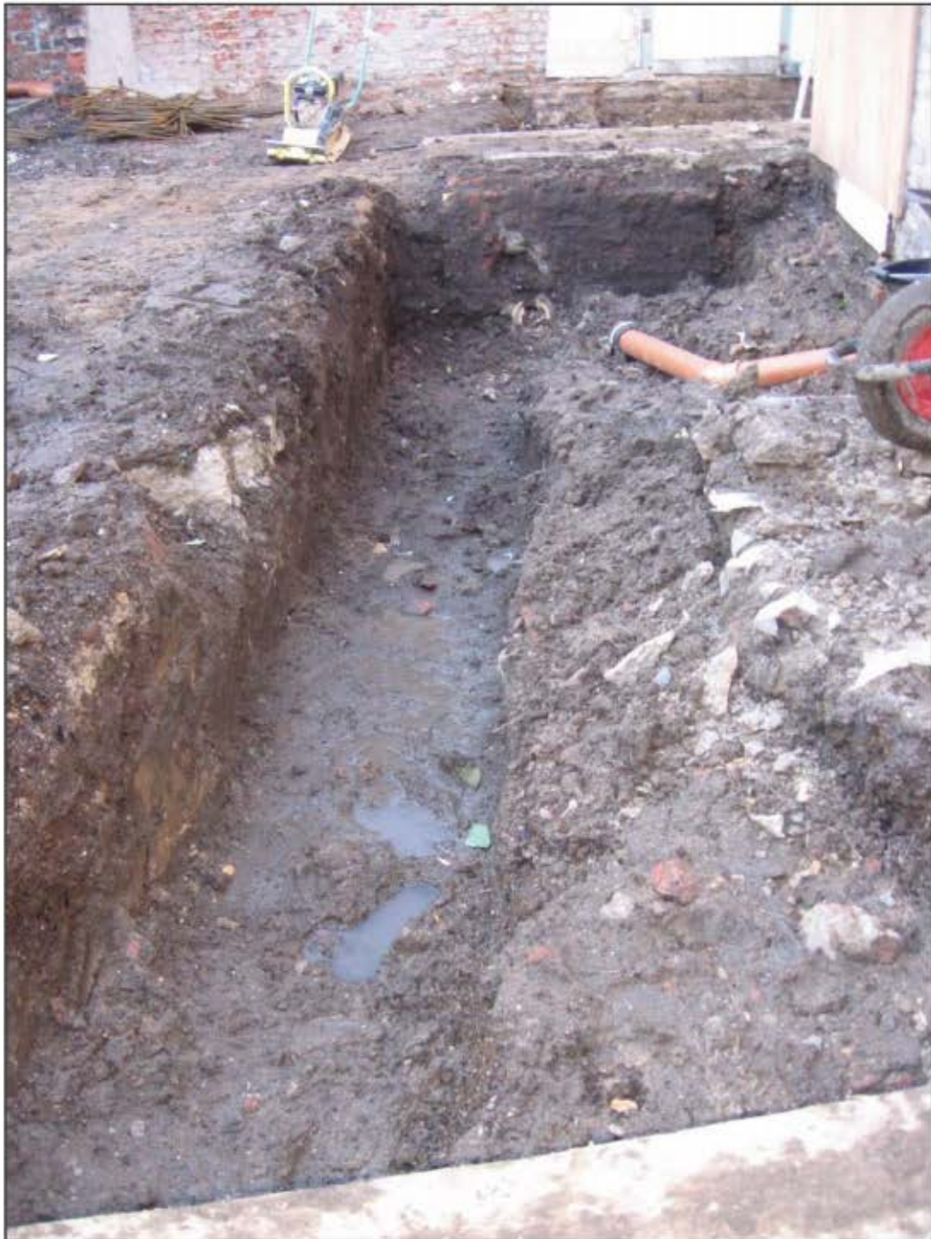
Plate 2 Foundation trench in vicinity of Sections 4 and 5, looking south-west