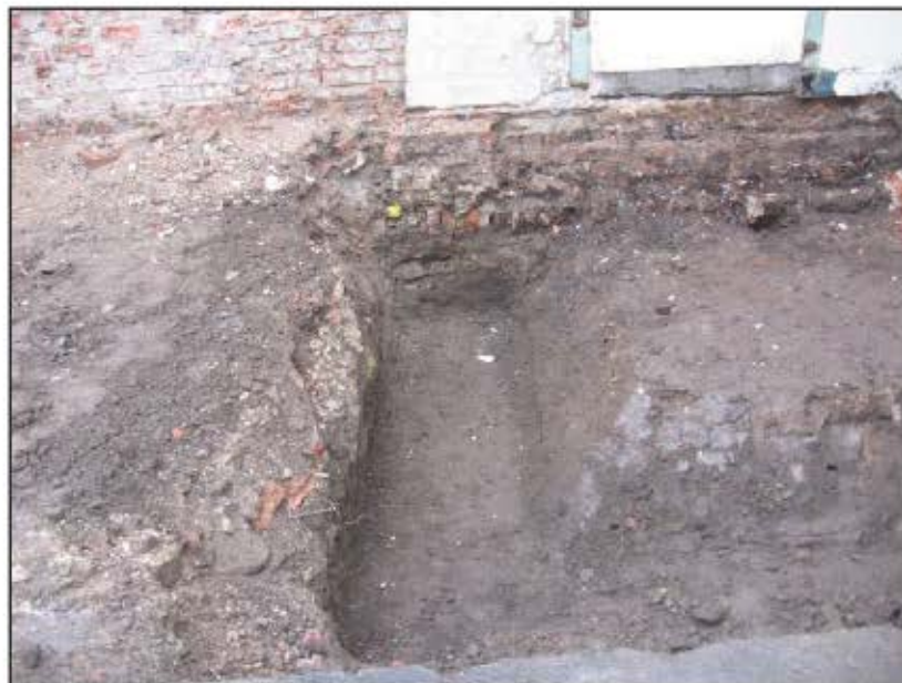
Plate 1 Foundation trench in vicinity of Section 3, looking south-west