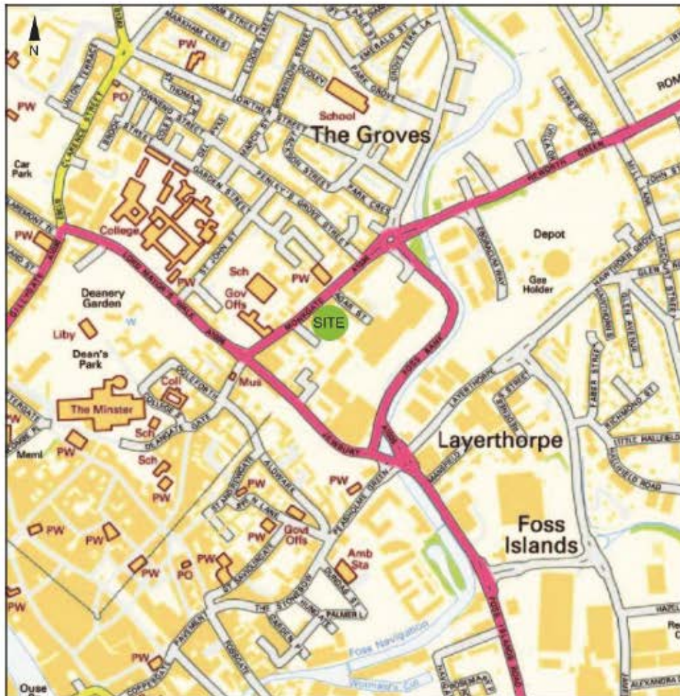
Figure 1 Site location Contains Ordnance Survey data © Crown copyright and database right 2010

Between 3 rd and 13 th of February 2014 York Archaeological Trust undertook a watching brief at the rear of Middleton House, 38 Monkgate, York. The objective was to record any archaeological deposits, features or buried structures during demolition and construction works at the south-east end of the building during its conversion into apartments. Initially the works were observed on a continuous basis but when it became apparent that there were limited amounts of archaeology the site was visited on a less continuous basis during periods of digging. Due to the restricted access to the site all excavation had to be by hand. A total of five specimen sections were recorded and are described below.