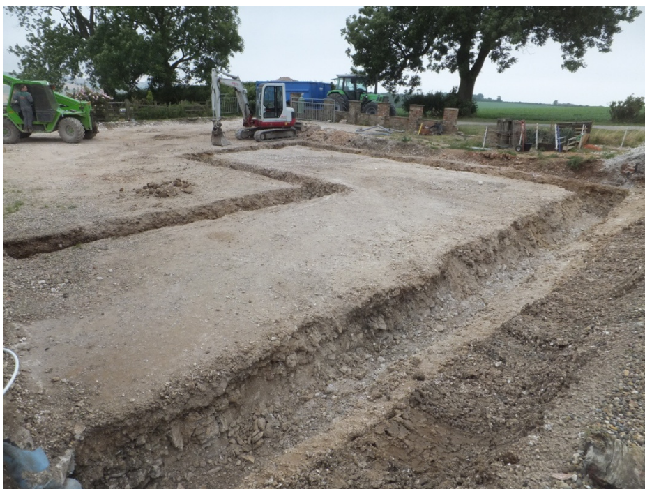
Plate 2 View of foundation trenches looking south-west