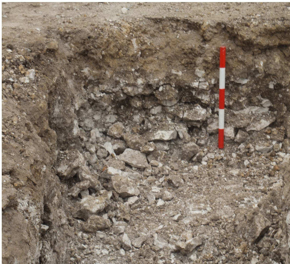
Plate 5 south leg, south-east corner looks south, showing slabby chalk

This Report has been prepared solely for the person/party which commissioned it and for the specifically titled project or named part thereof referred to in the Report. The Report should not be relied upon or used for any other project by the commissioning person/party without first obtaining independent verification as to its suitability for such other project, and obtaining the prior written approval of York Archaeological Trust for Excavation & Research Limited ("YAT"). YAT accepts no responsibility or liability for the consequences of this Report being relied upon or used for any purpose other than the purpose for which it was specifically commissioned. Nobody is entitled to rely upon this Report other than the person/party which commissioned it. YAT accepts no responsibility or liability for any use of or reliance upon this Report by anybody other than the commissioning person/party.