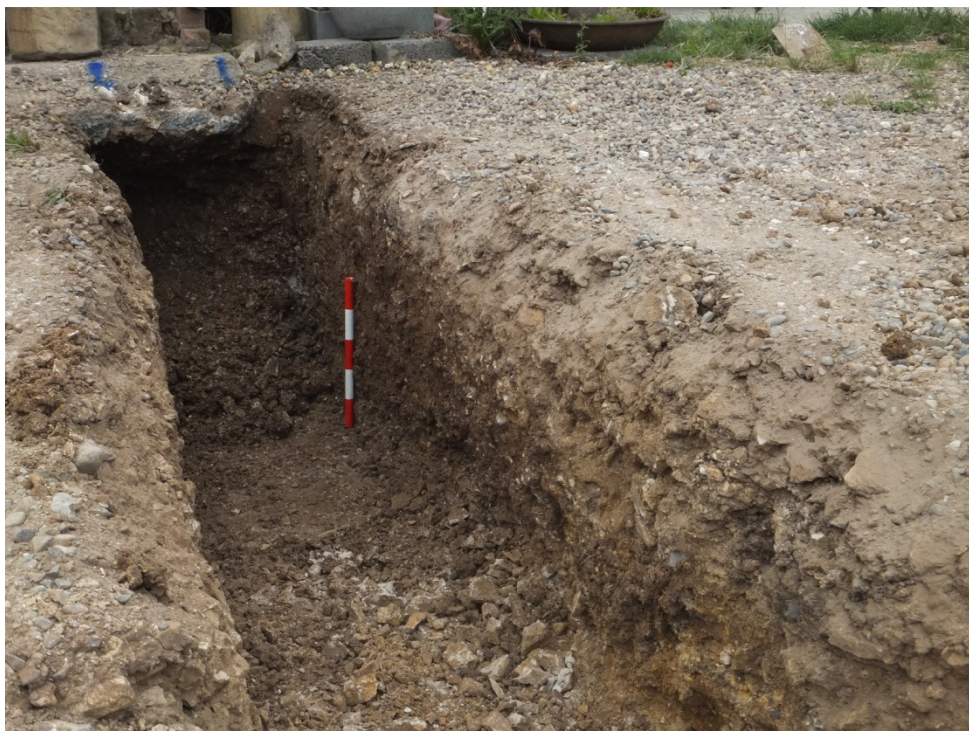
Plate 4 south foundation trench (east end) looks south, showing silty clay deposit beyond the chalk