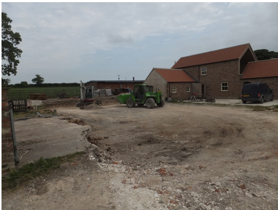
Plate 1 View of site looking north-east