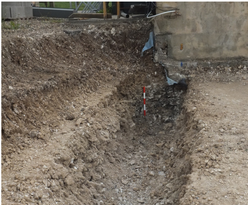
Plate 3 north foundation trench looking east, showing the reduced ground level of the site to south