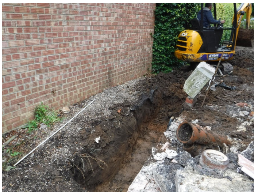
Plate 6. Trench C facing north-west, showing the gas connection box and Context 1001.