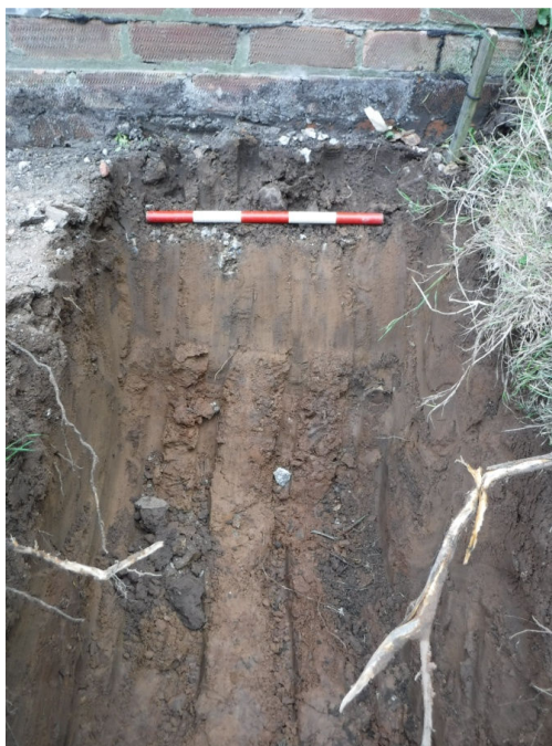
Plate 1 Trench A facing north-west, showing Contexts 1007-8. Scale unit 0.1m