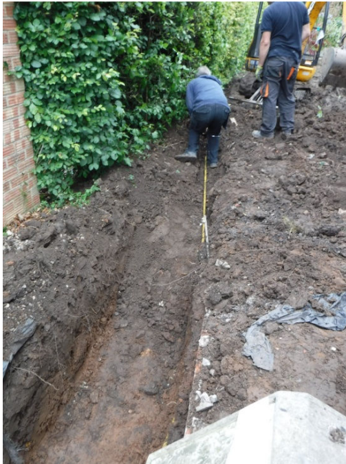
Plate 7 Careful exposure of the gas connection pipe facing north-west