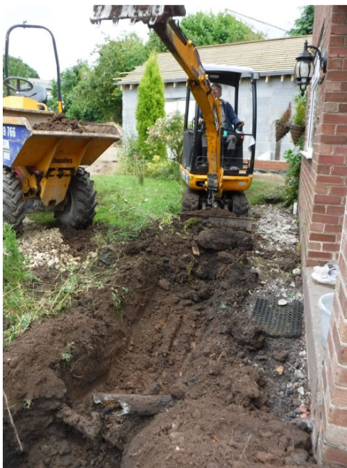
Plate 9 Excavation of Trench D facing north-east.

This Report has been prepared solely for the person/party which commissioned it and for the specifically titled project or named part thereof referred to in the Report. The Report should not be relied upon or used for any other project by the commissioning person/party without first obtaining independent verification as to its suitability for such other project, and obtaining the prior written approval of York Archaeological Trust for Excavation & Research Limited ("YAT"). YAT accepts no responsibility or liability for the consequences of this Report being relied upon or used for any purpose other than the purpose for which it was specifically commissioned. Nobody is entitled to rely upon this Report other than the person/party which commissioned it. YAT accepts no responsibility or liability for any use of or reliance upon this Report by anybody other than the commissioning person/party.