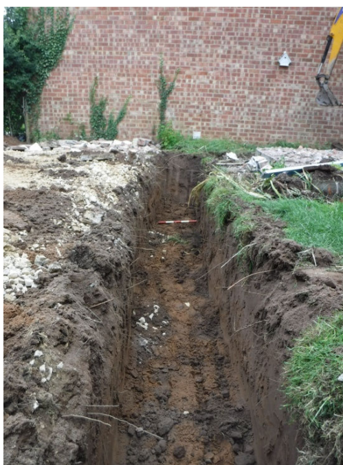
Plate 2 Trench B facing south-west showing Contexts 1000 and 1007-8. Scale unit 0.1m.