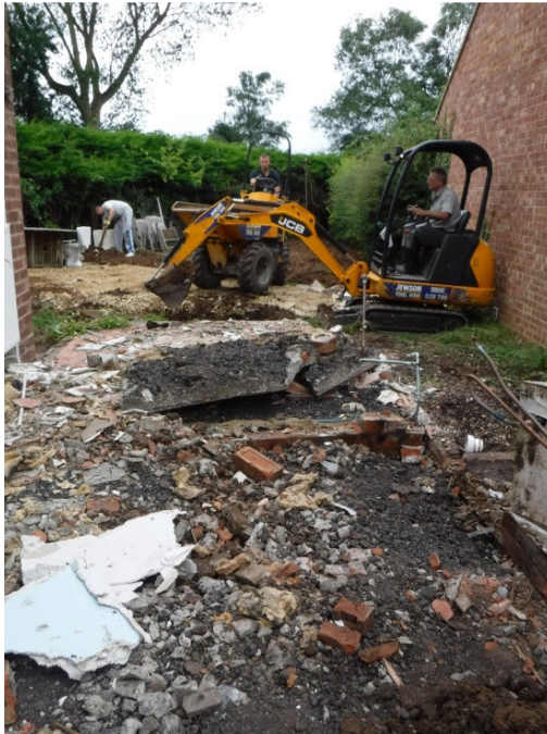
Plate 3 The area of the former garage and concrete slab of the former utility room to the south-west of the present house