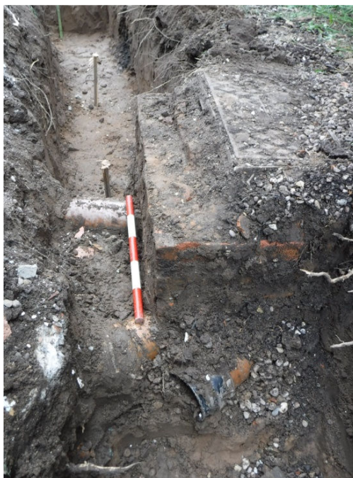
Plate 5 Manhole 1006 facing south-east. Scale unit 0.1m