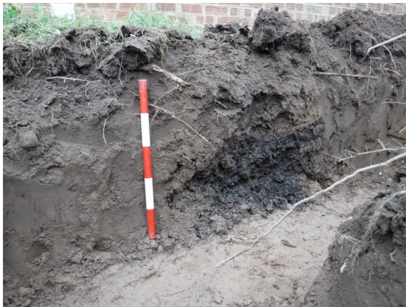
Plate 4. Context 1006 facing south-west. Scale unit 0.1m