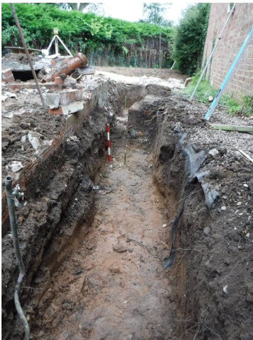
Plate 8 Trench C facing south-east shoeing Context 1003 along the left side of the trench. Scale unit 0.2m