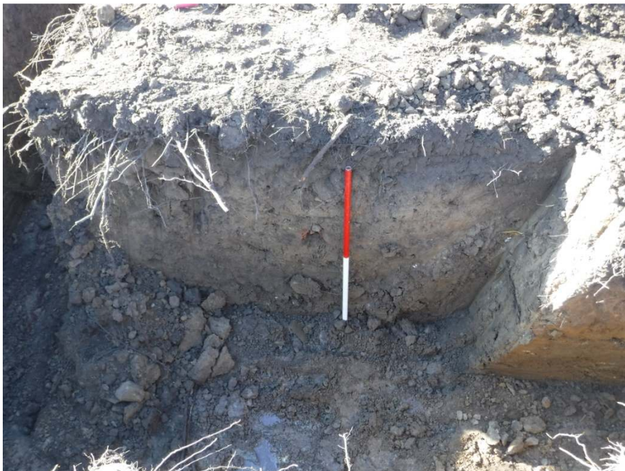
Plate 2: North east facing section of the central strip foundation with the ceramic field drain visible.