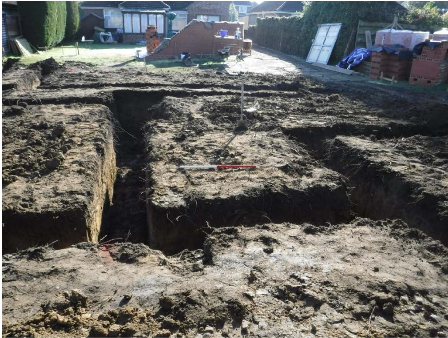
Plate 1: General shot, facing south east across development site during works.