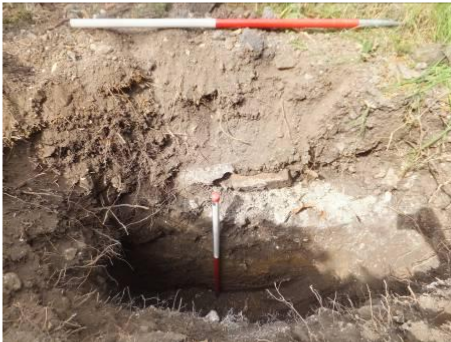
Plate 3: South-east facing section of test pit. Scale units 0.5m.

This Report has been prepared solely for the person/party which commissioned it and for the specifically titled project or named part thereof referred to in the Report. The Report should not be relied upon or used for any other project by the commissioning person/party without first obtaining independent verification as to its suitability for such other project, and obtaining the prior written approval of York Archaeological Trust for Excavation & Research Limited ("YAT"). YAT accepts no responsibility or liability for the consequences of this Report being relied upon or used for any purpose other than the purpose for which it was specifically commissioned. Nobody is entitled to rely upon this Report other than the person/party which commissioned it. YAT accepts no responsibility or liability for any use of or reliance upon this Report by anybody other than the commissioning person/party.