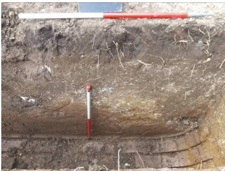
Plate 2: North-east facing section of north-west/south-east aligned foundation trench. Scale unit 0.5m.