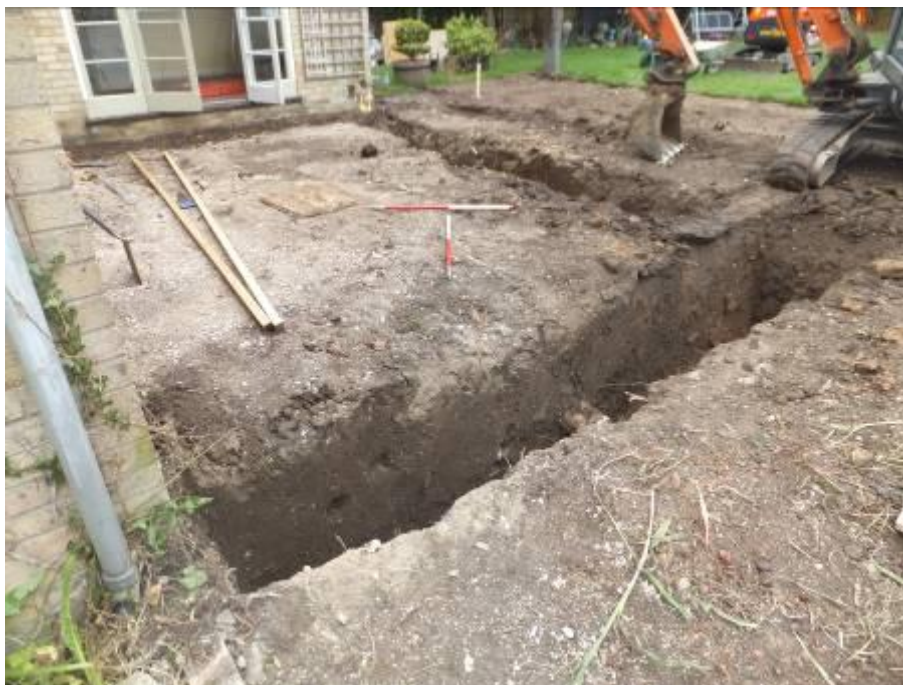
Plate 1: General view of the double storey extensions foundation trenches facing north. Scale unit 0.5m.