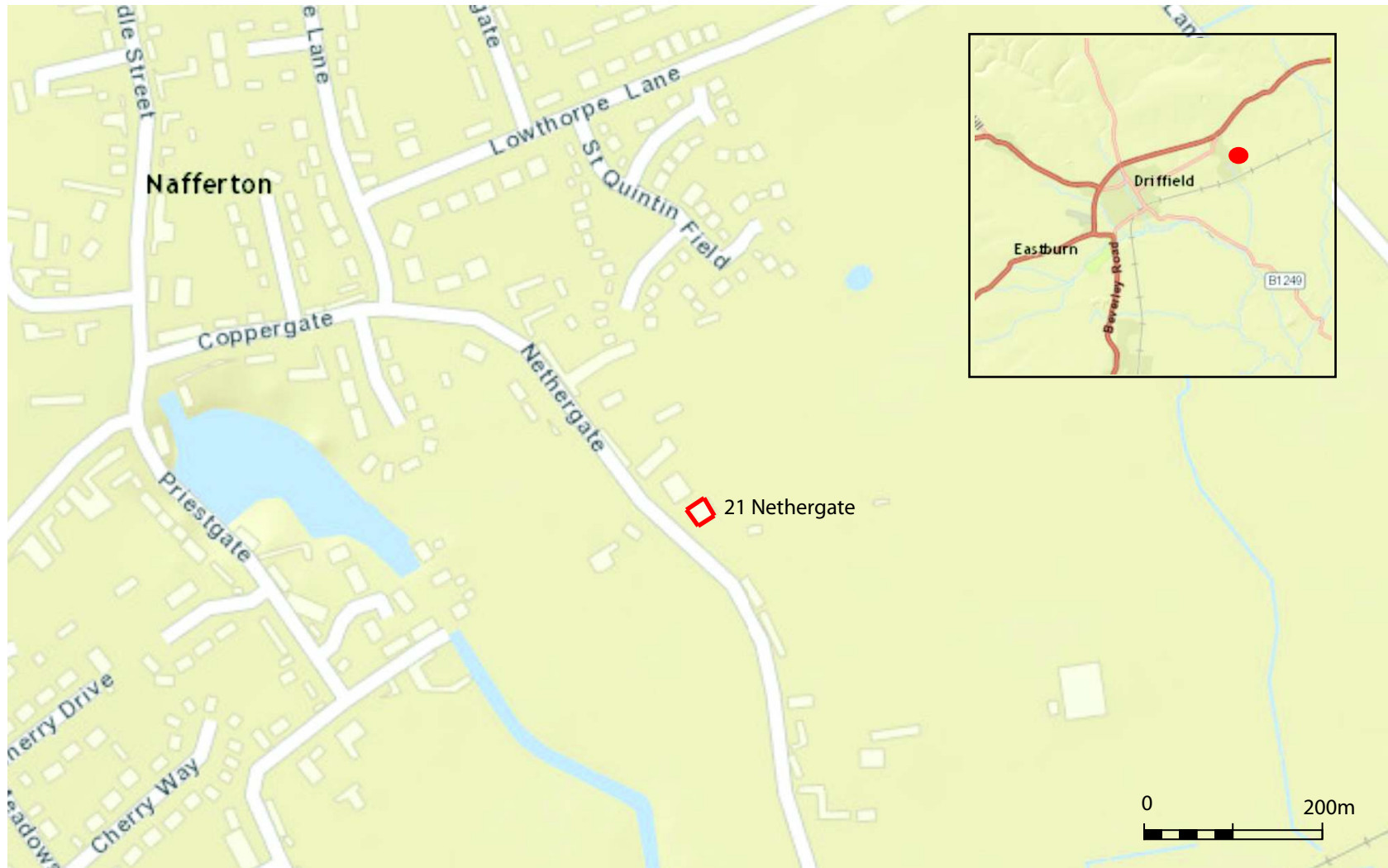
Fig. 1 Site location