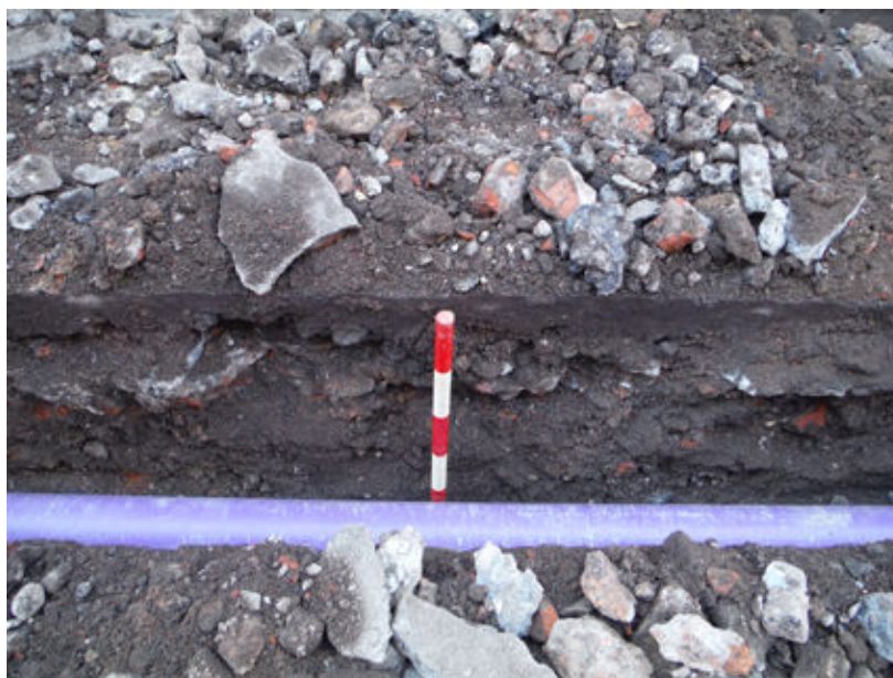
Plate 2: Section of trench in High Petergate, looking SW