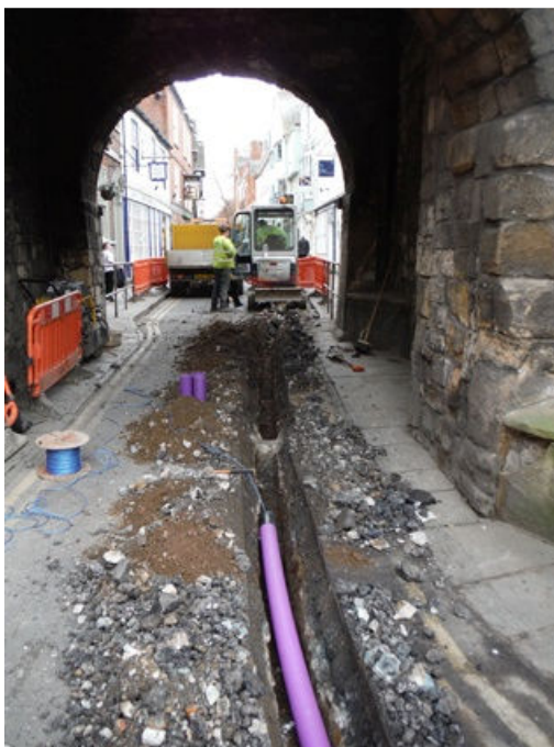
Plate 1: View of works looking SE beneath Bootham Bar