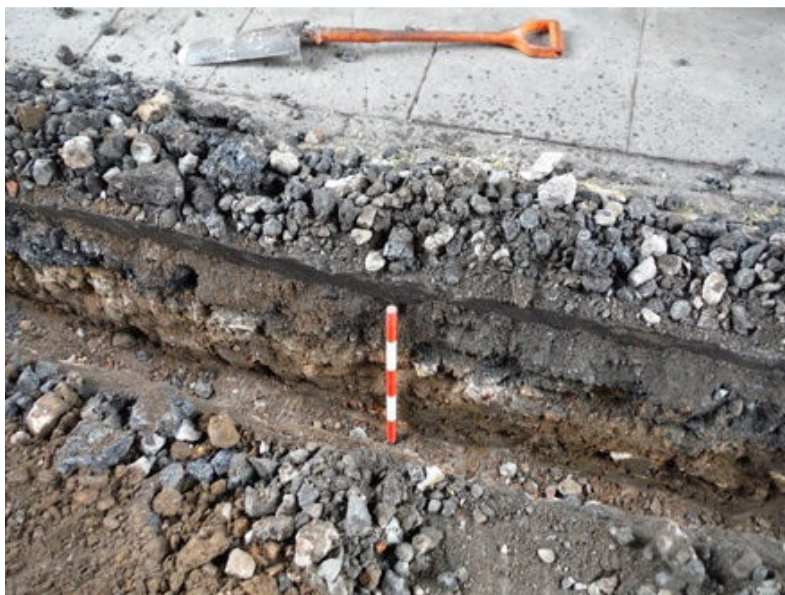
Plate 3: Section of trench beneath Bootham Bar, looking SW

This Report has been prepared solely for the person/party which commissioned it and for the specifically titled project or named part thereof referred to in the Report. The Report should not be relied upon or used for any other project by the commissioning person/party without first obtaining independent verification as to its suitability for such other project, and obtaining the prior written approval of York Archaeological Trust for Excavation & Research Limited ("YAT"). YAT accepts no responsibility or liability for the consequences of this Report being relied upon or used for any purpose other than the purpose for which it was specifically commissioned. Nobody is entitled to rely upon this Report other than the person/party which commissioned it. YAT accepts no responsibility or liability for any use of or reliance upon this Report by anybody other than the commissioning person/party.