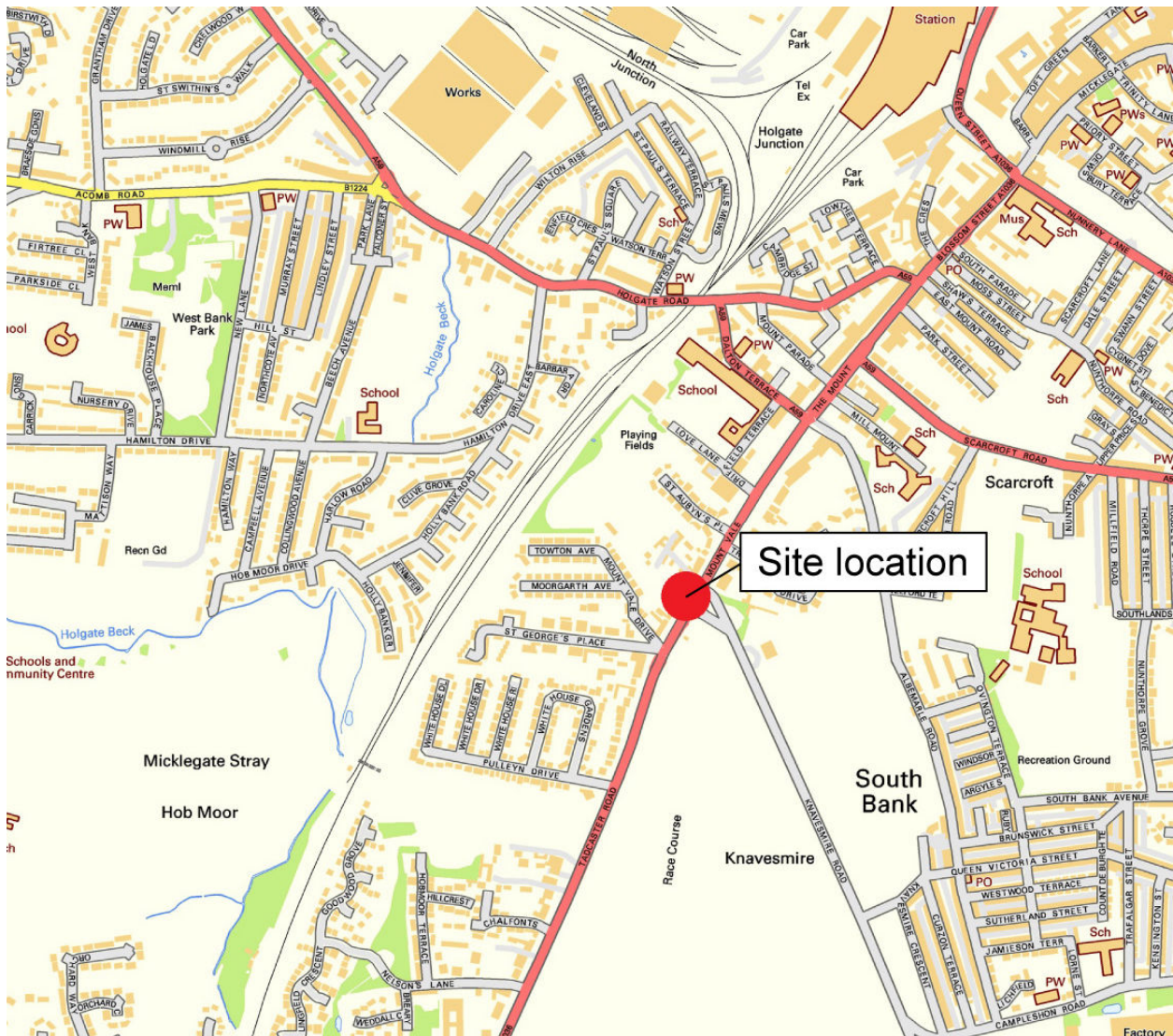
Figure 1 Site location plan

Between 30 th March and 4 th April 2016 a watching brief on drainage channels and footings for a single storey rear extension to 204 Mount Vale, York YO24 1DL was undertaken by York Archaeological Trust (Figure 1). The objective of the watching brief was to record any archaeological deposits, features or buried structures exposed by the groundworks. The site lies within York's designated Area of Archaeological Importance.