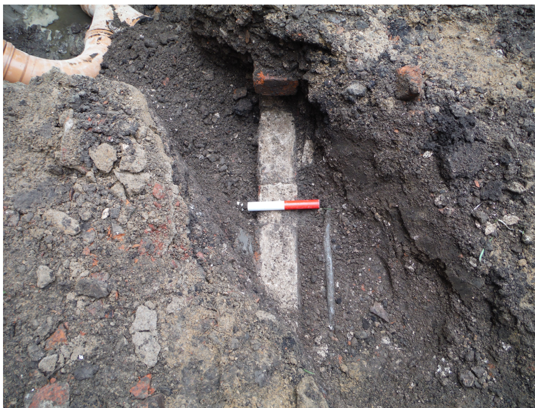
Plate 1 NE – SW aligned brick wall, facing SW, 0.1m scale units

The trenches at the SW end of the site, including the drainage channel and the wall foundation trench running up against the NE side of the garden wall, exposed disturbed ground. This disturbance derived from both active and redundant drains as well as a brick wall (Plate 1). The wall was aligned NE – SW, consisted of mortar bonded bricks a single course wide, four courses in height and extended from 0.1m Below Ground Level (BGL) to the base of the drainage channel cut at 0.45m BGL.