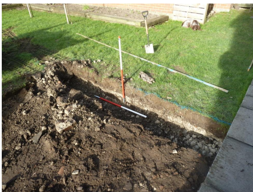
Plate 2. Sondage for Building Inspection looking NW. Scale Bars 1m in 0.5m divisions