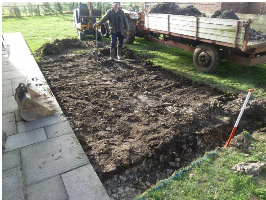
Plate 1: Excavated trench looking SW.