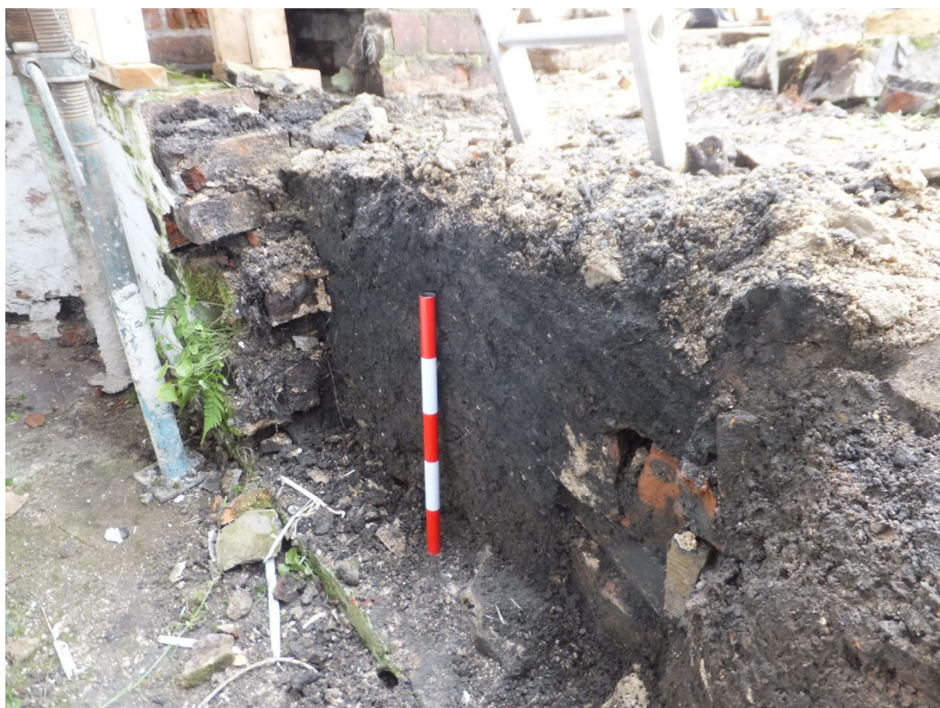
Plate 2 Shot of section looking north east 0.50 scale