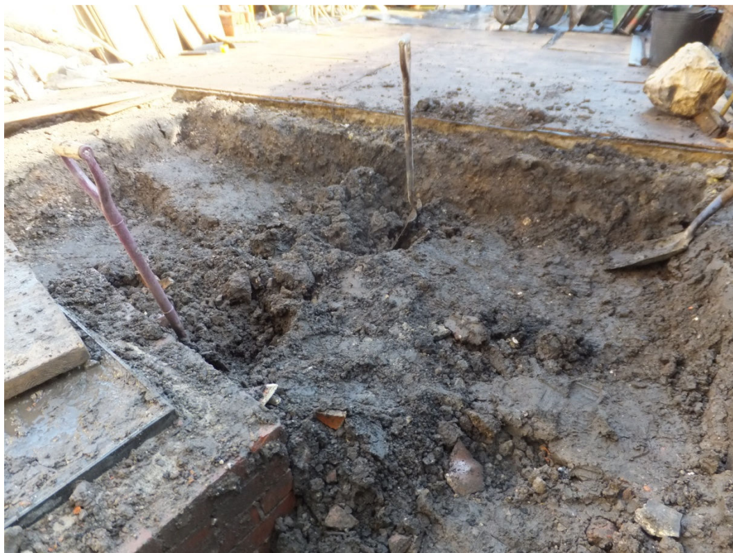
Plate 3 Works area during excavation looking north east