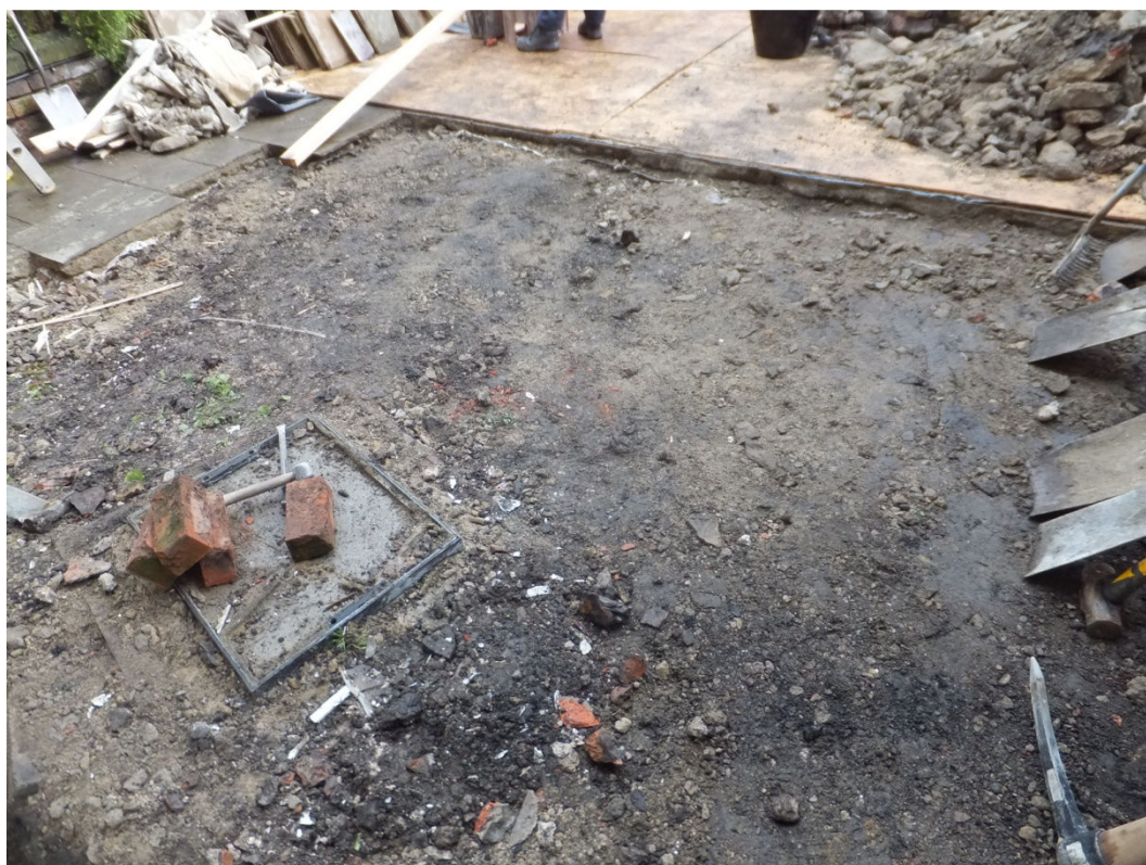
Plate 1 Excavated area with paving stones removed looking north east