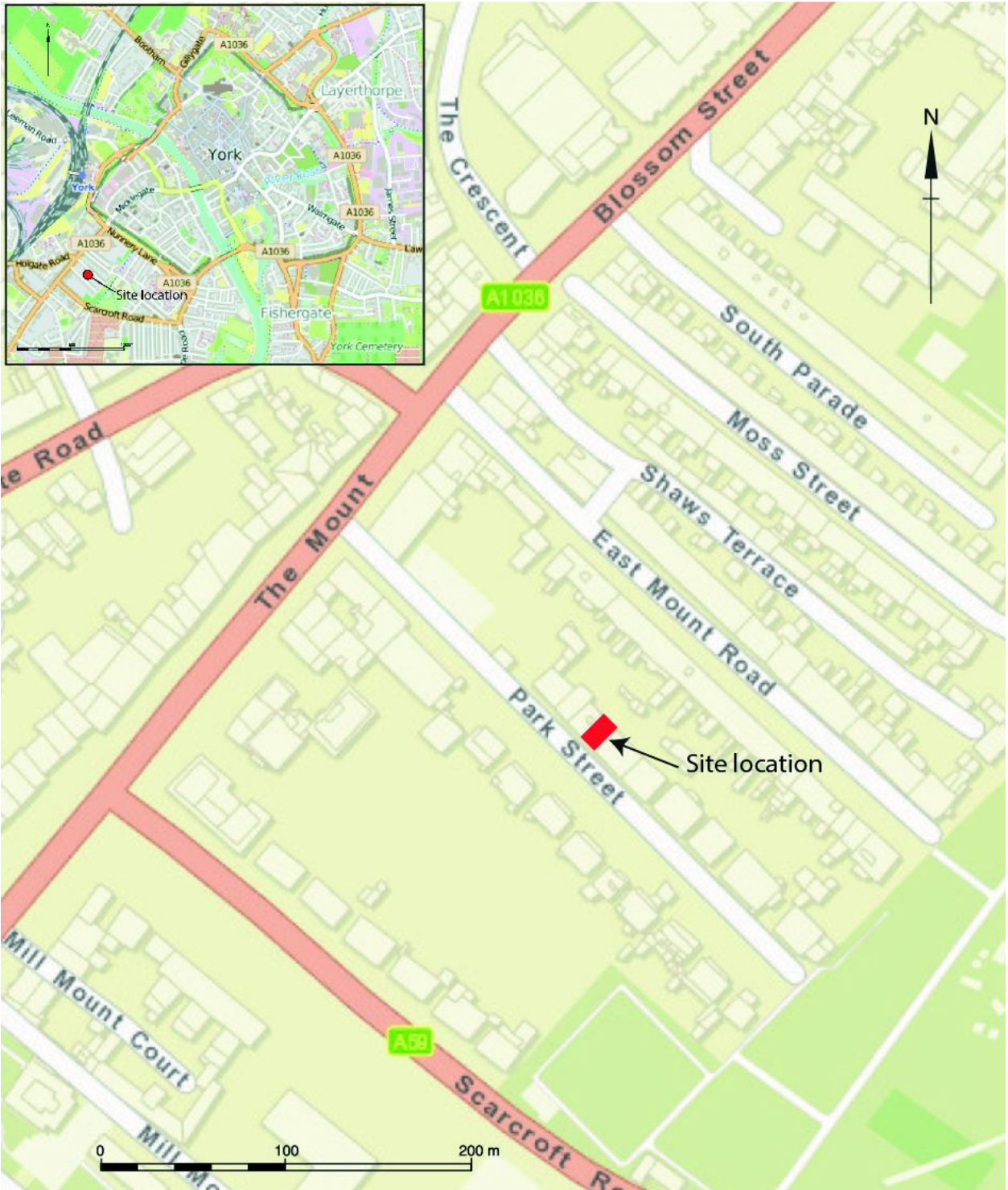
Figure 2 Location of site