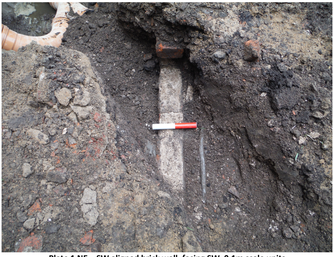
Plate 1 NE – SW aligned brick wall, facing SW, 0.1m scale units

The trenches at the SW end of the site, including the drainage channel and the wall foundation trench running up against the NE side of the garden wall, exposed disturbed ground. This disturbance derived from both active and redundant drains as well as a brick wall (Plate 1). The wall was aligned NE – SW, consisted of mortar bonded bricks a single course wide, four courses in height and extended from 0.1m Below Ground Level (BGL) to the base of the drainage channel cut at 0.45m BGL.