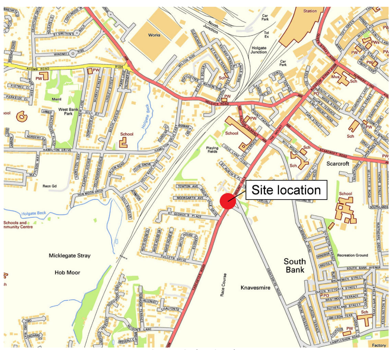
Figure 1 Site location plan

Between 30<sup>th</sup> March and 4<sup>th</sup> April 2016 a watching brief on drainage channels and footings for a single storey rear extension to 204 Mount Vale, York YO24 1DL was undertaken by York Archaeological Trust (Figure 1). The objective of the watching brief was to record any archaeological deposits, features or buried structures exposed by the groundworks. The site lies within York's designated Area of Archaeological Importance.