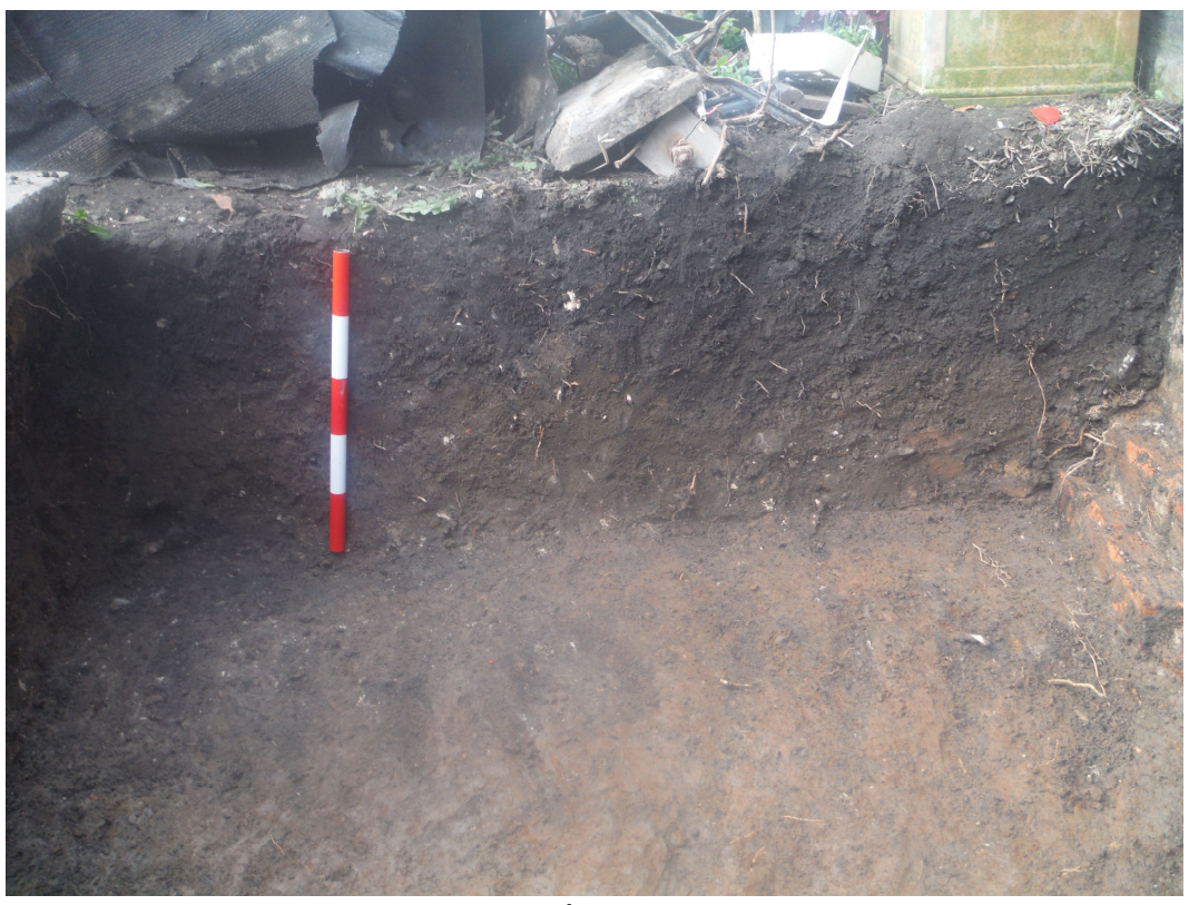
Plate 3 Section 2 showing garden soil overlying plough soil, facing NW, 0.1m scale units

No archaeological features, buried structures or underlying natural geological deposits were encountered during the course of the works.