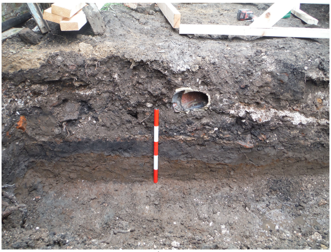
Plate 2 Section 4 showing plough soil underlying post medieval build-up and disturbance, facing SE, 0.1m scale units

The disturbed area extended to the NW as far as the first NE –SW aligned section of foundation trench. Beyond that point, extending from approximately 5.2m from the back of the house, the sequence of deposits typically followed that shown in the section below (Plate 2). The lowest deposit was of firm, mid brown, sandy clay with red brown streaks running throughout with inclusions consisting of charcoal flecks and small abraded Ceramic Building Material (CBM) fragments. This deposit extended from 0.6m BGL at its observed SE extent, rising to 0.3m BGL to the NW, its thickness ranging from 0.2m to 0.3m, again increasing to the NW. Two pottery sherds, including a fragment of 1<sup>st</sup> to 3<sup>rd</sup> century Samian pottery were recovered from this material but were not retained. Above this was a 0.1m thick deposit of firm, mid grey silty clay with occasional charcoal and CBM fleck. A single sherd of 19<sup>th</sup> century pottery was recovered from this deposit but was not retained. A layer, approximately 20mm thick, of compact mortar and occasional small CBM fragments separated the lower deposits from the continuation of the disturbed upper build-up. The disturbed material measured up to 0.5m thick.