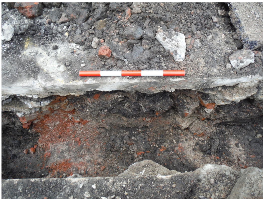
Plate 3 Shot of wall foundations at east end of Dixons Lane looking north. scale 0.50m.