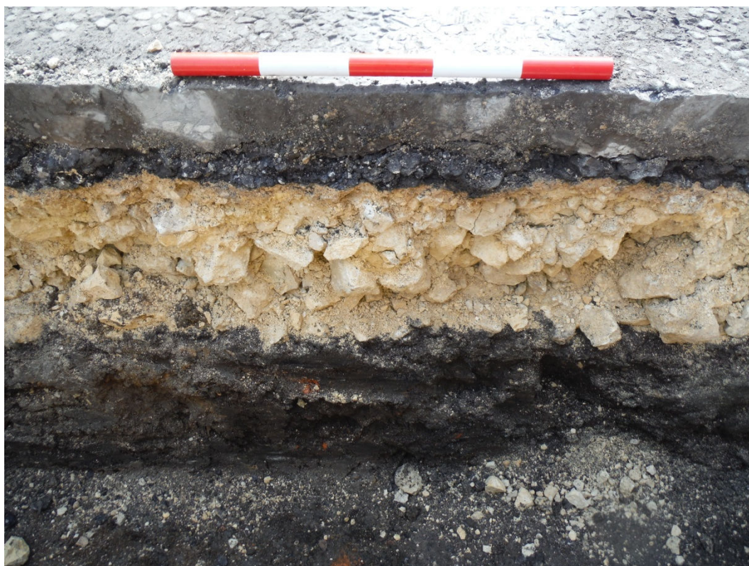
Plate 1 Piccadilly carriageway looking south-east 0.50m scale