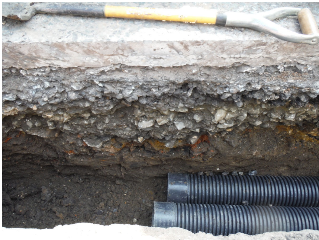
Plate 2 Piccadilly carriageway looking south east 0.50m scale