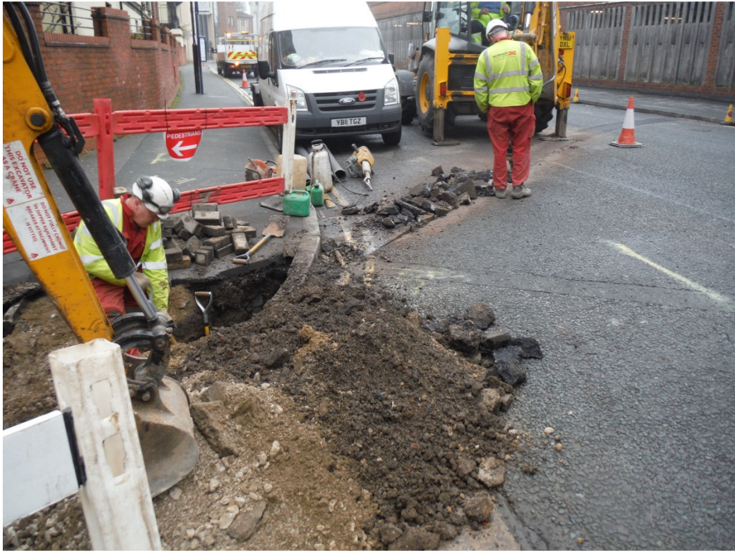
Plate 4 General shot facing south-west.