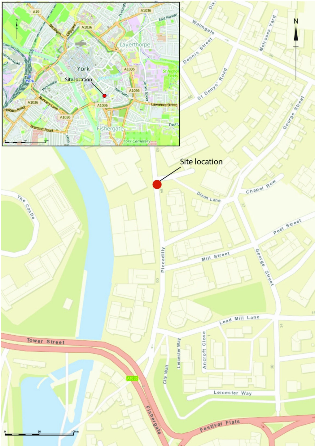
Figure 1 Location of site