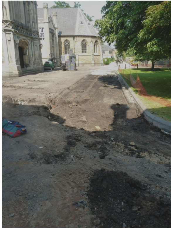
Plate 4: View after completion of machining, 20 th July 2016