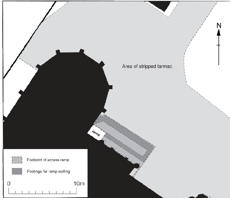
Figure 3: Footings for wheelchair access ramp.

Based on Ordnance Survey Digital Mapping with the permission of the Controller of Her Majesty's Stationery Office ©Crown Copyright. York Archaeological Trust 47 Aldwark, York YO1 7BX License AL100018343