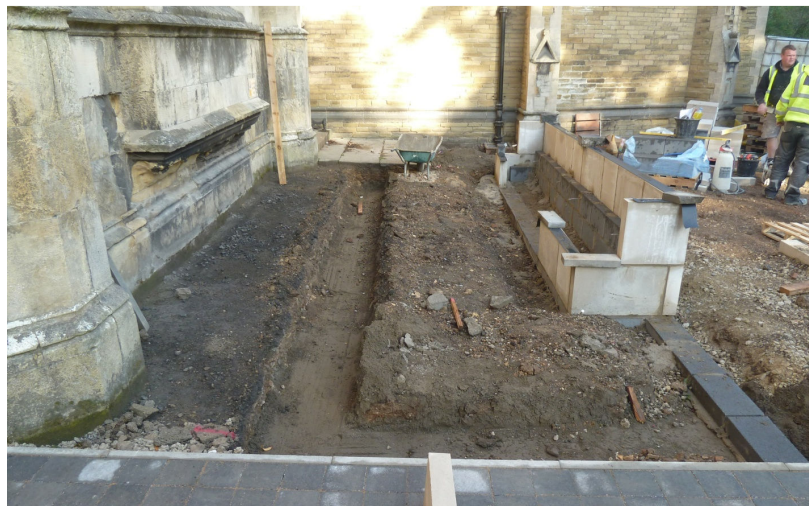
Plate 5: Access ramp footings and walling partially completed, 10 th August 2016