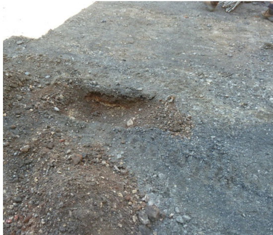
Plate 2: Small machine bucket test scrape in middle of roadway after tarmac stripping, 19 th July 2016