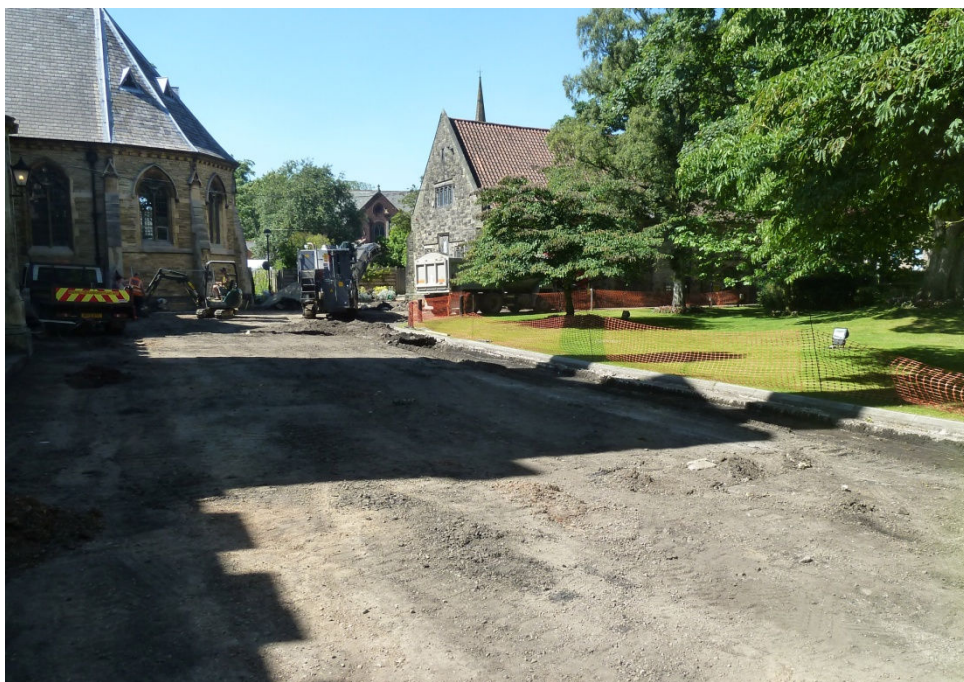
Plate 1: Roadway after tarmac stripping, 19 th July 2016

No walls, drains or other features were observed. The observed upcast contained no finds or artefactual material to indicate occupation in the area, other than that derived from the construction of the current school buildings and their ongoing use. Though it remains a possibility that archaeological deposits may be present at a greater depth, the current development does not affect their survival.