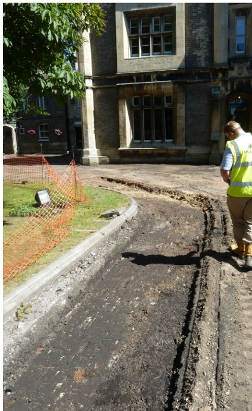
Plate 3: Test machine bucket scrape along margin between lawn and roadway before removal of kerbs, 19 th July 2016