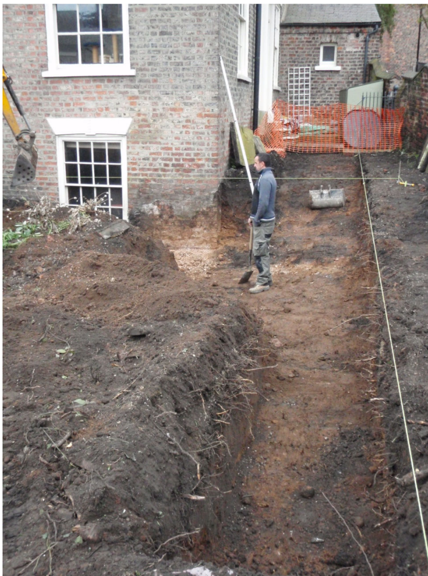
Plate 1. South facing view of excavation works.

Excavation was carried out by a one ton mechanical excavator equipped with a 0.60m wide toothless bucket. The excavated area measured approximately 10m x 5m and was reduced to a depth of approximately 800mm below ground level (BGL). The area between the door on the east face of the building and the front garden was excavated to slope gently into the main excavated area (Plate 1).