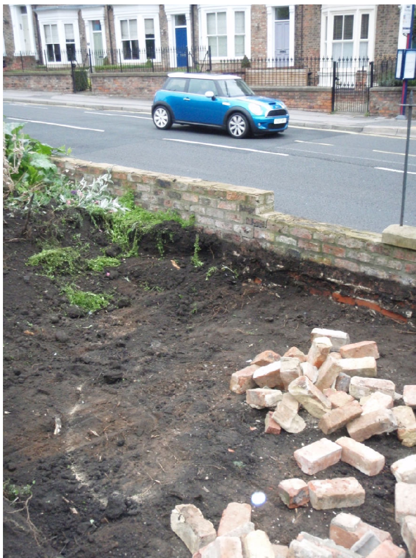
Plate 3. Cleaner deposits at maximum excavated depth.

This Report has been prepared solely for the person/party which commissioned it and for the specifically titled project or named part thereof referred to in the Report. The Report should not be relied upon or used for any other project by the commissioning person/party without first obtaining independent verification as to its suitability for such other project, and obtaining the prior written approval of York Archaeological Trust for Excavation & Research Limited ("YAT"). YAT accepts no responsibility or liability for the consequences of this Report being relied upon or used for any purpose other than the purpose for which it was specifically commissioned. Nobody is entitled to rely upon this Report other than the person/party which commissioned it. YAT accepts no responsibility or liability for any use of or reliance upon this Report by anybody other than the commissioning person/party.