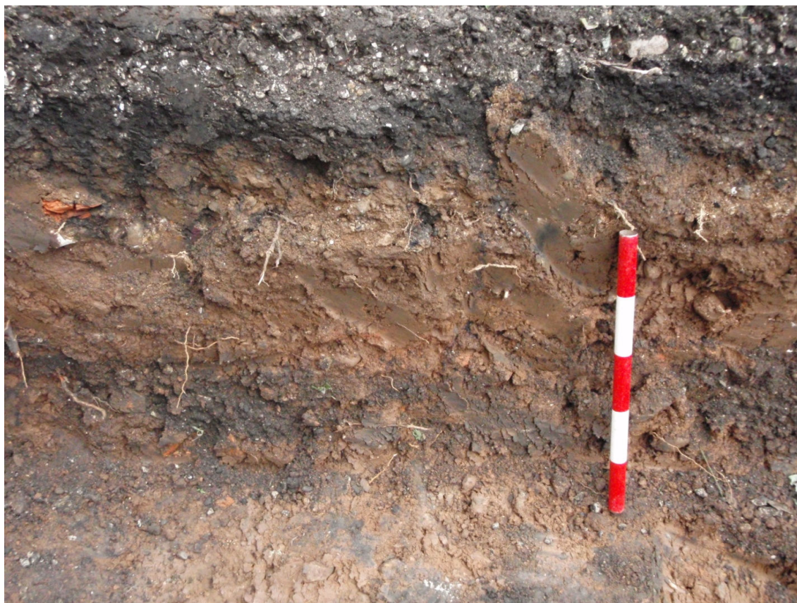
Plate 2. East facing representative section showing typical deposition (0.50m scale).

A uniform sequence of deposition was observed across the whole of the excavation area. The uppermost deposit was a layer of topsoil around 250mm in depth, overlaying a 350mm thick deposit of friable mid-orange brown sandy clay silt. Below this, a 200mm thick layer of loose dark-grey black sandy silt with frequent 19 th century CBM rubble was observed (Plate 2, Figure 2).