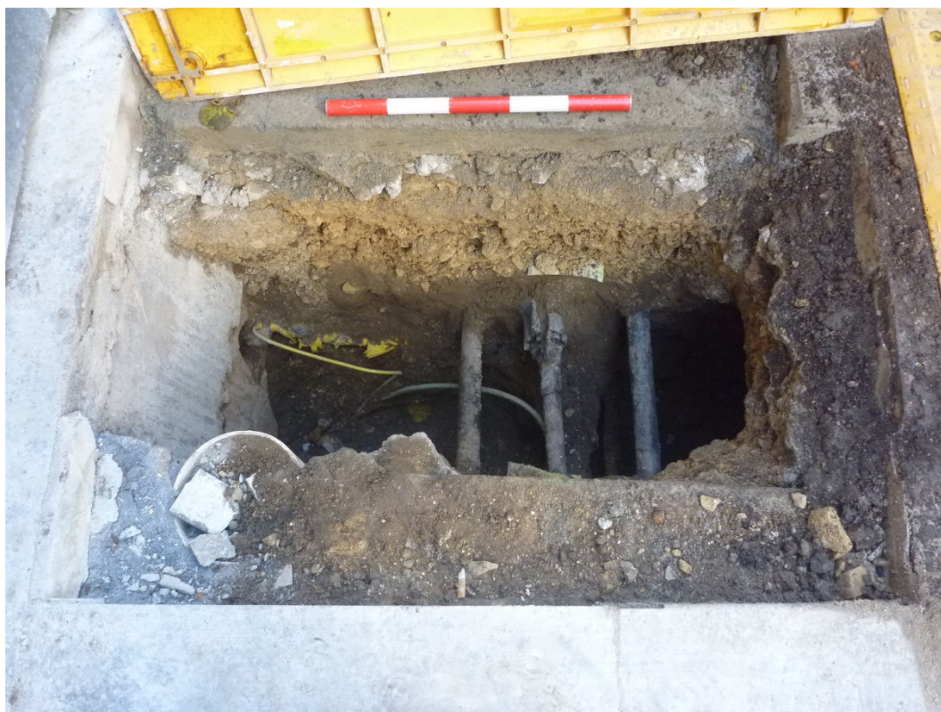
Plate 2 Trench 2, facing north, 0.1m scale units

c.1.0m wide and 0.9m deep. A small area of made ground between the two parts of the trench was tunnelled through, enabling a new section of pipe to be fed through and connected to the ceramic pipe. Several recently installed power and other utility cables were exposed. No archaeological deposits, structures or features were encountered (Plate 2).