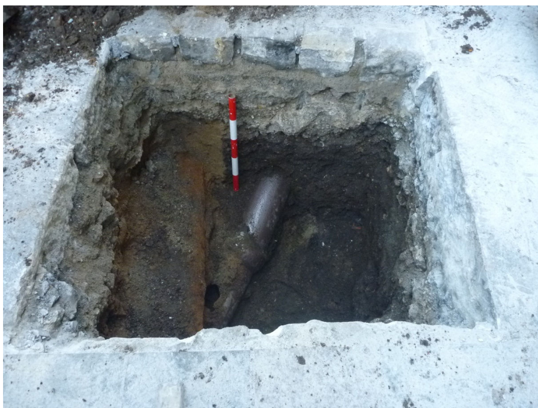
Plate 1 Trench 1 showing ceramic pipe to be connected in to, facing south, 0.1m scale units

In Trench 1 the existing surface consisted of cobble sets, c.0.13m thick, resting on a bed of concrete, c.0.3m thick. Two service pipes running approximately north-south were exposed in the base of the trench. A cast iron pipe measuring c.100mm in diameter running along the eastern side of the trench was encountered at a depth of 0.56m below ground level. At a point approximately 2.5m east of the alley doorway the ceramic pipe, which was to be connected into, was exposed at 0.68m below ground level. The backfill of that pipe trench consisted of firm dark grey coarse, gritty sand with inclusions of gravel, brick fragments, sand and animal bone. That material extended across the entire western part of the trench and was clearly cut to the east by the trench containing the cast iron pipe (Plate 1). No archaeological deposits, structures or features were encountered within this part of the excavation.