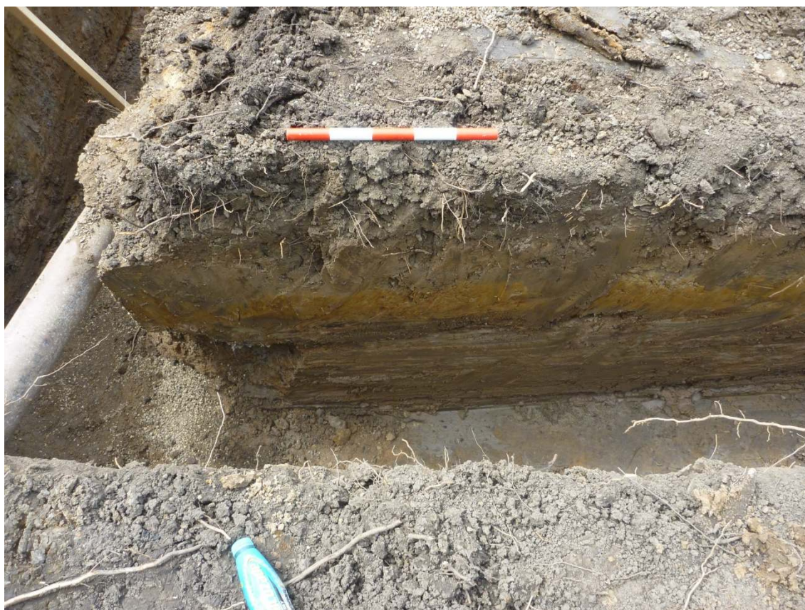
Plate 1: Example section, viewed from the east, of the deposit sequence (modern sewer pipe visible to the left)

No significant archaeological deposits were encountered during these works. The destroyed remnants of 20 th century structures which may belong to either a septic tank, filter beds or associated works were encountered in one part of the strip foundation. No residual material was observed in the topsoil across the development area that predated the 19 th century (the only 19 th century material being fragments of field drains).