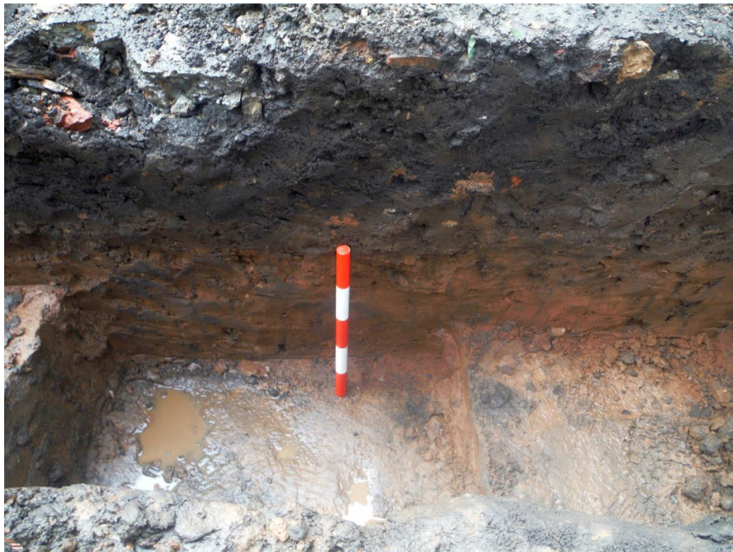
Plate 2 representative section.

This Report has been prepared solely for the person/party which commissioned it and for the specifically titled project or named part thereof referred to in the Report. The Report should not be relied upon or used for any other project by the commissioning person/party without first obtaining independent verification as to its suitability for such other project, and obtaining the prior written approval of York Archaeological Trust for Excavation & Research Limited ("YAT"). YAT accepts no responsibility or liability for the consequences of this Report being relied upon or used for any purpose other than the purpose for which it was specifically commissioned. Nobody is entitled to rely upon this Report other than the person/party which commissioned it. YAT accepts no responsibility or liability for any use of or reliance upon this Report by anybody other than the commissioning person/party.