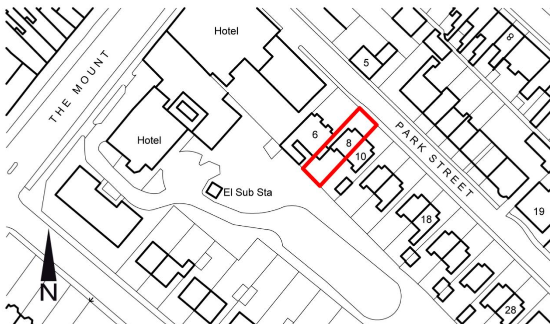
Figure 1 site location (after 16/02744/FUL WG451 – 01)

On 24 th – 28 th July 2017 a watching brief on a single storey pitched roof 'wrap-around' side and rear extension at 8 Park Street was undertaken by York Archaeological Trust (Figure 1 Site location). The objective of the watching brief was to record any archaeological deposits, features or buried structures exposed by the ground works. The site lies within York's designated Area of Archaeological Importance.