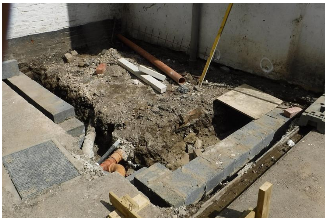
Plate 1 Foundations, facing north