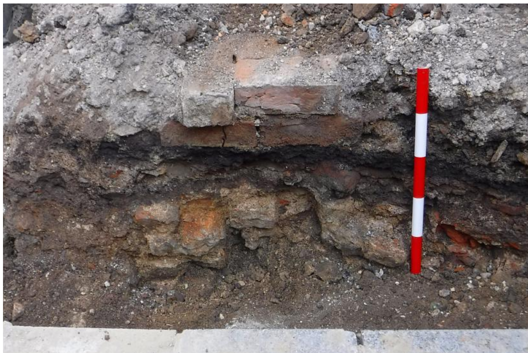
Plate 3 South-east side of foundation trench, facing northwest, scale unit 100mm

At potentially the same time this was deposited, or at least very soon afterwards, a wall footing was built. This is visible in Plate 3 and appeared to run to the north-west, on the same alignment as the current buildings. To the north-east of this footing was rubble infilling, which may have acted as the makeup for flooring within any structure. The first edition Ordnance Survey mapping of 1852 indicates outhouses or similar in this location, which would correlate with the size of bricks used in this structure.