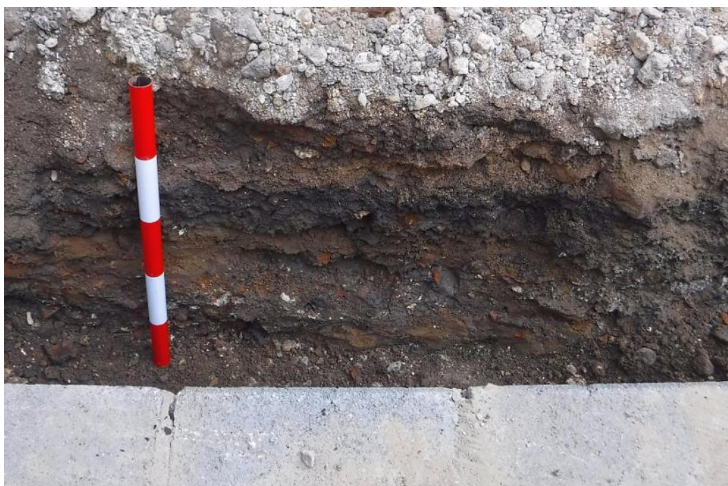
Plate 2 South-west side of foundation trench, facing northeast, scale unit 100mm