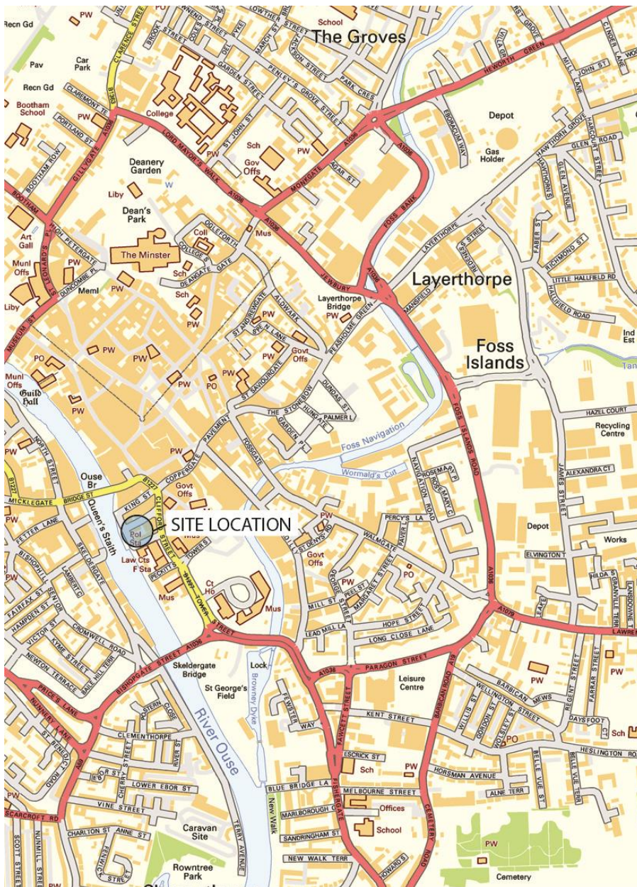
Figure 1 Site Location Contains Ordnance Survey data © Crown copyright and database right 2010

Between the 16 th and 19 th June 2017 a watching brief took place to record deposits revealed during the excavation of a foundation trench at 7 Cumberland Street, York (Figure 1). The foundations were for a single storey rear extension to the rear of the building, within the area formerly used as a yard.