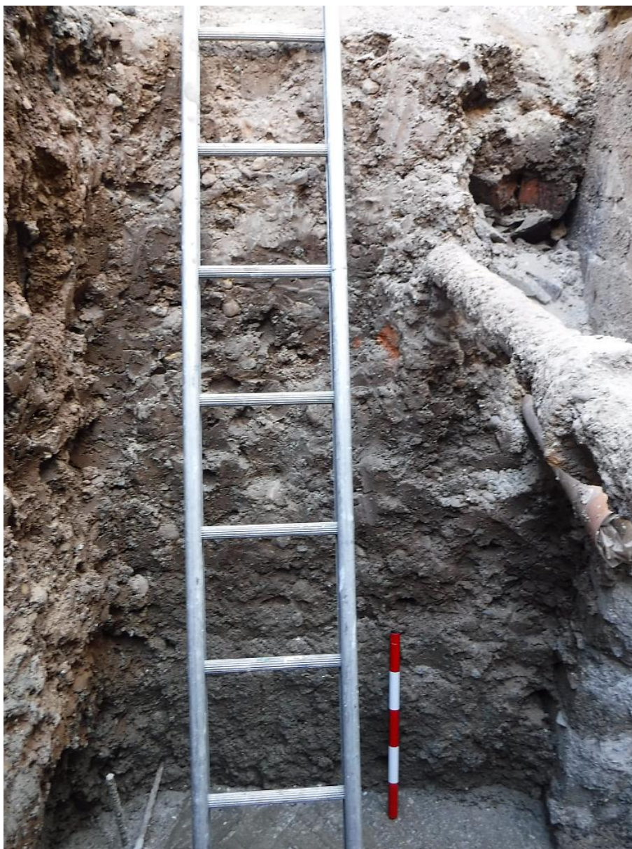
Plate 2 Section of stairway excavation facing northwest (scale unit 100mm)

Stair excavation – This work removed material up to c.2.25m BGL which was primarily undisturbed natural. The previous basement excavations, referenced above, had also observed these excavations with minimal archaeology being encountered (see Plate 2).