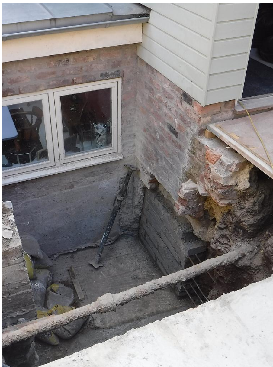
Plate 1 Underpinning facing east Concrete base also acting as base for new stairway

Underpinning – The depth of the underpinning trench (c.2.25m BGL) meant that only natural deposits were observed during this excavation process (see Plate 1 below).