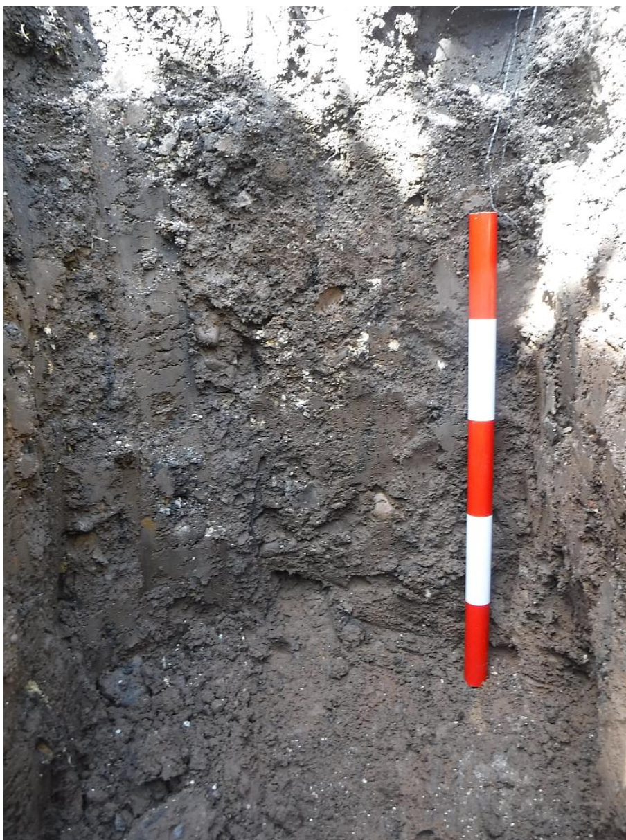
Plate 3 Section into undisturbed soils facing north-west (scale unit 100mm)

The sequence visible in section indicated c.200mm of disturbance at the top with c.500mm of disturbed post-medieval 'garden' soils grading through to ploughsoil below (Plate 3). The earliest finds were a few fragments of medieval tile and a single sherd of medieval pottery, the bulk of material being post-medieval brick and flowerpot fragments. No finds were retained.