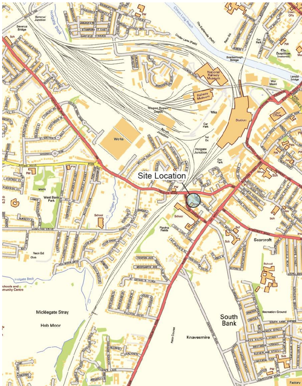
Figure 1 Site Location Contains Ordnance Survey data © Crown copyright and database right 2010

Between the 27 th March and the 4 th May 2017 a watching brief took place during the excavation of a trench for new steps, underpinning, and the diversion of water mains in the rear yard of 4 Mount Terrace, York. (Figure 1).