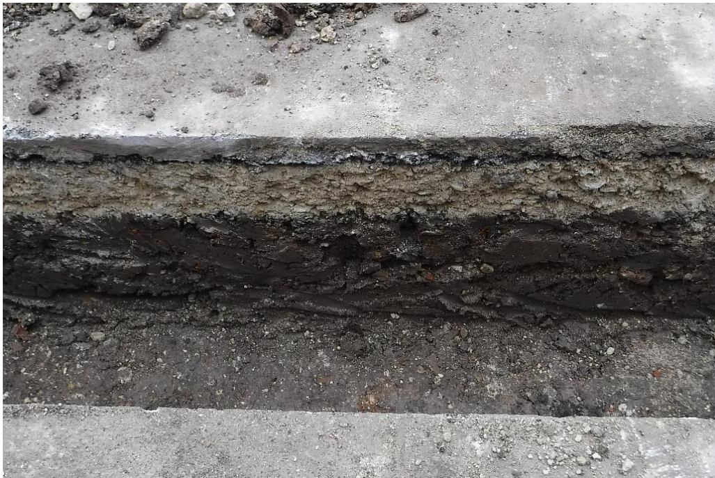
Plate 1 Trench Section.