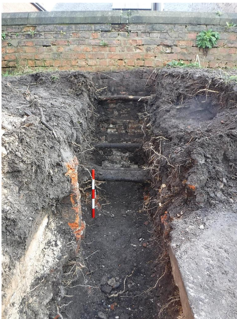
Plate 3 C19th foundation remnants