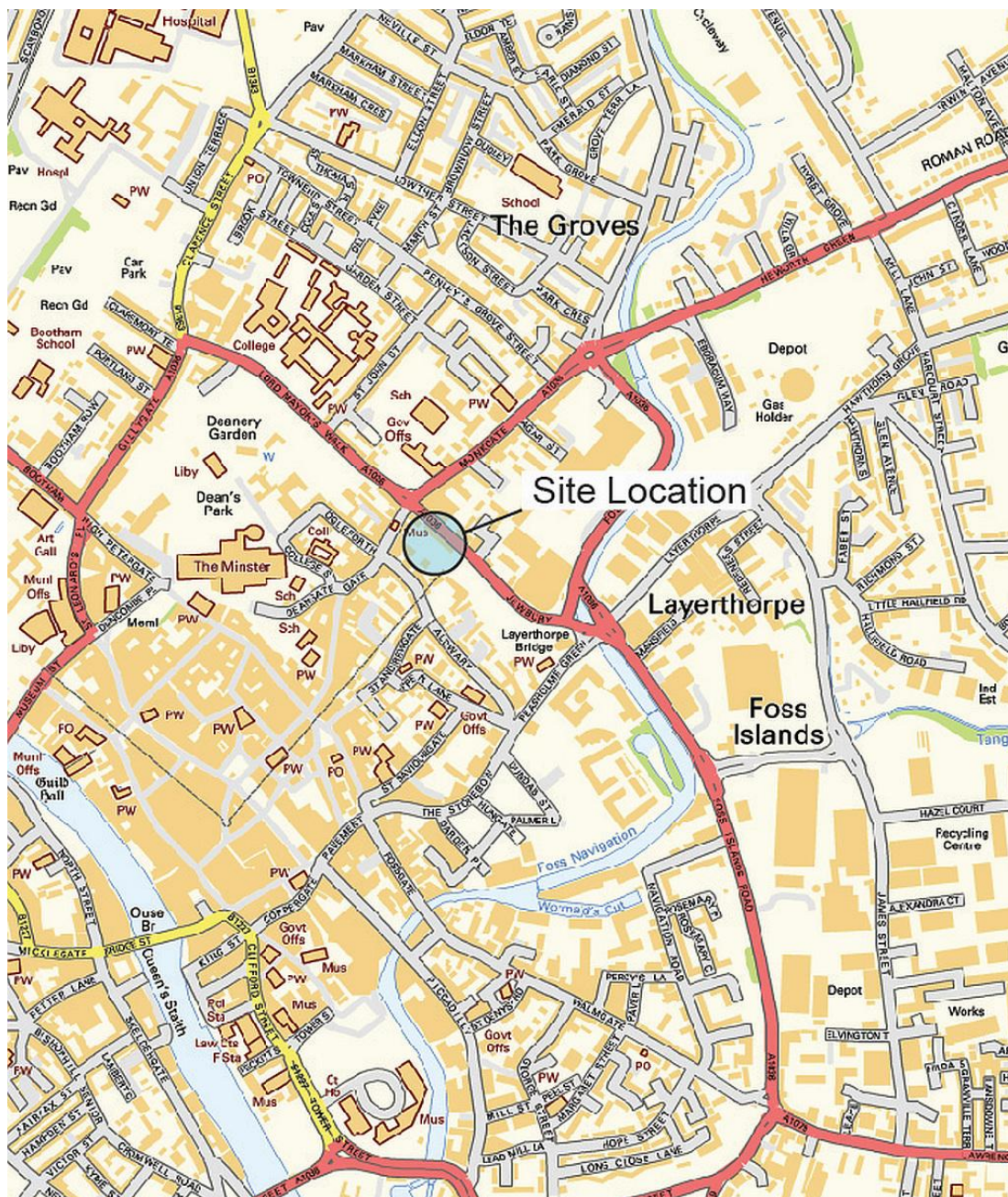
Figure 1 Site Location Contains Ordnance Survey data © Crown copyright and database right 2010

Between the 1 st and 6 th March 2017 a watching brief took place during the excavation of a combined utility trench in the yard and car park of Unit 3 St Maurice's Road, York (Figure 1).