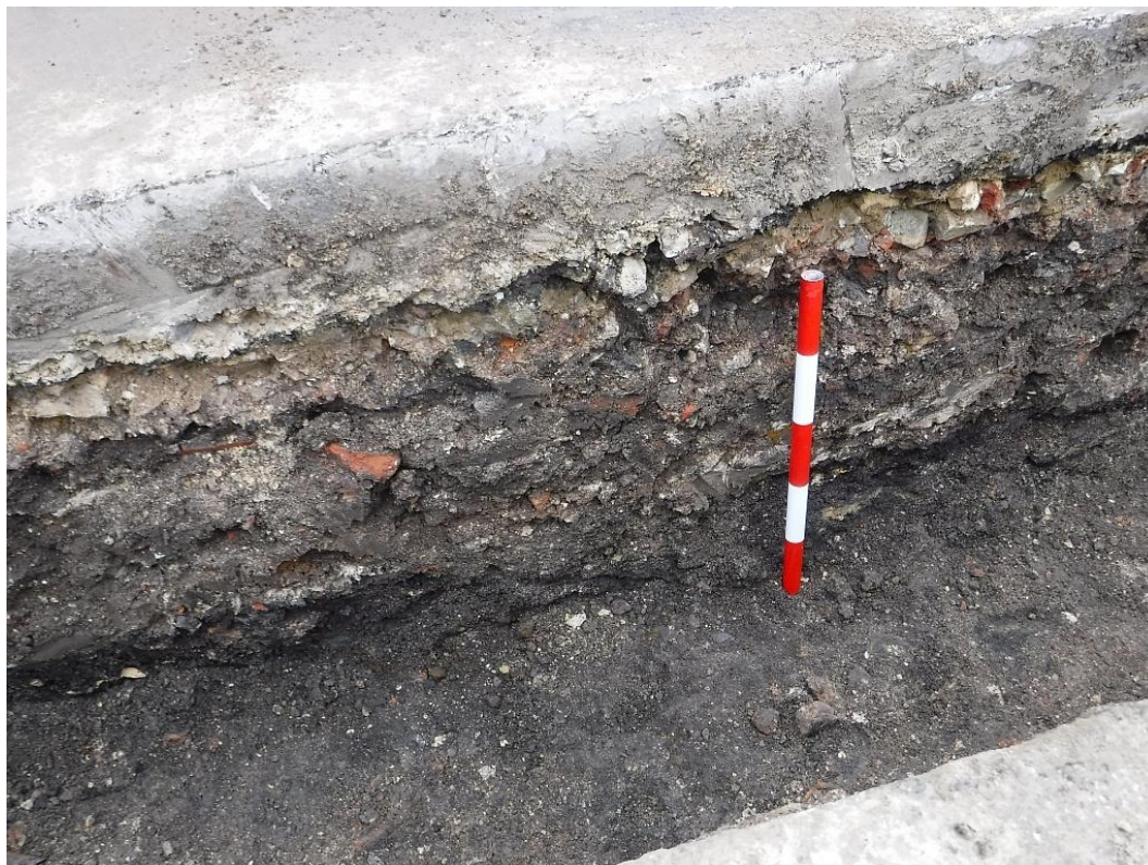
Plate 2 Possible cinder surface

In the few areas outside of previous significant disturbance there were traces of a possible cinder surface at c.700mm BGL and truncated wall stubs (Plates 2 and 3).