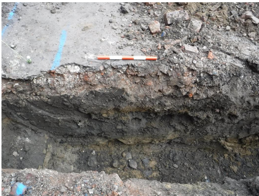
Plate 2 north end of foundation trench facing east. 0.50 scale