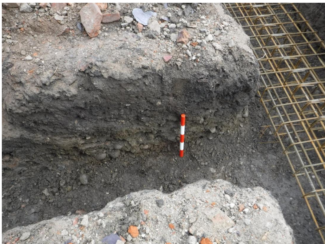
Plate 1 south end of foundation trench facing east. 0.50m scale