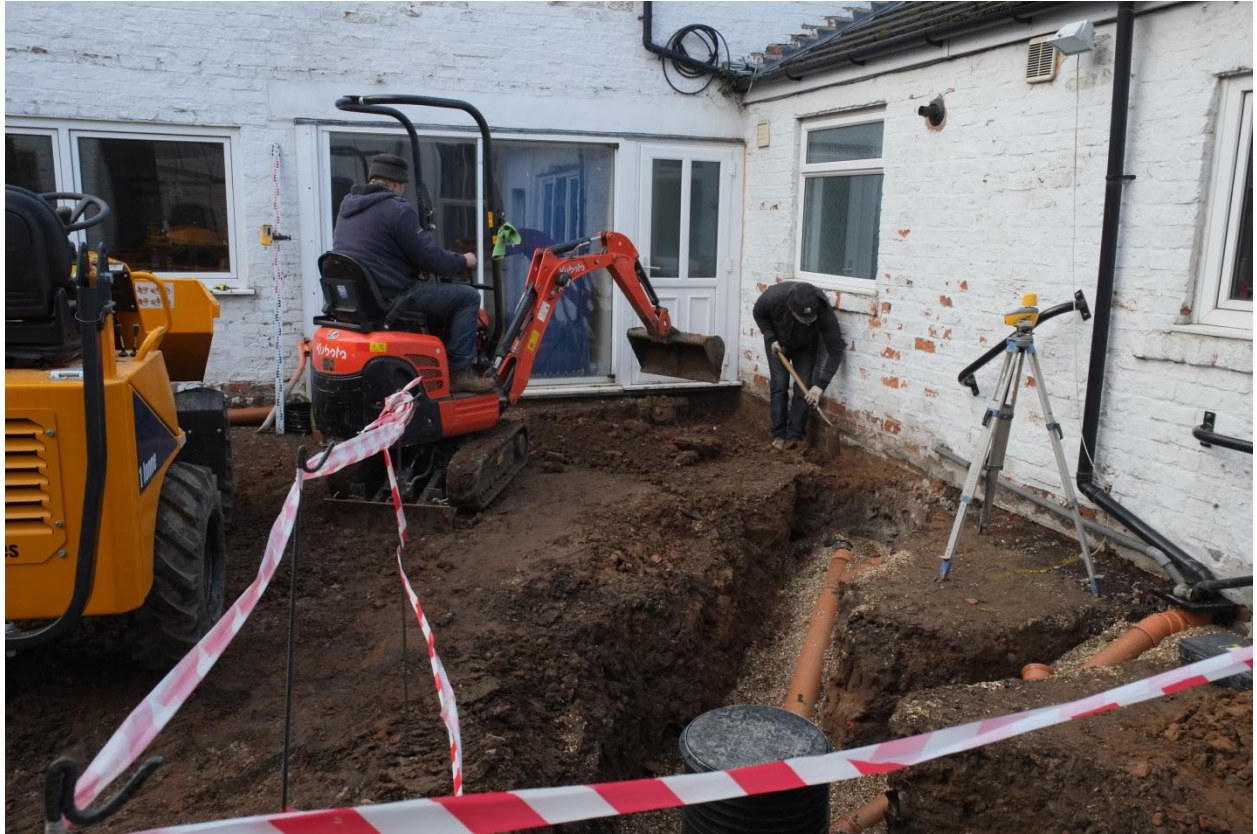
Plate 3 Stripping commences across the footprint of the new building

This Report has been prepared solely for the person/party which commissioned it and for the specifically titled project or named part thereof referred to in the Report. The Report should not be relied upon or used for any other project by the commissioning person/party without first obtaining independent verification as to its suitability for such other project, and obtaining the prior written approval of York Archaeological Trust for Excavation & Research Limited ("YAT"). YAT accepts no responsibility or liability for the consequences of this Report being relied upon or used for any purpose other than the purpose for which it was specifically commissioned. Nobody is entitled to rely upon this Report other than the person/party which commissioned it. YAT accepts no responsibility or liability for any use of or reliance upon this Report by anybody other than the commissioning person/party.