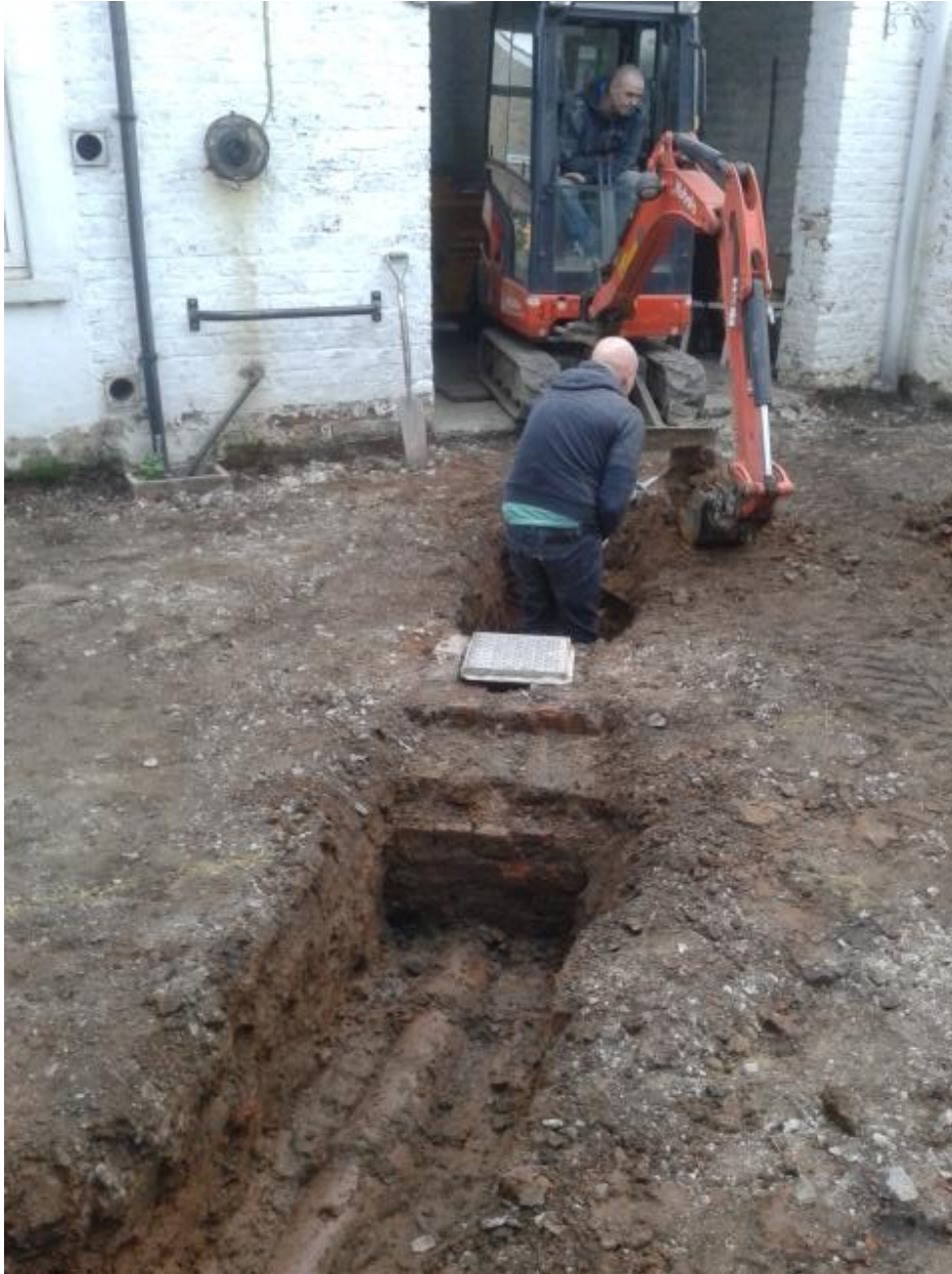
Plate 1 Exposing old drains prior to replacement