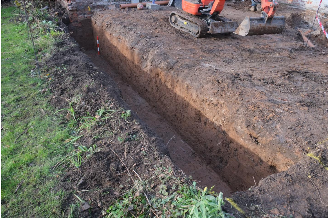
Plate 2 Wall footings excavated after the demolition of the old boundary wall