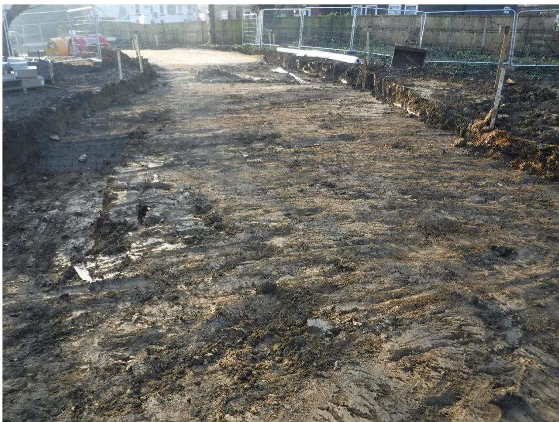
Plate 1 View of road strip facing south.