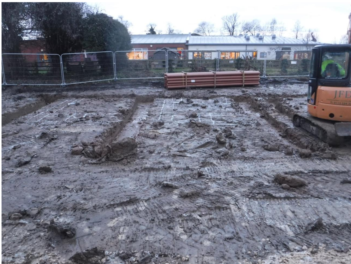
Plate 2 Excavation of foundations facing west.