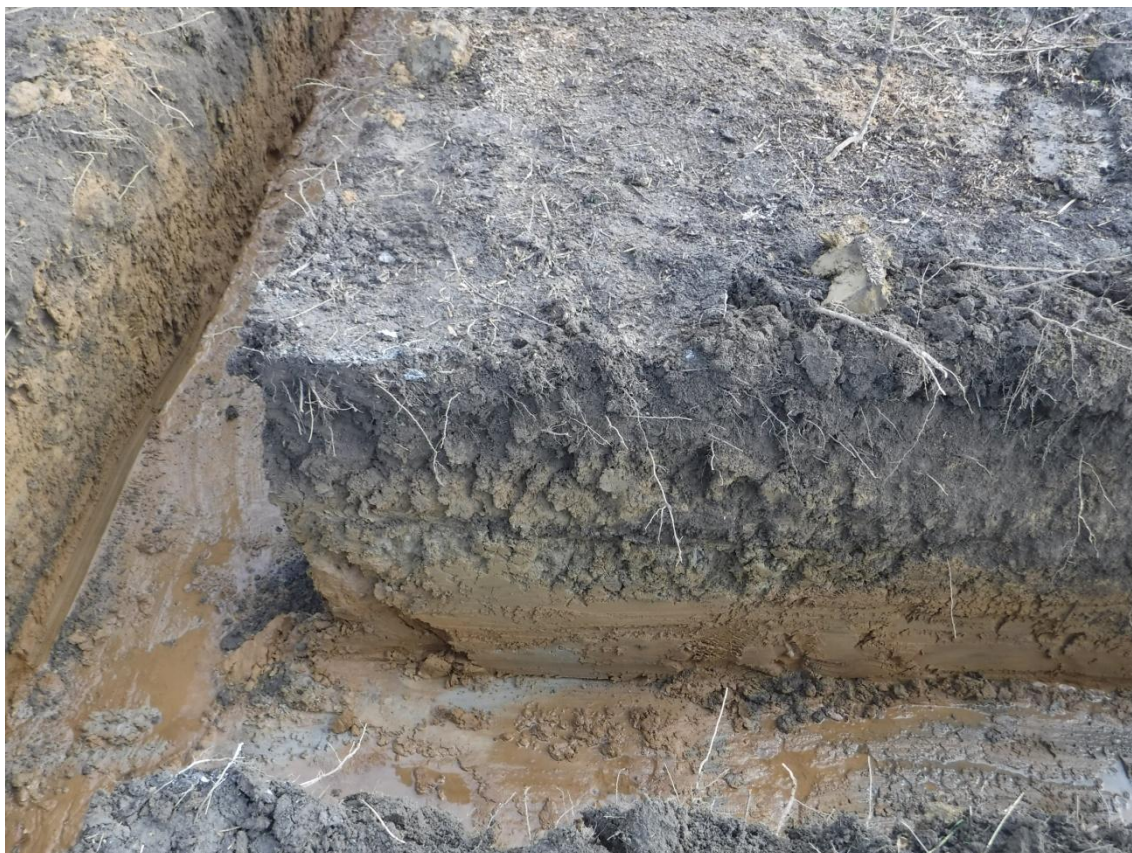
Plate 3 Deposit sequence within foundation.