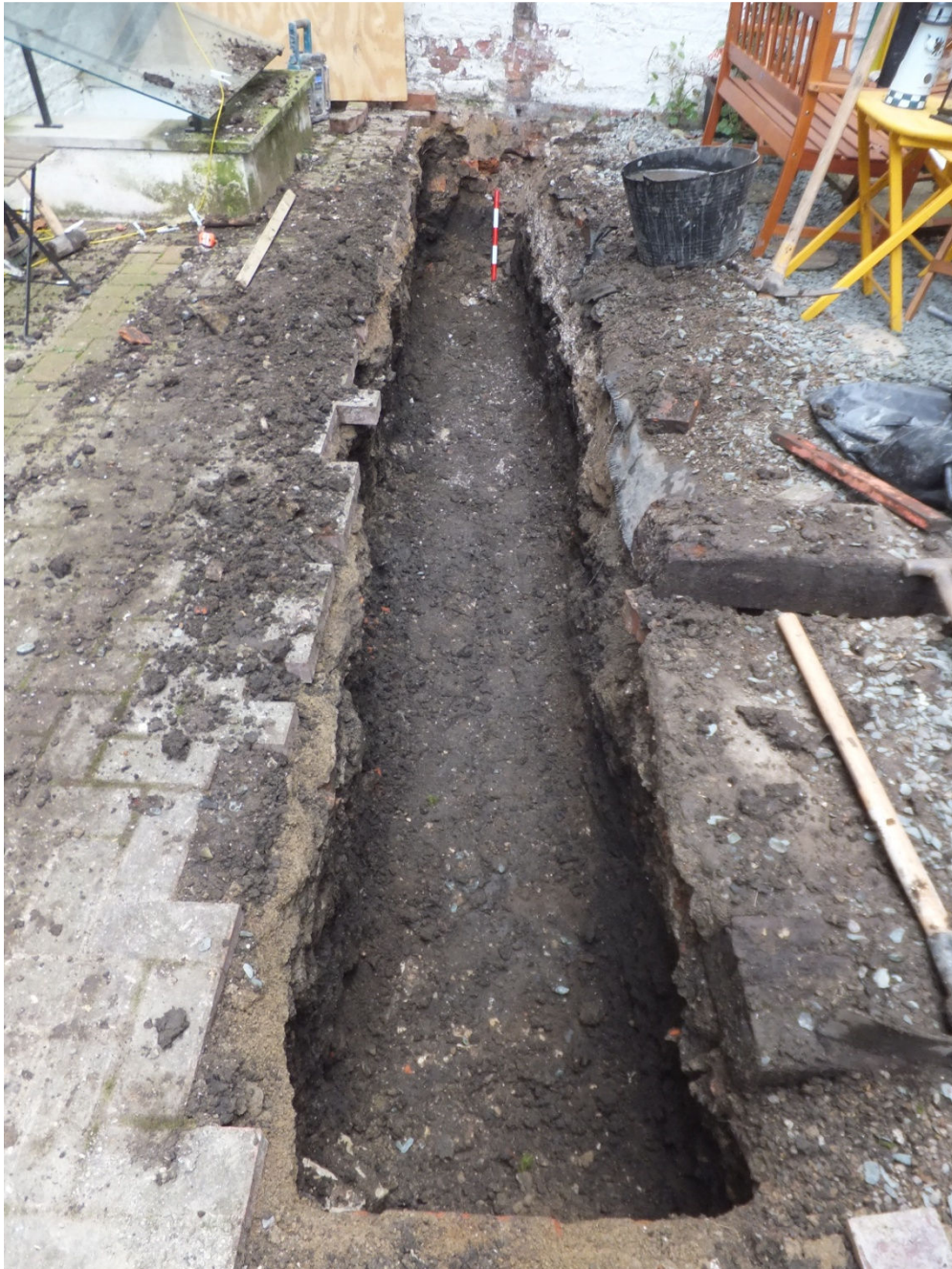
Plate 1 trench aligned north-west south-east.