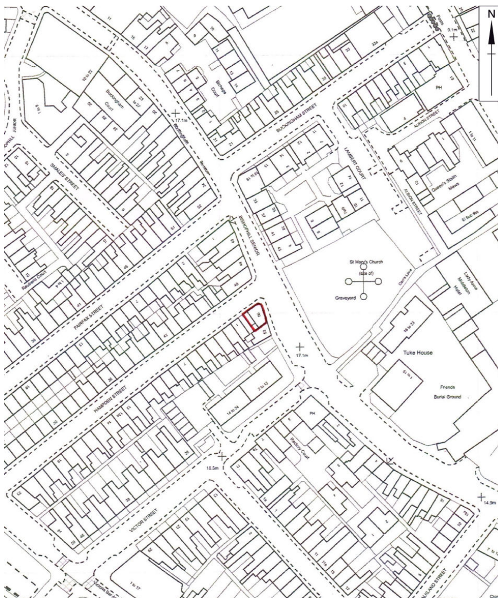
Figure 1 site location

On 16 th – 17 th November 2016 a watching brief on a single storey glass roofed lean-to rear extension at 50 Bishophill Senior was undertaken by York Archaeological Trust (Figure 1 & 2 Site location). The objective of the watching brief was to record any archaeological deposits, features or buried structures exposed by the ground works. The site lies within York's designated Area of Archaeological Importance.