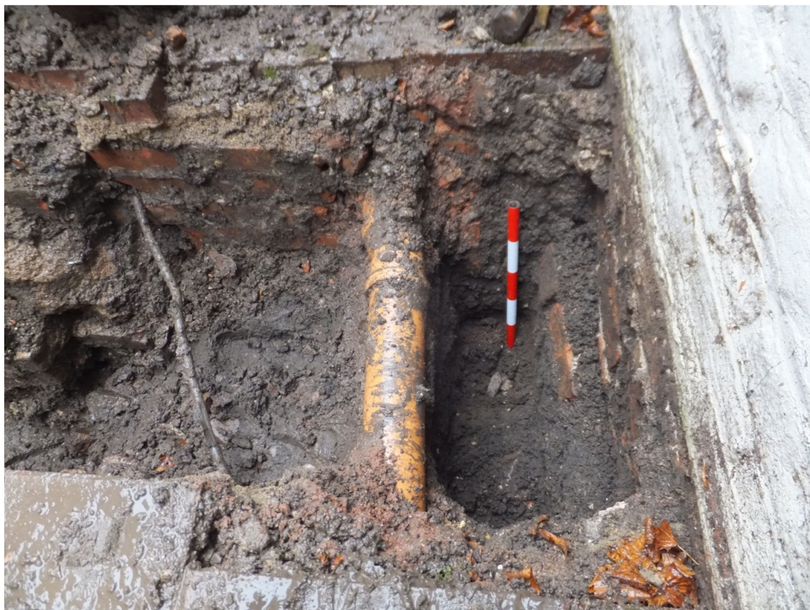
Plate 2 trench aligned north-east south-west with active drains.