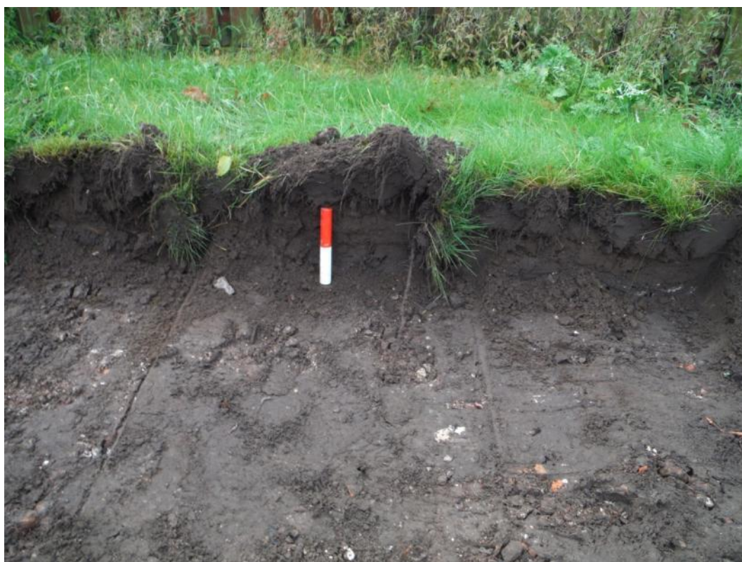
Plate 1: Depth of the topsoil in the front yard

A tracked excavator was first used to undertake the topsoil strip within the front garden. These works were being conducted in advance of laying new hard standing and surface material for the new solid yard surface. The excavations within the front yard did not exceed a maximum depth of 250mm ( Plate 1 ).