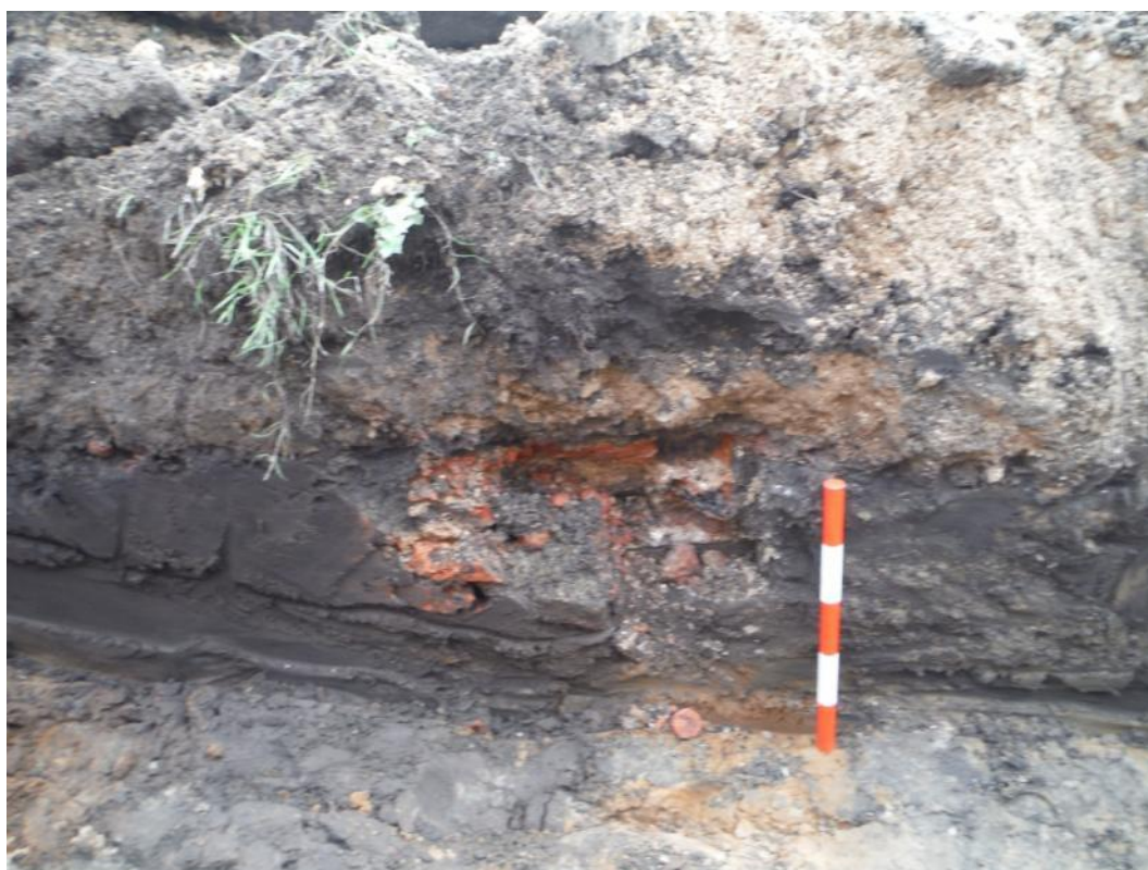
Plate 3: Remnant of modern barn wall which predates current house and garden

These modern deposits overlay a friable, mid brownish grey, subsoil which contained moderately frequent large brick fragments, concrete fragments, salt glazed pipe fragments and mortar fragments. This subsoil varied between 0.6m (beneath the former house extension foundations) and 0.8m thick. A 0.6m wide brick wall, aligned west to east, was encountered within the strip foundation. This wall seems likely to have formed the outer wall of a former barn ( Plates 3 and 4 ). The bricks used measured 230mm by 110mm by 70mm and appeared to be modern.