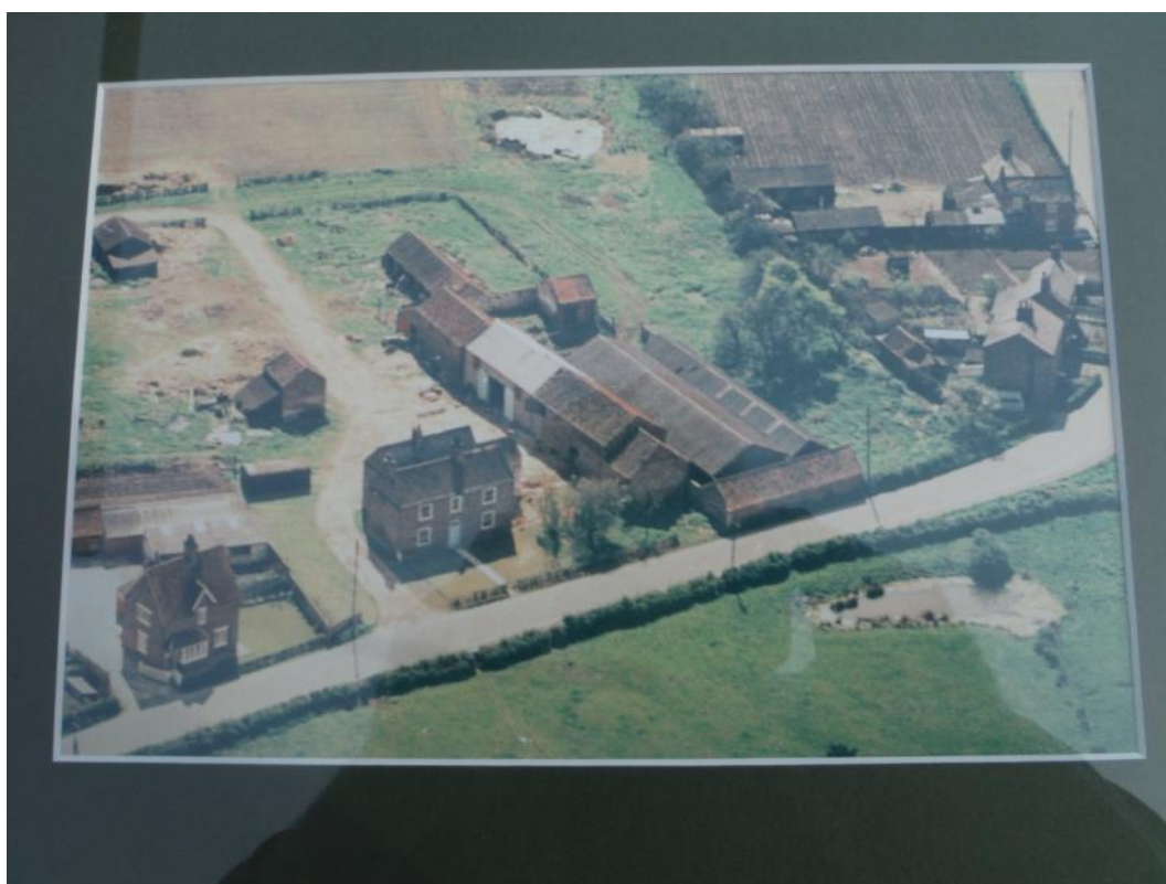
Plate 4: Framed picture showing complex of barns located immediately to the south (right) of the Grade II listed Mains Farm

The ground works at Chilton House, Seaton Ross have revealed that the naturally occurring deposits beneath this plot have been heavily disturbed by the construction and subsequent demolition of a complex of barns ( Plate 4 ). All that survives of these barns is one very truncated section of wall and a concrete pad (presumably for a wooden or steel upright).