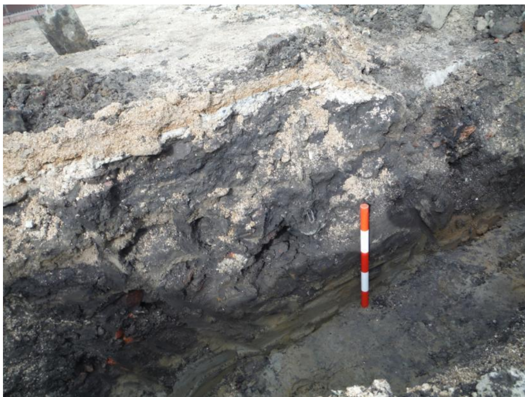
Plate 2: Oblique view of the strip foundation trench (Visible area drawn in representative section)

The deposits encountered were planned on a sheet of permatrace alongside a representative section drawing ( Figure 2, Plate 2 ). Digital photographs were taken at intervals during the watching brief.