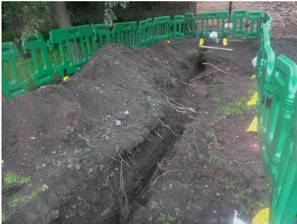
Plate 1: Cable trench

The cable trench was excavated with a small rubber-tracked 360 excavator. The trench was aligned east-west, running from the path of Foss Islands Road to the Red Tower, and was 15.0m long, 0.30m to 0.40m wide and 0.45m deep (plate 1).