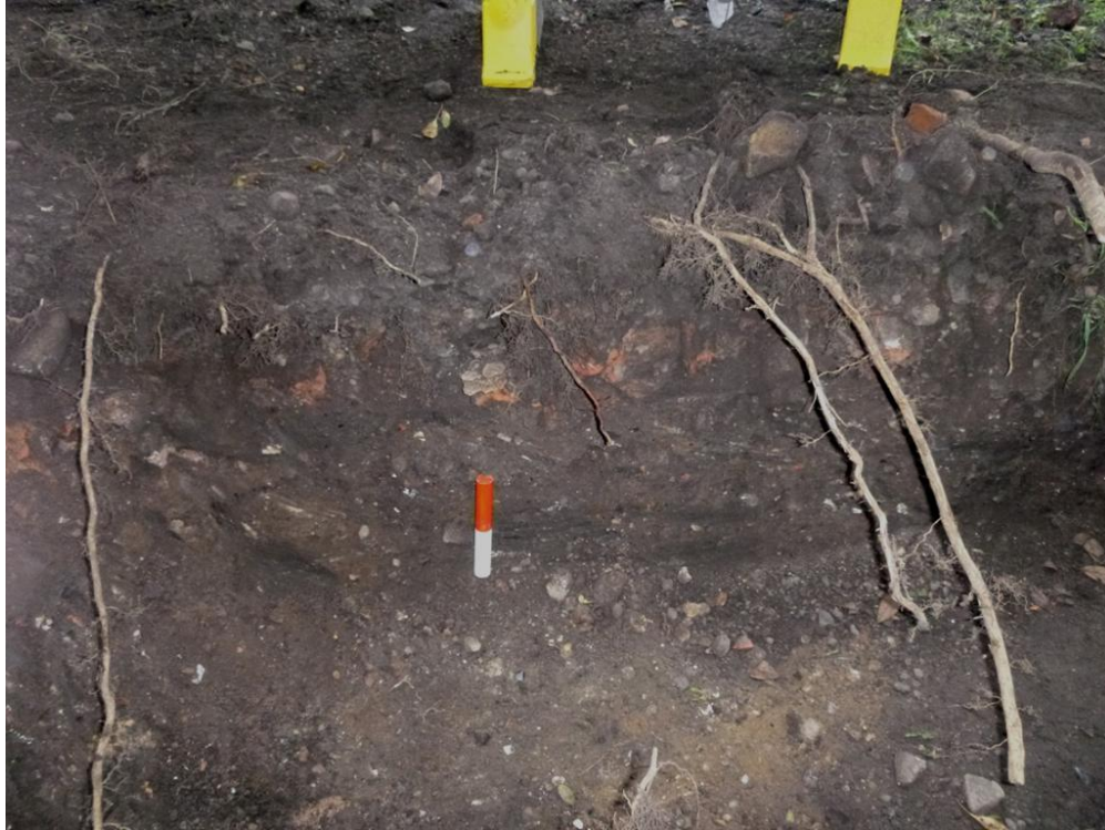
Plate 2 representative section.