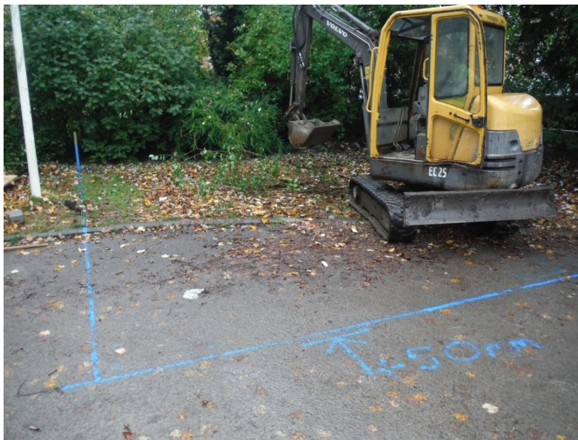
Plate 1 Area pre-excitation, view north-west