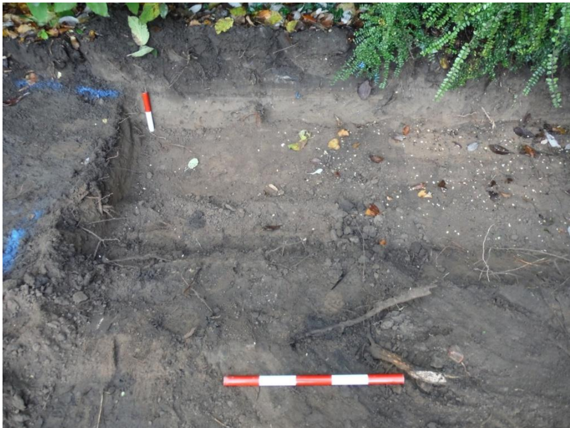
Plate 3 Outlining trench, 400mm BGL, with representative section, view west

This Report has been prepared solely for the person/party which commissioned it and for the specifically titled project or named part thereof referred to in the Report. The Report should not be relied upon or used for any other project by the commissioning person/party without first obtaining independent verification as to its suitability for such other project, and obtaining the prior written approval of York Archaeological Trust for Excavation & Research Limited ("YAT"). YAT accepts no responsibility or liability for the consequences of this Report being relied upon or used for any purpose other than the purpose for which it was specifically commissioned. Nobody is entitled to rely upon this Report other than the person/party which commissioned it. YAT accepts no responsibility or liability for any use of or reliance upon this Report by anybody other than the commissioning person/party.