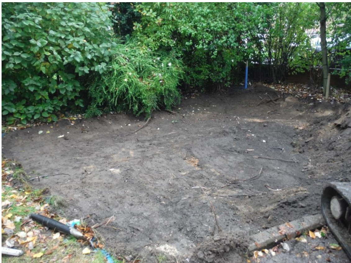
Plate 2 Initial stripped area, view north-west