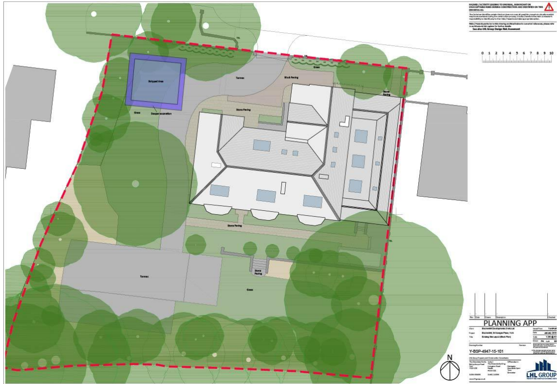
Figure 2 Location of stripped area (After drawing 16/00856/FUL Drawing No.: Y-BSP-4947-15-101)