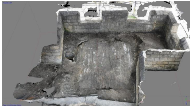
Figure 2 3D model of tower and brick vault arch within Agisoft software

The initial visit to the site was to record the central brick arch which had already been exposed by the contractors on site. This was done through photogrammetry, using a scaled sketch to locate and scale the photos. The photos were later inputted to software Agisoft to compile and create a 3D scaled image of the top of the tower, including the brick arch. A scaled photo was subsequently produced for this report.