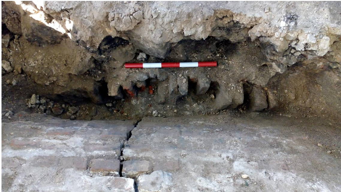
Plate 2 Junction of small room brick vault, at the top of the plate, with the main brick vault arch at bottom of plate

This Report has been prepared solely for the person/party which commissioned it and for the specifically titled project or named part thereof referred to in the Report. The Report should not be relied upon or used for any other project by the commissioning person/party without first obtaining independent verification as to its suitability for such other project, and obtaining the prior written approval of York Archaeological Trust for Excavation & Research Limited ("YAT"). YAT accepts no responsibility or liability for the consequences of this Report being relied upon or used for any purpose other than the purpose for which it was specifically commissioned. Nobody is entitled to rely upon this Report other than the person/party which commissioned it. YAT accepts no responsibility or liability for any use of or reliance upon this Report by anybody other than the commissioning person/party.