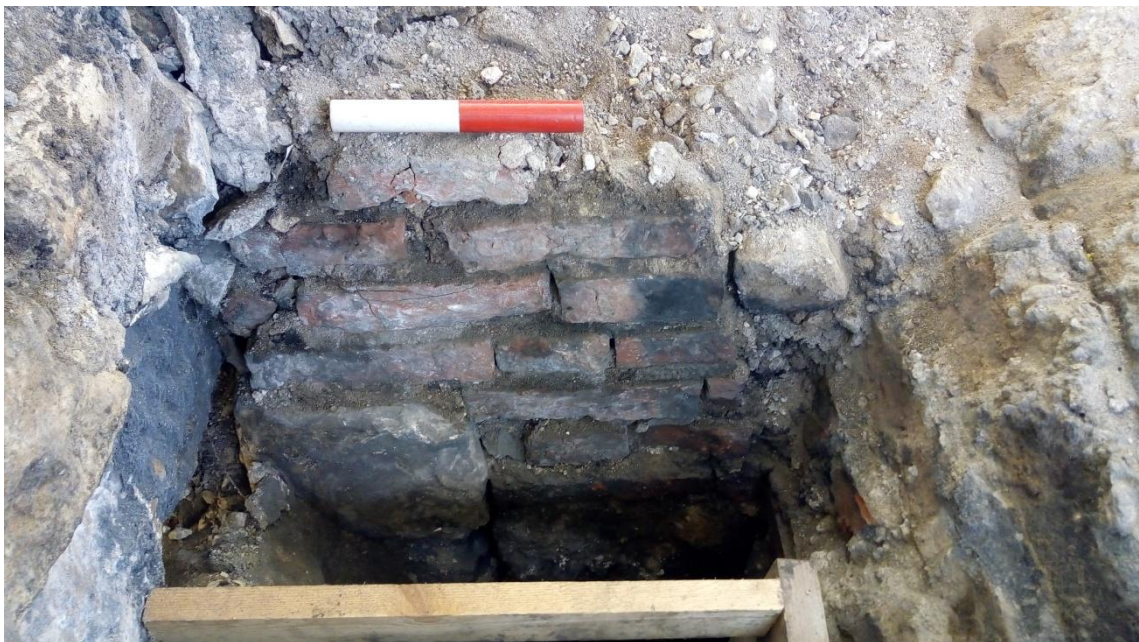
Plate 1 Upper brick section of chimney