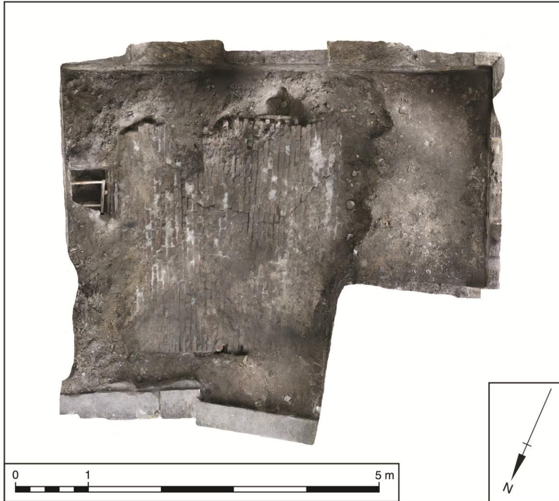
Figure 3 Scaled photo of the brick arched vault on top of Tower 39