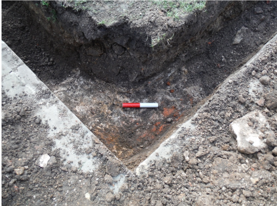
Plate 2 Structure (1006) facing south. 0.2m scale