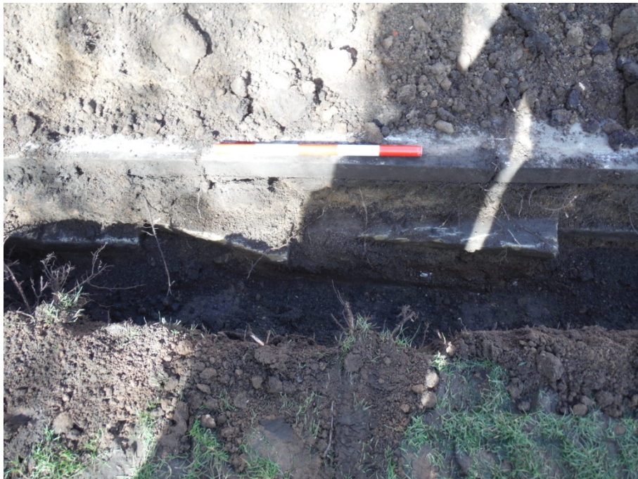
Plate 3 Section showing paving stones (1003) facing north west. 0.5m scale