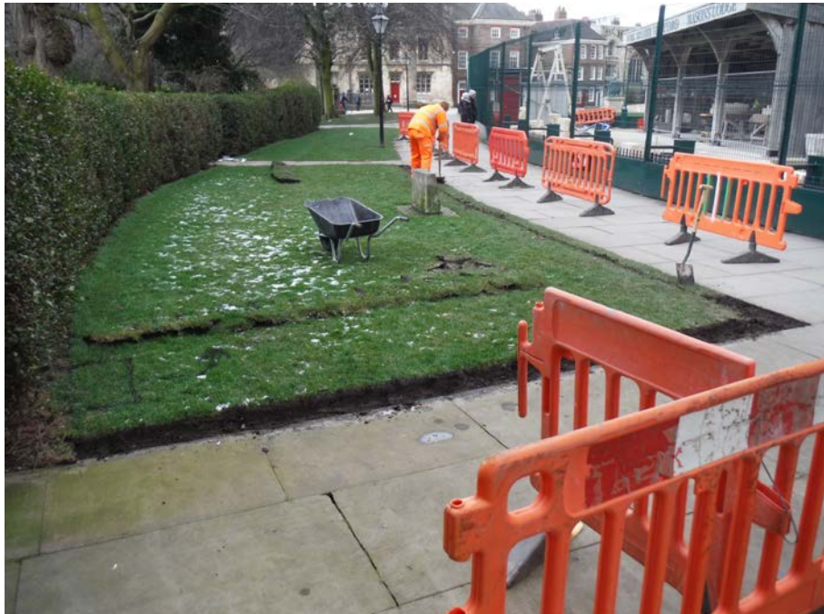
Plate 1 Queen's Path facing south west