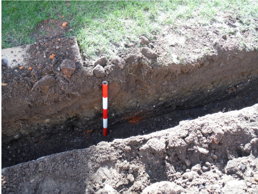
Plate 4 Section facing south east. 0.5m scale