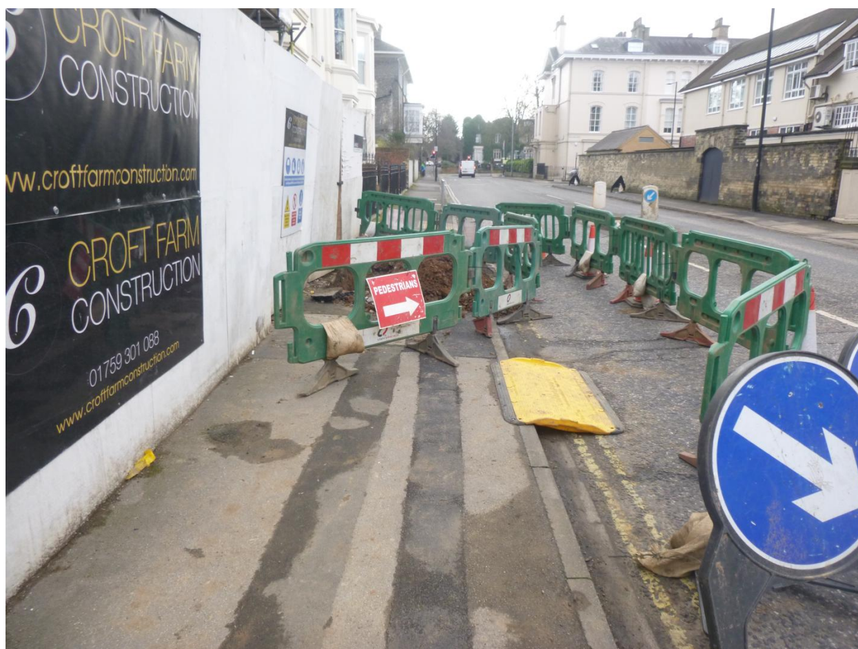
Plate 1 Dalton Terrace, looking south-east