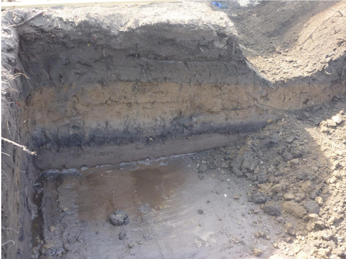
Plate 5 North West facing section of first soakaway showing several dumping and make up deposits.