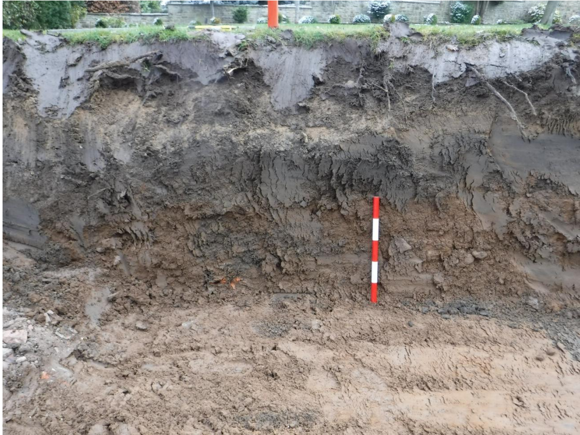
Plate 2 South West facing section of access road excavations.