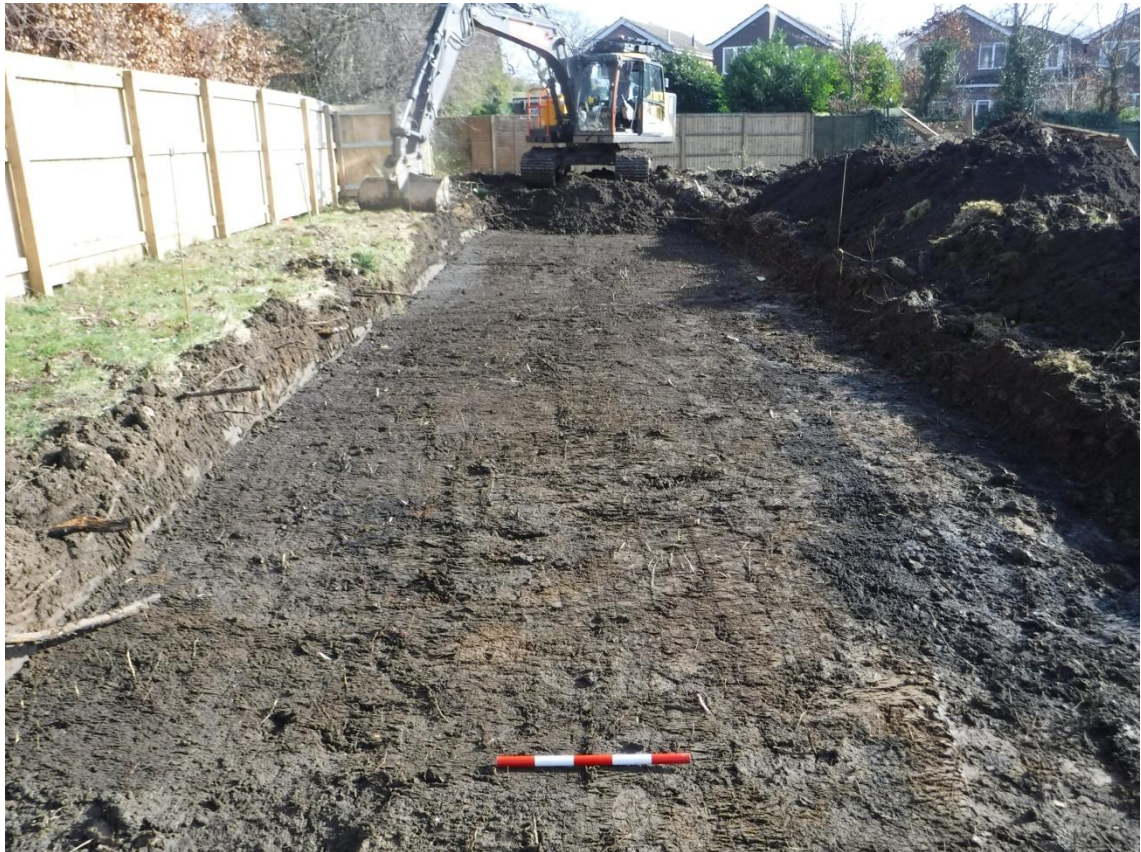
Plate 3 Initial stage of topsoil strip before weather forced the abandonment of observations of this stage of work.