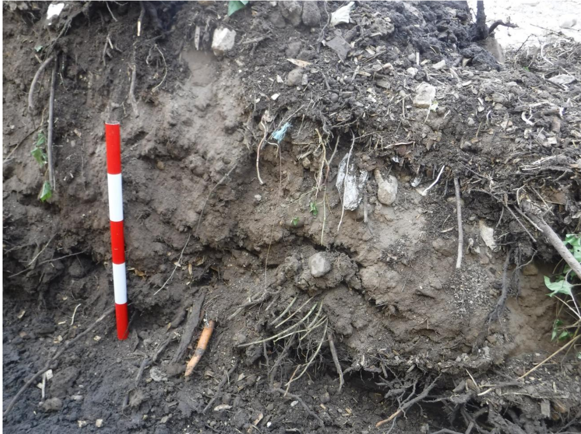
Plate 4 South West facing section of drainage run showing topsoil.