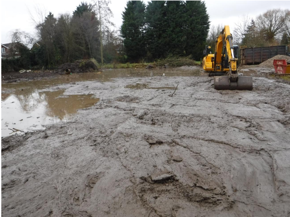
Plate 1 Showing waterlogged conditions during topsoil strip stage.