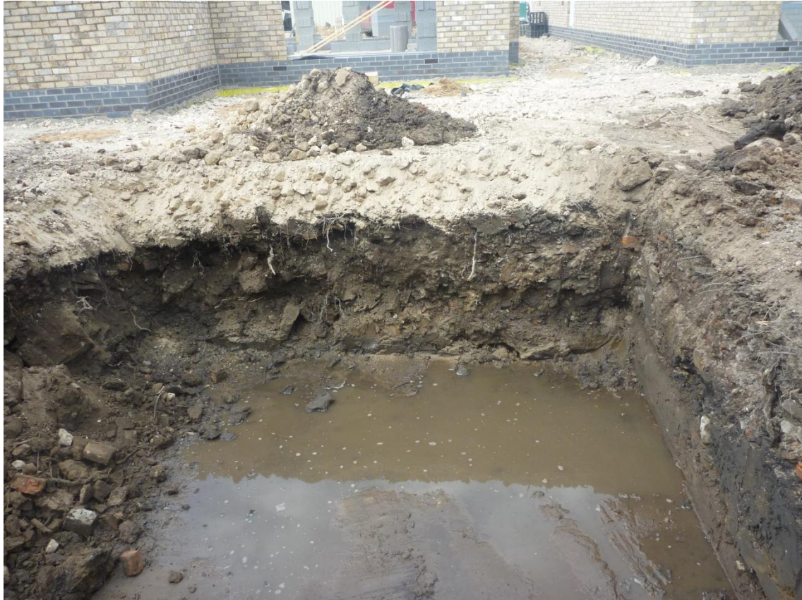
Plate 6 South East facing section of second soakaway showing modern brick and stone rubble dumps.