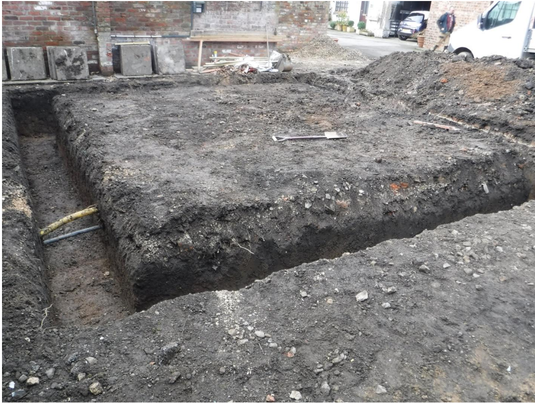
Plate 3 After excavation of double detached garage, viewing north-west