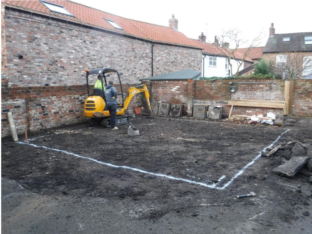
Plate 1 Site prior to excavation of double detached garage, viewing south-west.