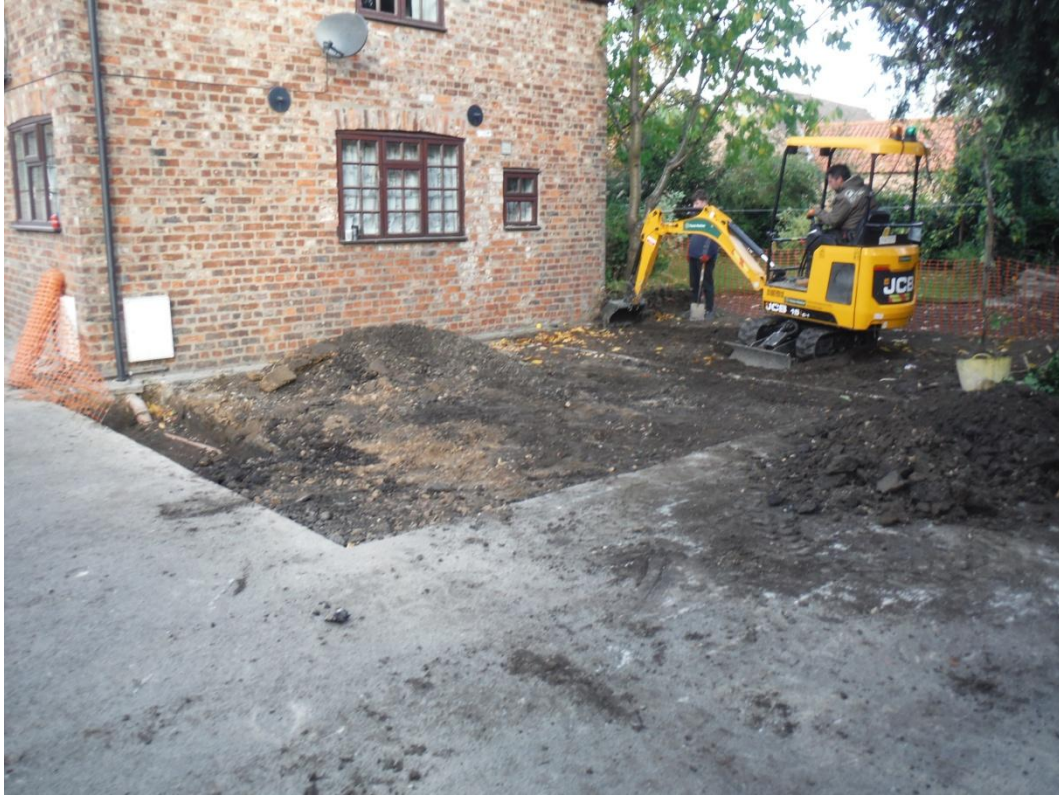
Plate 2 Site before excavation of property extension, viewing north-west.