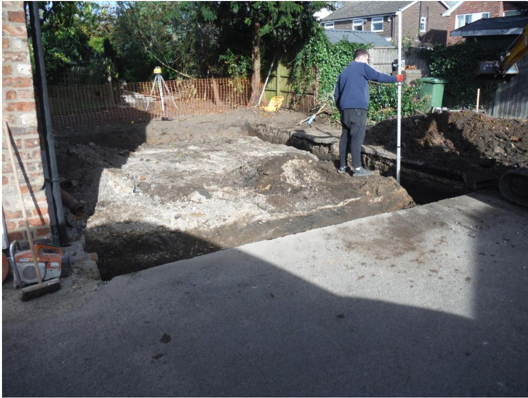
Plate 4 Area after excavation of the property extension, viewing north-east.