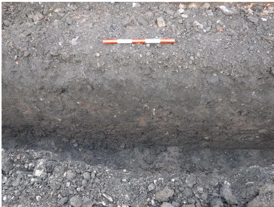
Plate 5 North facing representative section of the foundation cut for the double detached garage. Scale unit 100mm

This Report has been prepared solely for the person/party which commissioned it and for the specifically titled project or named part thereof referred to in the Report. The Report should not be relied upon or used for any other project by the commissioning person/party without first obtaining independent verification as to its suitability for such other project, and obtaining the prior written approval of York Archaeological Trust for Excavation & Research Limited ("YAT"). YAT accepts no responsibility or liability for the consequences of this Report being relied upon or used for any purpose other than the purpose for which it was specifically commissioned. Nobody is entitled to rely upon this Report other than the person/party which commissioned it. YAT accepts no responsibility or liability for any use of or reliance upon this Report by anybody other than the commissioning person/party.