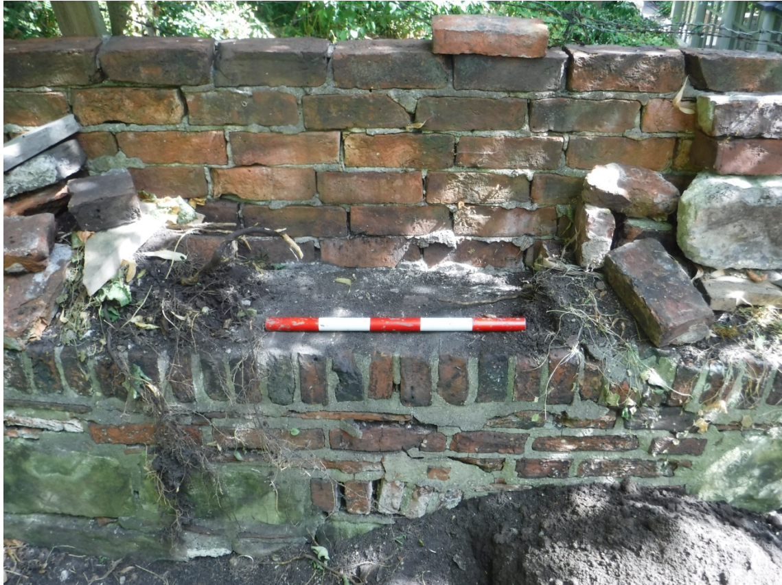
Plate 2 view northeast of later additions to the wall.

This Report has been prepared solely for the person/party which commissioned it and for the specifically titled project or named part thereof referred to in the Report. The Report should not be relied upon or used for any other project by the commissioning person/party without first obtaining independent verification as to its suitability for such other project, and obtaining the prior written approval of York Archaeological Trust for Excavation & Research Limited ("YAT"). YAT accepts no responsibility or liability for the consequences of this Report being relied upon or used for any purpose other than the purpose for which it was specifically commissioned. Nobody is entitled to rely upon this Report other than the person/party which commissioned it. YAT accepts no responsibility or liability for any use of or reliance upon this Report by anybody other than the commissioning person/party.