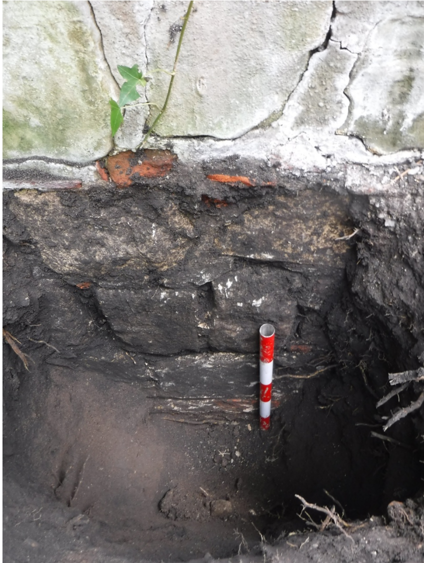
Plate 1, view of southwest facing wall