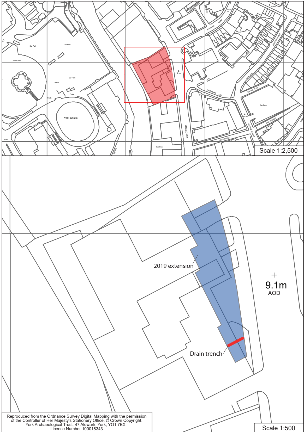
Fig. 2 Works location