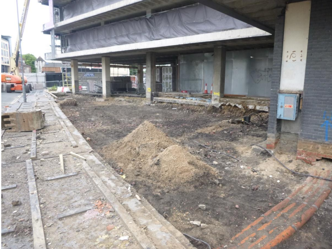
Plate 1 South-facing view of site following ground reduction.