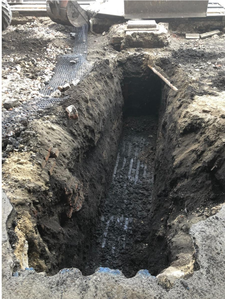
Plate 2 North-east facing view of the machine-excavated drain trench

This Report has been prepared solely for the person/party which commissioned it and for the specifically titled project or named part thereof referred to in the Report. The Report should not be relied upon or used for any other project by the commissioning person/party without first obtaining independent verification as to its suitability for such other project, and obtaining the prior written approval of York Archaeological Trust for Excavation & Research Limited ("YAT"). YAT accepts no responsibility or liability for the consequences of this Report being relied upon or used for any purpose other than the purpose for which it was specifically commissioned. Nobody is entitled to rely upon this Report other than the person/party which commissioned it. YAT accepts no responsibility or liability for any use of or reliance upon this Report by anybody other than the commissioning person/party.