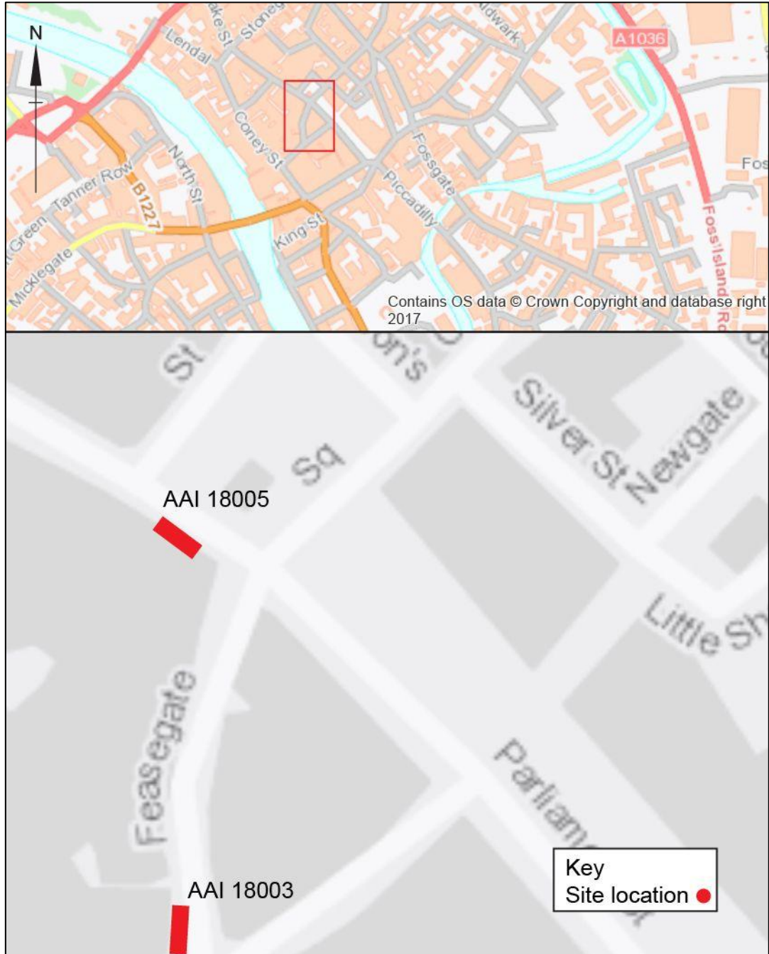
Figure 1 Site Location (1:10000 and 1:1000)