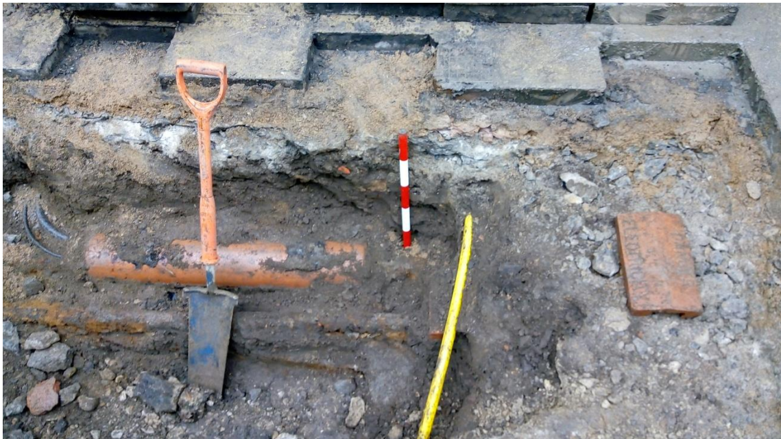
Plate 4 Trench at St Sampson's/Feasegate 0.5m scale