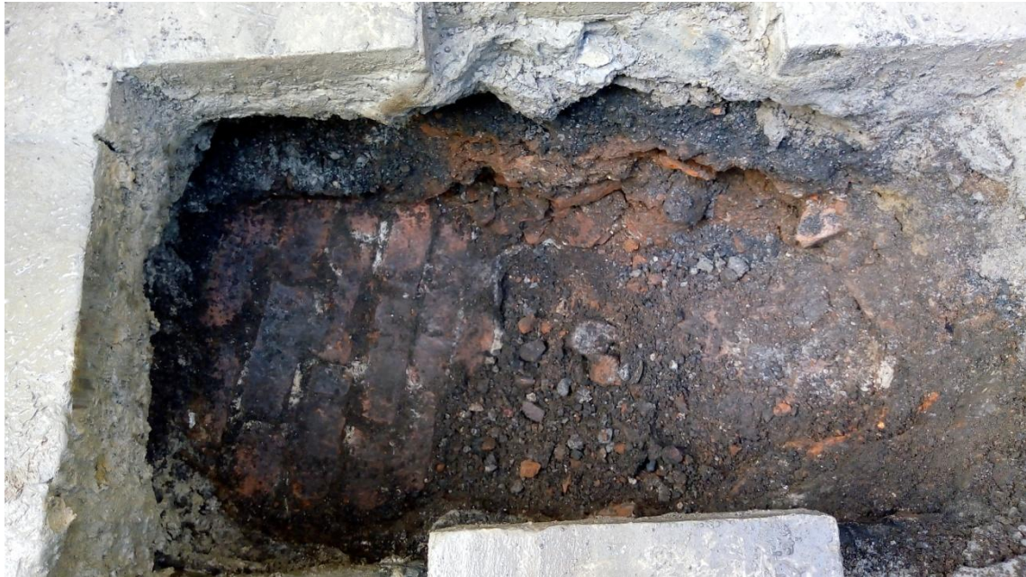
Plate 1 Brick vault at 18-19 Feasegate