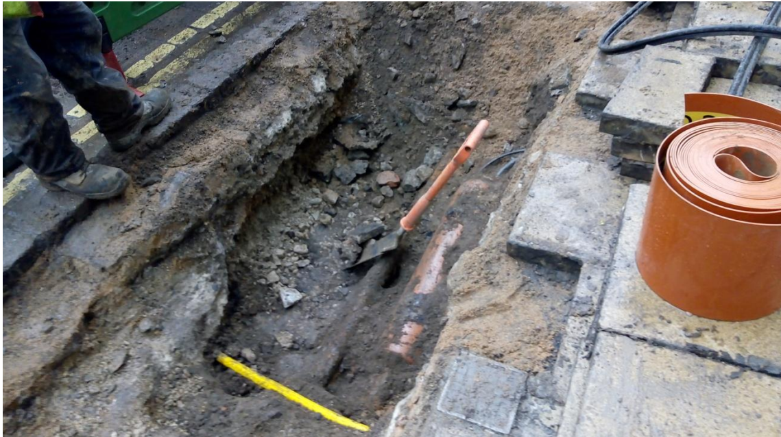
Plate 3 Trench at St Sampson's/Feasegate