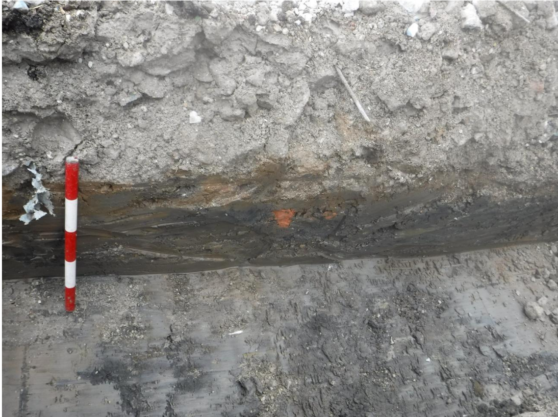
Plate 1 North facing section of ground beam trench showing pile mat, topsoil and make up with modern brick. Scale 500mm.

This Report has been prepared solely for the person/party which commissioned it and for the specifically titled project or named part thereof referred to in the Report. The Report should not be relied upon or used for any other project by the commissioning person/party without first obtaining independent verification as to its suitability for such other project, and obtaining the prior written approval of York Archaeological Trust for Excavation & Research Limited ("YAT"). YAT accepts no responsibility or liability for the consequences of this Report being relied upon or used for any purpose other than the purpose for which it was specifically commissioned. Nobody is entitled to rely upon this Report other than the person/party which commissioned it. YAT accepts no responsibility or liability for any use of or reliance upon this Report by anybody other than the commissioning person/party.