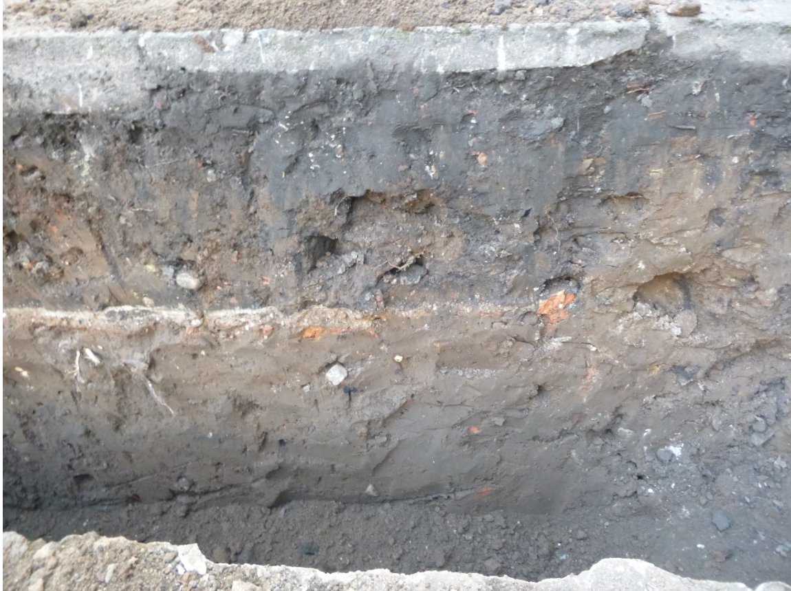
Plate 1 Section of trench behind removed retaining wall. To depth of c.800mm BGL.

This Report has been prepared solely for the person/party which commissioned it and for the specifically titled project or named part thereof referred to in the Report. The Report should not be relied upon or used for any other project by the commissioning person/party without first obtaining independent verification as to its suitability for such other project, and obtaining the prior written approval of York Archaeological Trust for Excavation & Research Limited ("YAT"). YAT accepts no responsibility or liability for the consequences of this Report being relied upon or used for any purpose other than the purpose for which it was specifically commissioned. Nobody is entitled to rely upon this Report other than the person/party which commissioned it. YAT accepts no responsibility or liability for any use of or reliance upon this Report by anybody other than the commissioning person/party.