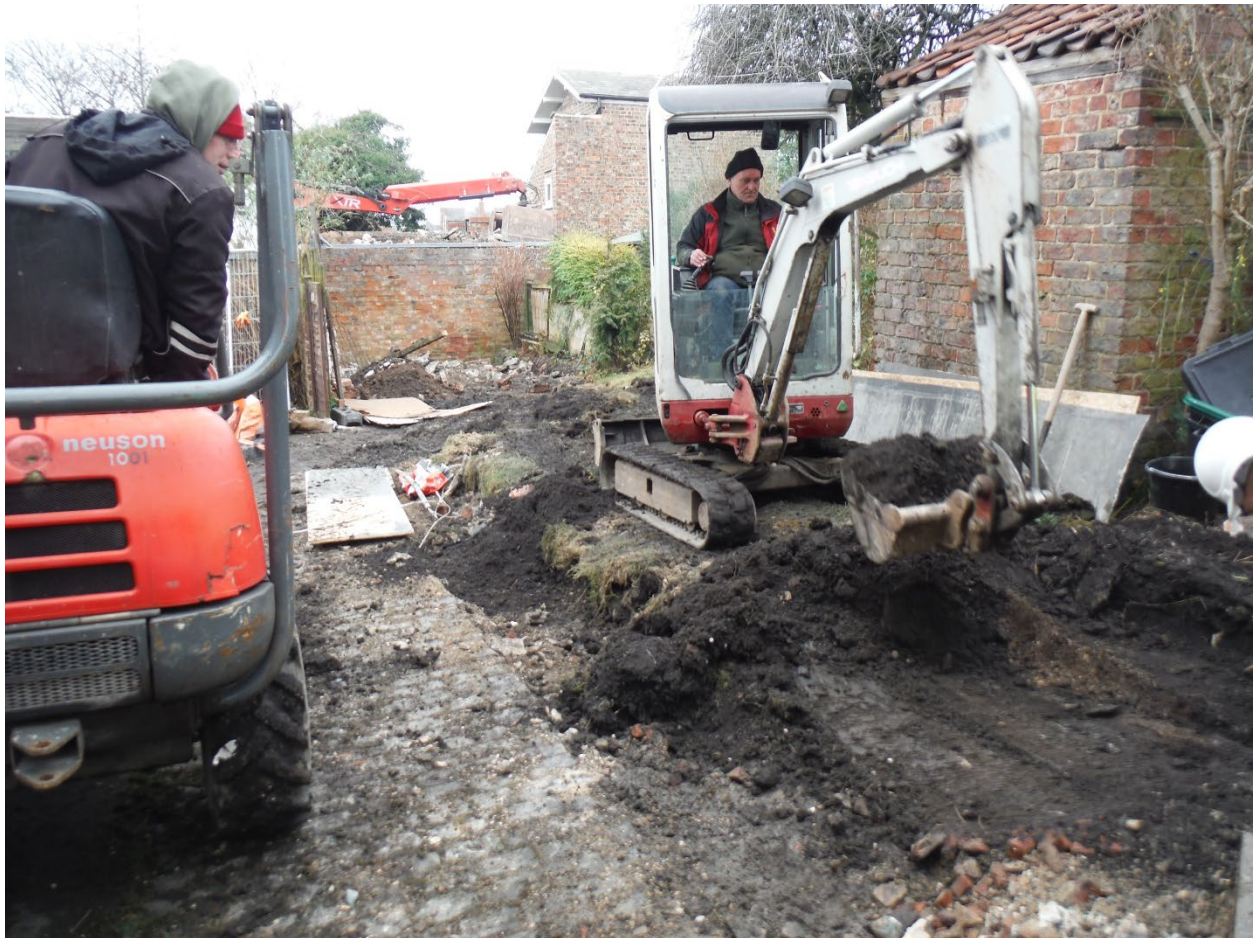
Plate 1 Area as excavation started, looking north-west