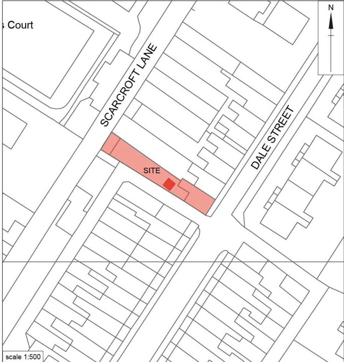
Figure 1 Site location & excavation location

Crown copyright reserved. Reproduced with the permission of OS on behalf of HMSO. Licence number 100018343