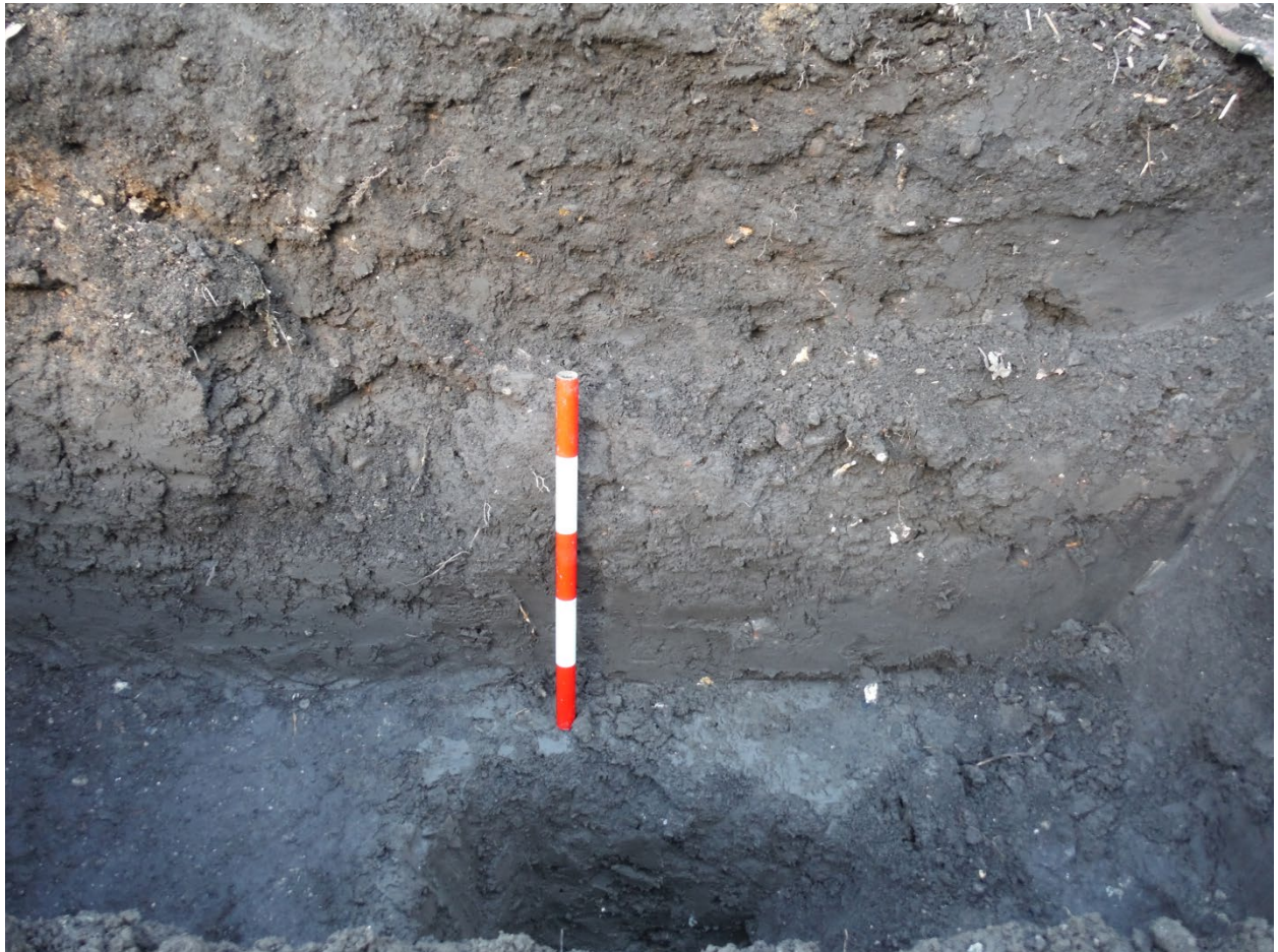
Plate 3 Upper portion of section, scale 0.5m, looking north-east