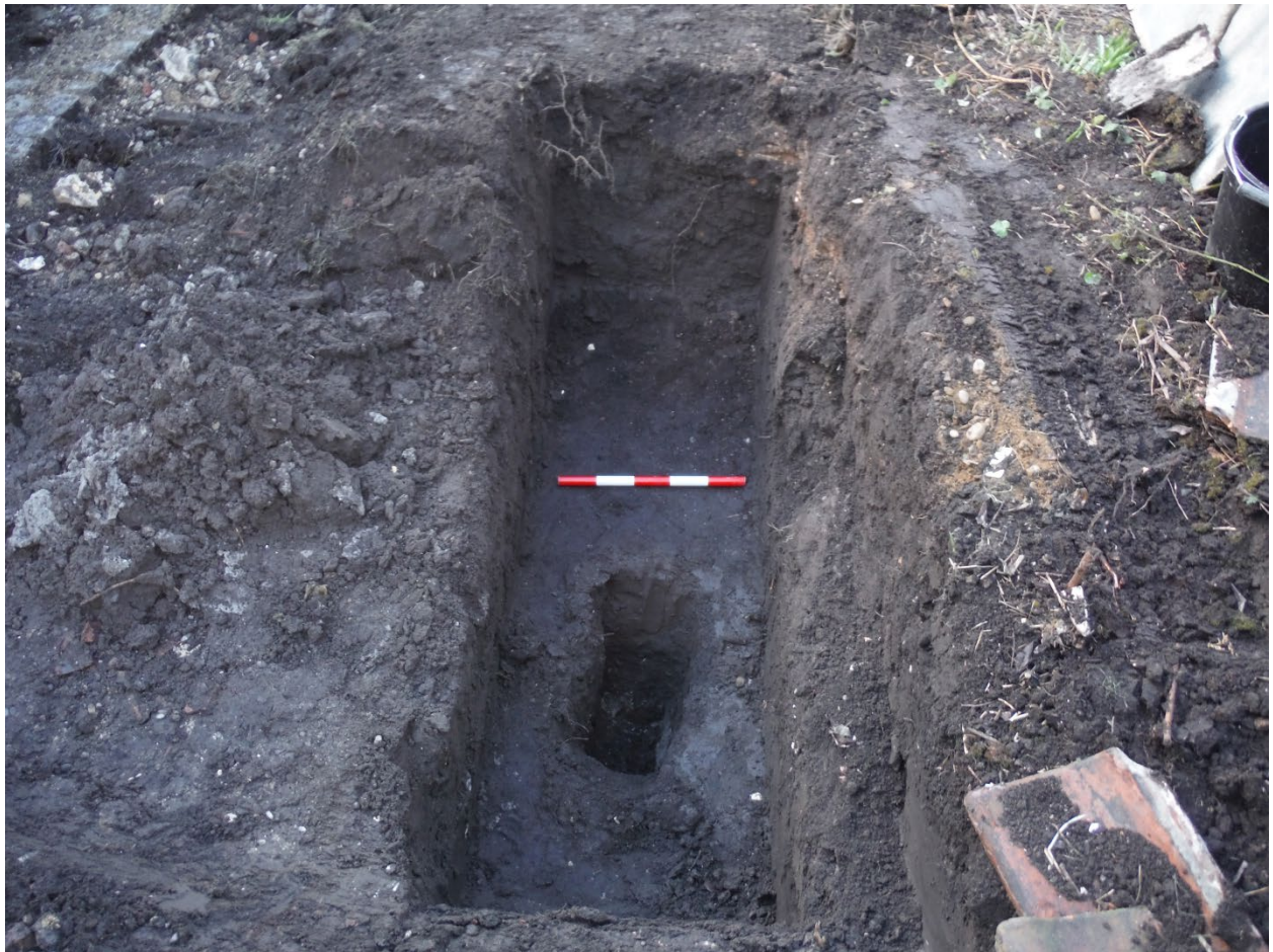
Plate 2 Area after excavation, scale 0.5m, looking north-west