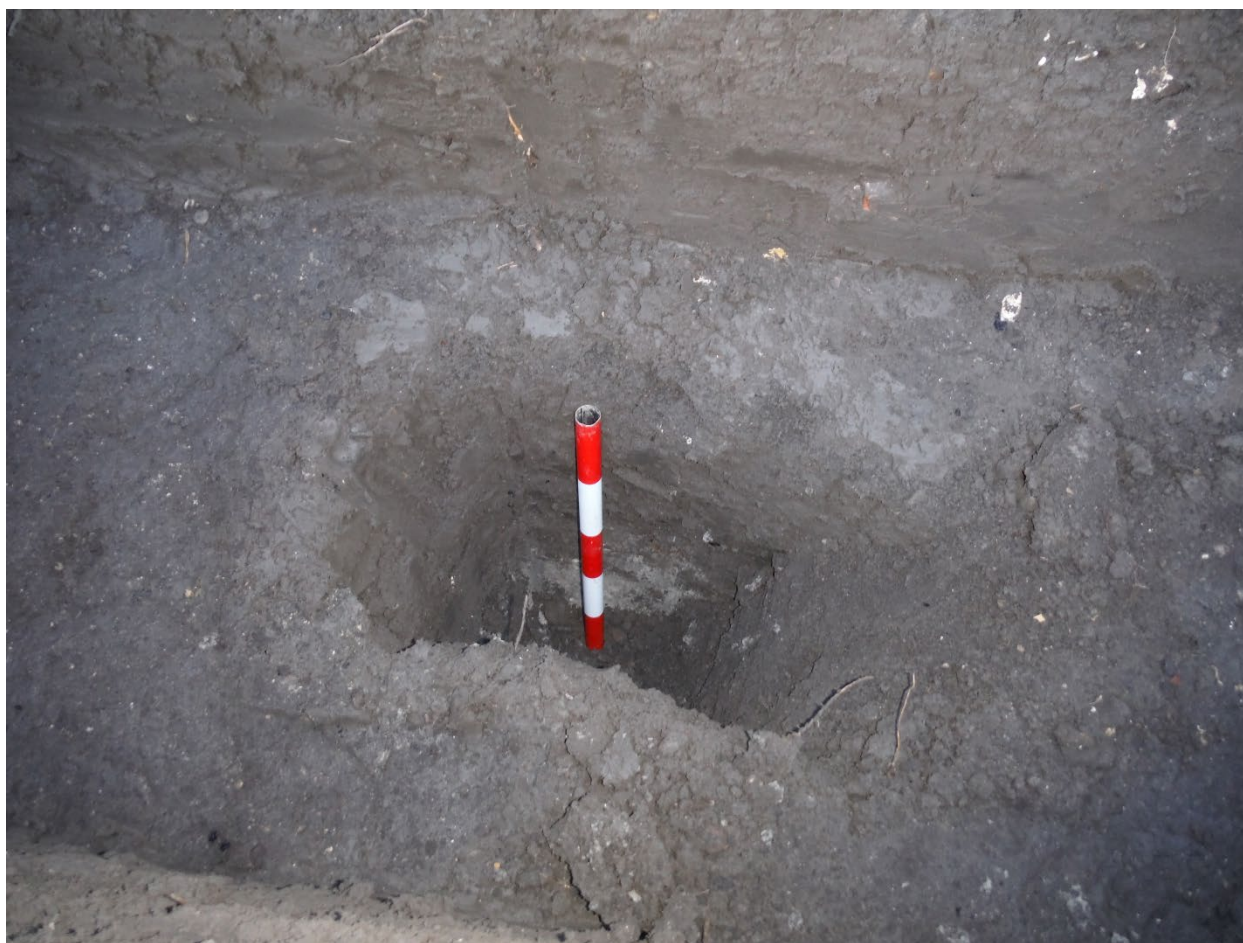
Plate 4 Lower portion of section, scale 0.5m, looking north-east

This Report has been prepared solely for the person/party which commissioned it and for the specifically titled project or named part thereof referred to in the Report. The Report should not be relied upon or used for any other project by the commissioning person/party without first obtaining independent verification as to its suitability for such other project, and obtaining the prior written approval of York Archaeological Trust for Excavation & Research Limited ("YAT"). YAT accepts no responsibility or liability for the consequences of this Report being relied upon or used for any purpose other than the purpose for which it was specifically commissioned. Nobody is entitled to rely upon this Report other than the person/party which commissioned it. YAT accepts no responsibility or liability for any use of or reliance upon this Report by anybody other than the commissioning person/party.