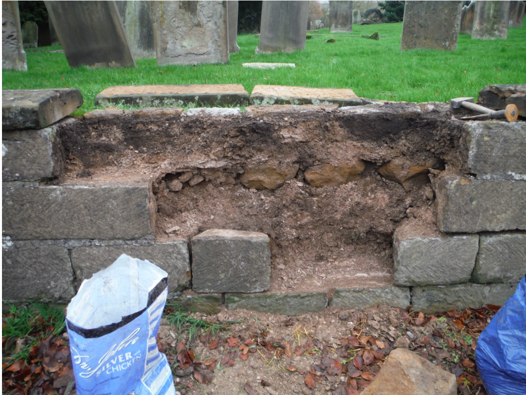
Plate 2. East facing view of the partially dismantled boundary wall.

This Report has been prepared solely for the person/party which commissioned it and for the specifically titled project or named part thereof referred to in the Report. The Report should not be relied upon or used for any other project by the commissioning person/party without first obtaining independent verification as to its suitability for such other project, and obtaining the prior written approval of York Archaeological Trust for Excavation & Research Limited ("YAT"). YAT accepts no responsibility or liability for the consequences of this Report being relied upon or used for any purpose other than the purpose for which it was specifically commissioned. Nobody is entitled to rely upon this Report other than the person/party which commissioned it. YAT accepts no responsibility or liability for any use of or reliance upon this Report by anybody other than the commissioning person/party.