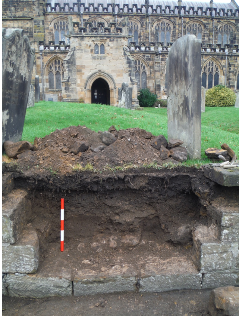
Plate 1. North facing view of the churchyard deposits exposed behind the boundary wall (0.50m scale).