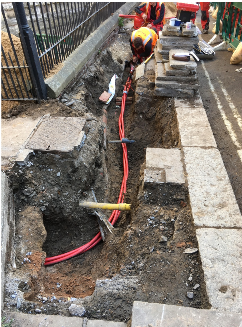
Plate 2. Working shot of the trench on Castlegate (facing south-east).

This Report has been prepared solely for the person/party which commissioned it and for the specifically titled project or named part thereof referred to in the Report. The Report should not be relied upon or used for any other project by the commissioning person/party without first obtaining independent verification as to its suitability for such other project, and obtaining the prior written approval of York Archaeological Trust for Excavation & Research Limited ("YAT"). YAT accepts no responsibility or liability for the consequences of this Report being relied upon or used for any purpose other than the purpose for which it was specifically commissioned. Nobody is entitled to rely upon this Report other than the person/party which commissioned it. YAT accepts no responsibility or liability for any use of or reliance upon this Report by anybody other than the commissioning person/party.