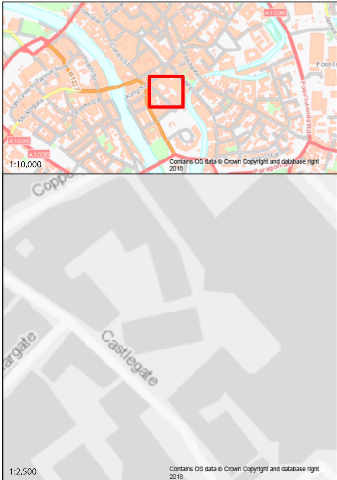
Fig. 1 Site location