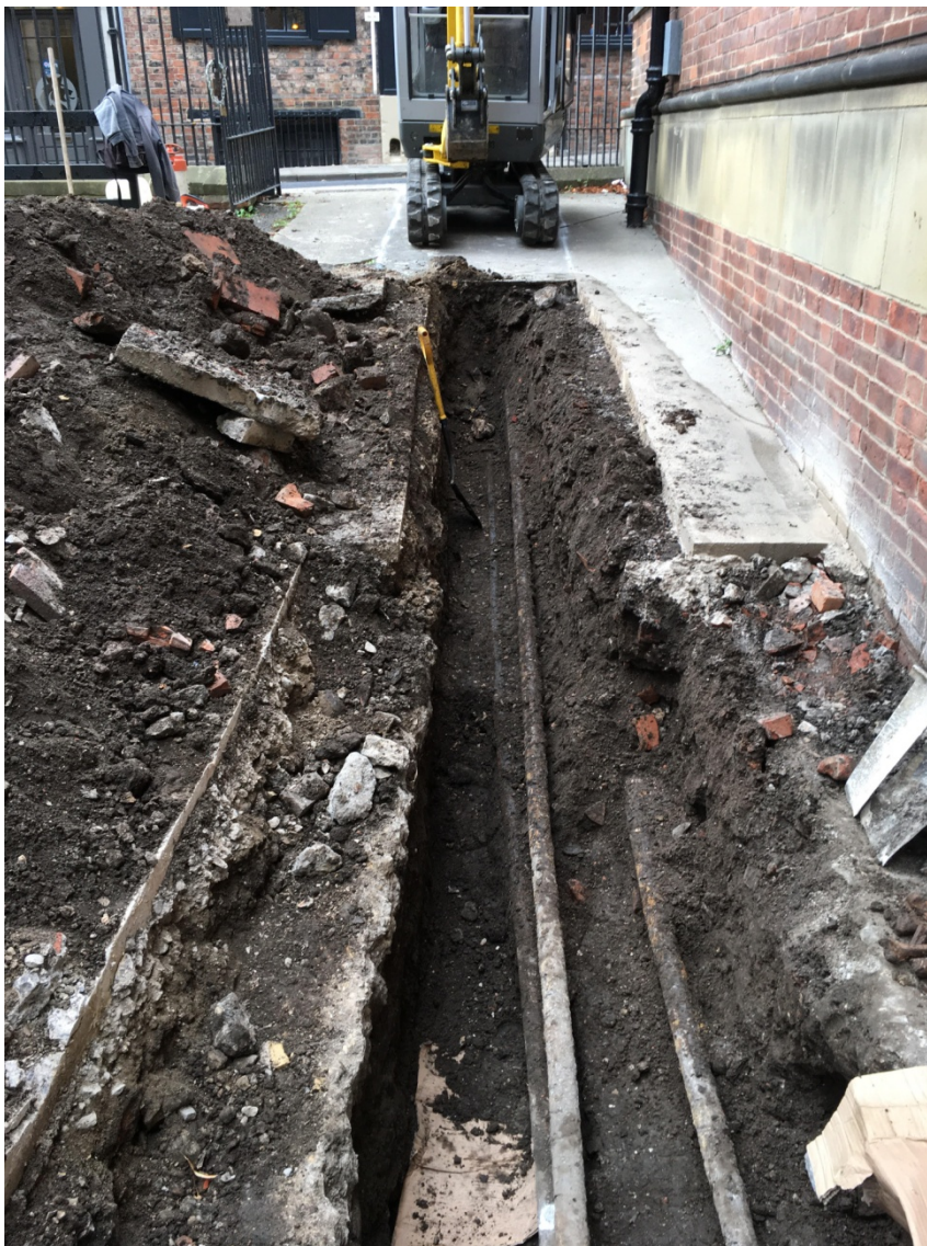
Plate 1. South-west facing view of the excavation. An in-situ burial was observed below the board at the bottom of the image.